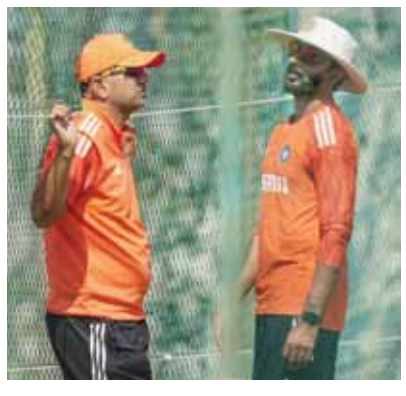
Shah said here on the sidelines of the renaming function of the Saurashtra Cricket Association Stadium on Wednesday night. "Why are you worried about a contract for

Rahul Dravid will continue to remain in the position of India's head coach till the upcoming T20 World Cup in June this year, confirmed BCCI secretary Jay Shah. Dravid's contract ended after the ODI World Cup final last year, but he was asked to continue in his role along with other support staff for the December-January tour to South Africa without finalising the tenure. But Shah said he held an initial talk with Dravid here before arriving at the decision to retain the former captain's services till the ICC showpiece to be held in the West Indies and the USA. "After the (2023) World Cup, Rahul bhai had to leave for the South Africa tour immediately. We did not get to meet in between which finally happened today,"