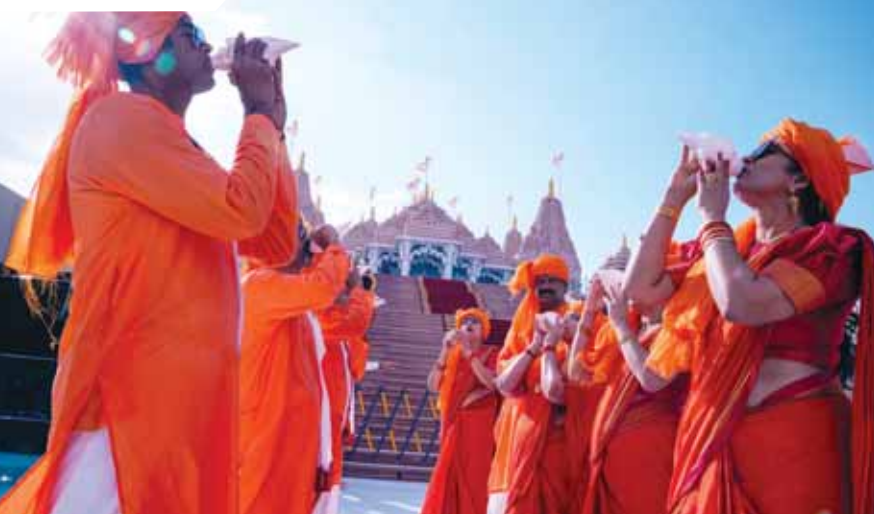
Devotees blow conches on the opening of the first stone-built Hindu temple in the Middle East, in Abu Mureikha