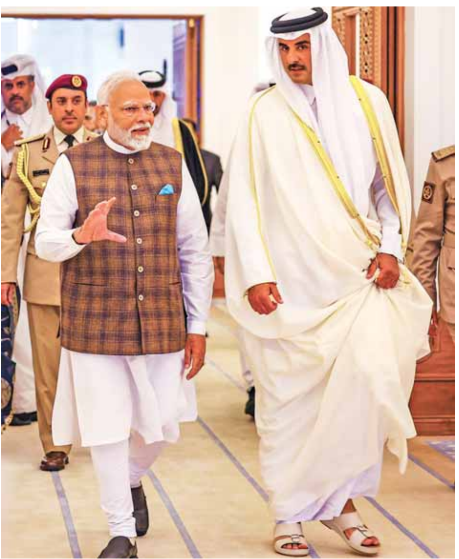
Prime Minister Narendra Modi with the Emir of Qatar, Sheikh Tamim bin Hamad Al Thani, in Doha on Thursday