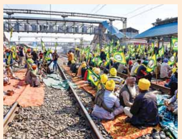
Members of various organisations block railway tracks at Rajpura as they stage 'rail roko' protest in support of farmers agitating at Punjab-Haryana Shambhu border, in Patiala, on Thursday

Farmers in Punjab began their four-hour "rail roko" stir by squatting on rail tracks at some locations, causing inconvenience to passengers on Thursday even as the third round of meeting between the Centre and farmers' organisations in Chandigarh went on till late at night. There were no reports of clashes between farmers and Haryana security personnel at the two Punjab and Haryana border points — Shambhu and Khanauri — on the third day of the protest. Haryana Chief Minister Manohar Lal Khattar criticised the "method" adopted by Punjab farmers to press their demands, suggesting that they were attempting to march to Delhi like an army on the offensive. Amid a standoff between protesters and security personnel at two border points of Punjab and Haryana, three Union Ministers and representatives of the farmers' unions held a discussion in Chandigarh on Thursday night. Union Agriculture and Farmer Welfare Minister Arjun Munda, Commerce and Industry Minister Piyush Goyal, and Minister of State