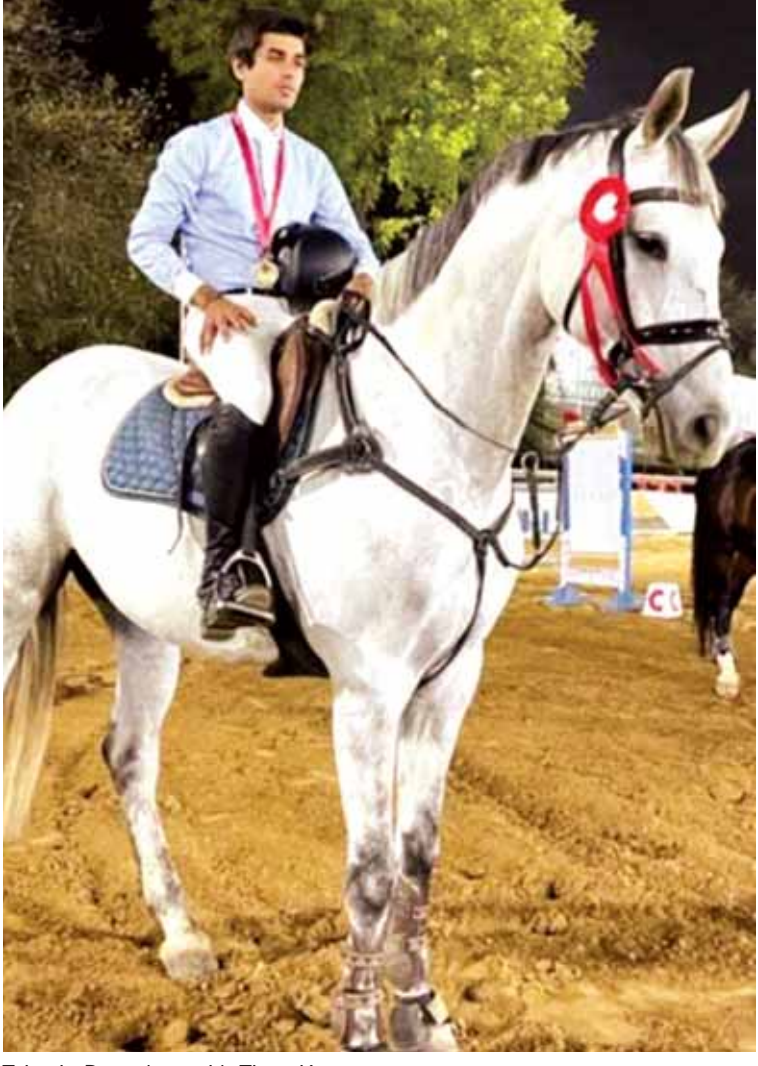
Tejas in Bengaluru with Tiens Key