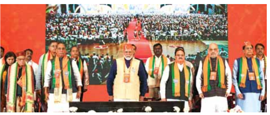
Prime Minister Narendra Modi with Union Ministers Rajnath Singh, Amit Shah and Piyush Goyal, BJP national president JP Nadda, veteran BJP leader Murli Manohar Joshi and others during the BJP National Council meeting at the Bharat Mandapam in New Delhi on Saturday