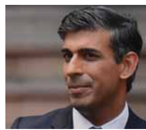
plan and would take the country backwards. He said: "A vote for anyone other than the Conservatives will just help Starmer. The reason we will stick to the plan and the reason I, unlike Keir Starmer, am willing to make difficult decisions to address the long-term problems our country faces is because a strong economy is the bedrock upon which a successful country is built. "The choice at the election later this year will be between this Conservative vision for Britain and a Labour Party that would just take us back to square

ensure a brighter future for our country," Sunak wrote. "I know that the last year has not been easy. I understand why people feel exhausted with politics. I get why people choose to stay at home rather than come out in a by-election that won't change the government," he said and added, "But later this year, we will have a general election that will decide who governs our country. I am confident that by then we will have made more progress that the plan will be delivering the security and opportunity that people crave." This direct plea to the voters comes amid some tough political times for the British Prime Minister, who is under pressure from within his party to change course before it is too late. Drawing a clear divide between his leadership and that being proposed by Labour Leader Keir Starmer, Sunak asserted that his opponent had no