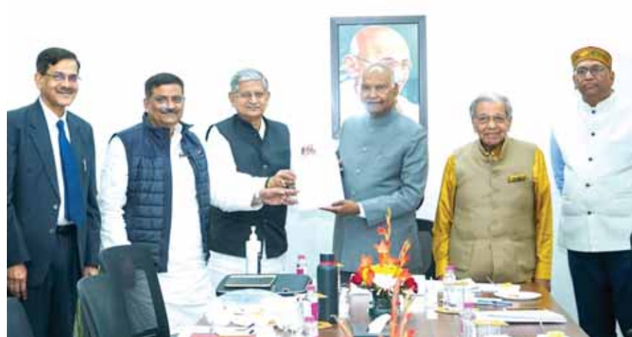
JD(U) leader Rajiv Ranjan Singh with others during a meeting with 'One Nation, One Election' Committee Chairperson and former President of India Ram Nath Kovind

interior areas where the quality of drugs may differ. "From the past trends it is observed that there is no defined methodology for sample selection and location of sampling etc and was done randomly with the individual knowledge of drug inspectors," the document stated. "This guideline is mainly focused to utilize available information and identified risks for selection of sample and location to cover vast variety of drugs, cosmetic and medical devices moving in the market from manufacturing facility, wholesale outlet, retail outlet, government distribution channel etc. In urban, suburban, and rural locations," it stated.