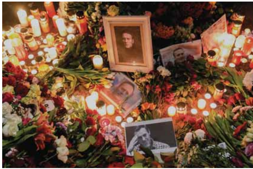
The tributes were removed overnight, but people continued trickling in with flowers on Saturday. In Moscow, a large group of people chanted "shame" as police dragged a screaming woman from the crowd, video shared on social media showed.