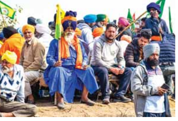
Farmers at the Punjab-Haryana Shambhu border during their 'Delhi Chalo' protest, near Patiala district

As the Centre considers establishing a panel involving all stakeholders to address the ongoing farmers' protest and discuss issues, farmer leaders on Saturday demanded that the Centre bring an Ordinance to provide a legal guarantee for Minimum Support Price (MSP), amid protests in Punjab by farmers. This demand comes a day before the fourth round of talks between farm leaders and Union ministers regarding their various demands.