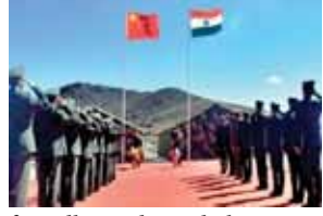
friendly and cordial atmosphere.

India and China reiterated their resolve to maintain peace and tranquility on the ground in border areas along the Line of Actual Control (LAC) in eastern Ladakh during the 21st round of talks between Corps Commanders of the two armies. The talks were held at the Chushul-Moldo border meeting point on February 19, Ministry of External Affairs(MEA)said here in a statement on Wednesday.