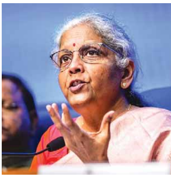
effects of unauthorised lending through online apps and

PTI ■ NEW DELHI, Finance Minister Nirmala Sitharaman on Wednesday asked financial sector regulators, including the Reserve Bank of India (RBI), to take further measures to check spread of unauthorised lending through online apps. Addressing the 28th meeting of the Financial Stability and Development Council (FSDC) here, Sitharaman also asked regulators to maintain constant vigil and be proactive towards detecting emerging financial stability risks, given the domestic and global macro-financial situation. The FSDC deliberated on issues related to macro financial stability and India's preparedness to deal with them, an official statement said after the meeting.