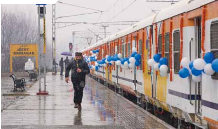
J&K's first electric train during its flagging off ceremony, at Srinagar railway station, in Jammu & Kashmir