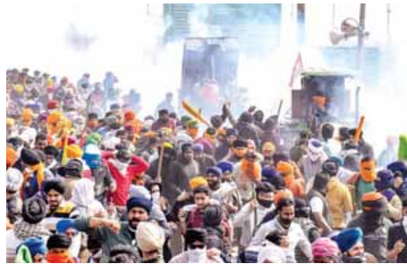
Smoke rises from tear gas being fired upon the protesting farmers during their 'Delhi Chalo' march, near the Punjab-Haryana Shambhu Border in Patiala district on Wednesday