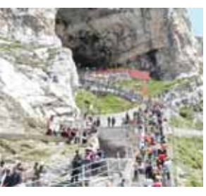
Jammu and Kashmir and facilitate the pilgrims in their journey to the holy cave from both the Pahalgam and the Baltal axis each year. Asserting that the labour

Authorities here reviewed an action plan for registration of service providers for the upcoming pilgrimage to the holy cave shrine of Amarnath in south Kashmir Himalayas, an official said on Thursday.