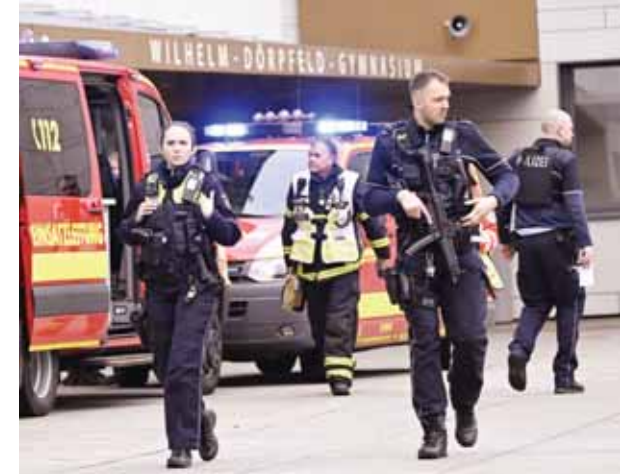
Police and ambulances at the scene of an attack, at the Wilhelm Dörpfeld school, in Wuppertal, Germany, Thursday.

Five people were injured in an incident Thursday at a school in the western German city of Wuppertal and a suspect was arrested, police said. The incident took place at the Wilhelm Dörpfeld high school in the city's Elberfeld district. Police said there was no shooting in the incident, German news agency dpa reported, but gave no further information. The Bild newspaper, which didn't name sources, said it was a knife attack. Police said they deployed large numbers of officers to the scene. They said the suspect was injured. Wuppertal is a city of some 350,000 people near Duesseldorf and Cologne.