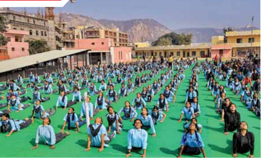
Schoolchildren perform Surya Namaskar on the occasion of 'Surya Saptami', in Jaipur