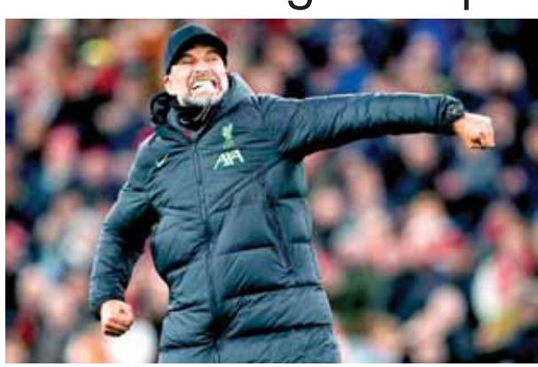
reportedly interested in his services. One thing's for sure - it's highly unlikely Leverkusen will be able to keep hold of him. It appears to be just happenstance that three of Europe's leading teams find themselves in the same predicament with their coaches, with three months still to play this season. The pressures of the job have taken their tolls on both Klopp and Xavi, but in different ways. Klopp said he was worn out

after such a long time (nine years) in the role - he compared himself to a sports car whose tank needle has gone down - while Xavi, who has been in charge at Barca for only a little over two years, cited mental fatigue and an "unpleasant" atmosphere at a club that has been weighed down by financial turmoil. Tuchel is less than a year into his time at Bayern and his departure seems to be mostly down to bad results, which have raised the prospect of the club's first season without a trophy in 12 years. Klopp, the oldest of the trio at age 56, is the only one leaving fully on his own terms and says he won't return to soccer management for at least a year. That would be the same length of sabbatical taken by Guardiola after leaving Barcelona in 2012. "Sometimes you feel you need to breathe," Guardiola said. "You need to take a break, take a step back." The City manager knows exactly what Xavi is going