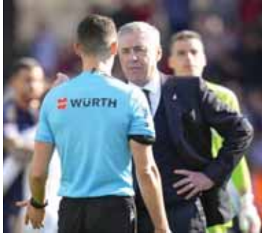
central defender in recent matches. Lucas Vazquez is expected to replace

AP ■ MADRID Coach Carlo Ancelotti has to deal with two more absences to an already depleted squad when Spanish league leader Real Madrid hosts Sevilla this weekend. Ancelotti won't be able to count on suspended midfielder Eduardo Camavinga and defender Dani Carvajal on Sunday. Carvajal was sent off last Sunday at the end of the team's 1-1 draw at Rayo Vallecano, while Camavinga received his fifth yellow card to prompt an automatic suspension. Madrid has a six-point lead over second-placed Girona, which hosts Rayo on Monday. Madrid is eight points ahead of third-placed Barcelona and 11 points ahead of fourth-placed Atletico Madrid. Five Madrid players remain out injured, including Jude Bellingham with a sprained ankle and defender Antonio Rüdiger because of a thigh injury. Nursing long-term knee ligament injuries are goalkeeper Thibaut Courtois and central defenders David Alaba and Éder Militão. Ancelotti has been improvising using midfielder Aurélien Tchouaméni as a