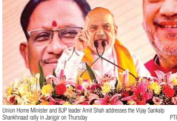
Union Home Minister and BJP leader Amit Shah addresses the Vijay Sanikalp Shakraudh rally in Janjgir on Thursday

Union Home Minister Amit Shah on Thursday urged the people of Chhattisgarh to elect Prime Minister Narendra Modi for a third term in office to make India a developed nation, and 'Bharat Mata' a 'Vishwa Guru'.