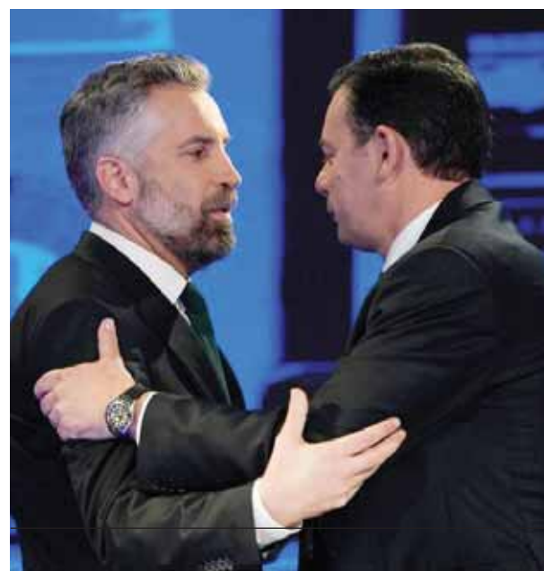
Socialist Party leader Pedro Nuno Santos, left, and Luis Montenegro, leader of the Social Democratic Party, greet each other before an election TV debate in Lisbon, Portugal. The centre-left Socialist Party and centre-right Social Democratic Party have alternated in power for decades. But they are unsure of how much support they might need from smaller rival parties to form a government after the March 10 vote.

Corruption scandals have cast a shadow over the ballot. They have also fed public disenchantment with the country's political class as Portugal prepares to celebrate 50 years of democracy, following the Carnation Revolution that toppled a rightist dictatorship on April 25, 1974. The election is