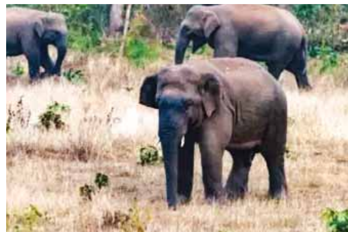
technology, an AI-based app, 'Chhattisgarh Elephant Tracking and Alert', which, they said, has played a crucial role in preventing human-elephant conflicts by promptly alerting people about elephant movements. They explained that this

Amid a disturbing surge in human-animal conflicts nationwide, the Udanti Sitanadi Tiger Reserve in Chhattisgarh offers a glimmer of hope with no reported loss of human life due to wild animal attacks in the past year. Udanti and Sitanadi are two wildlife sanctuaries combined, covering a total area of 1842.54 square kilometres. It was declared a tiger reserve back in 2009. Officials from the tiger reserve have attributed zero human-animal conflict to proactive measures implemented to mitigate such incidents and ensure the safety of both humans and wildlife. They also credited this positive scenario to leveraging cutting-edge AI