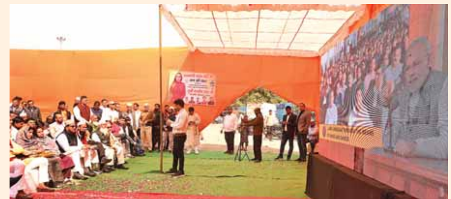
Delhi BJP organises a programme in Old Delhi to listen to PM's Mann Ki Baat