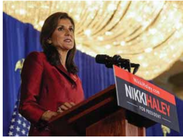
Republican presidential candidate former UN Ambassador Nikki Haley speaking at an election night event, Saturday in Charleston, S.C.

Saturday's result now places the onus on Haley, who continued in her concession speech to insist she has no plans to drop out of the race — a move that she said would leave the Republican voters in the upcoming primary states with "a Soviet-style