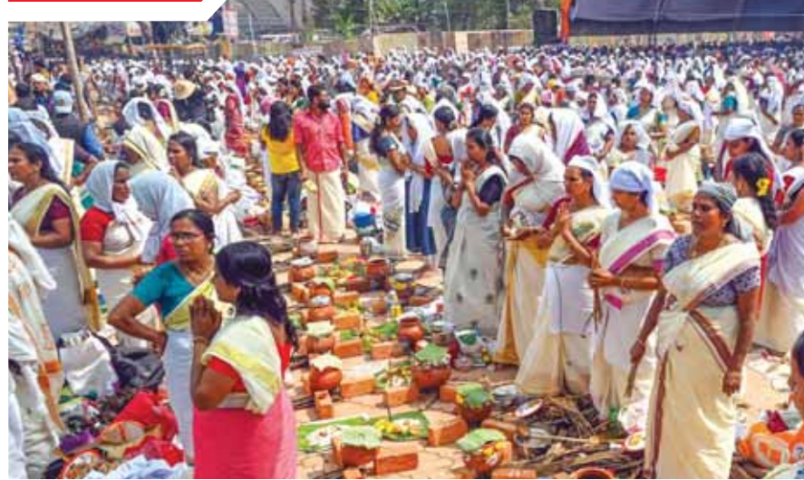
Women devotees offer prayers during the Attukal Pongala festival, in Thiruvananthapuram