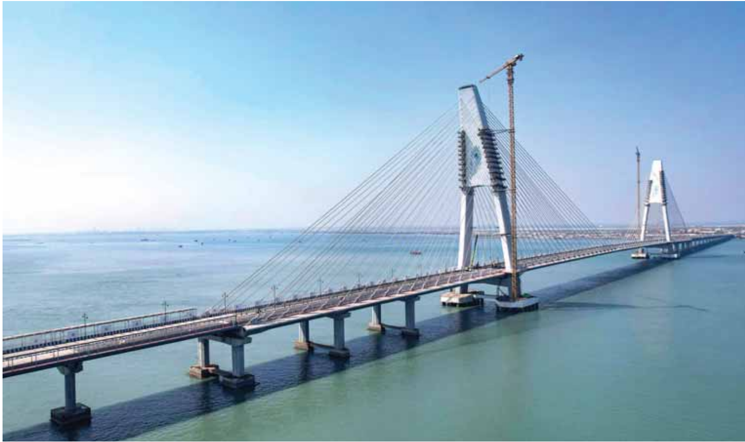
Prime Minister Narendra Modi on Sunday inaugurated 'Sudarshan Setu', the country's longest cable-stayed bridge of 2.32 km, on the Arabian sea connecting Beyt Dwarka island to mainland Okha in Gujarat's Devbhumi Dwarka district. Modi began his day by offering prayers at Lord Sri Krishna temple at Beyt Dwarka. He later inaugurated the four-lane cable-stayed bridge called the 'Sudarshan Setu', which boasts a unique design, featuring a footpath adorned with verses from Srimad Bhagavad Gita and images of Lord Krishna on both sides. The bridge, including 900 metres of central double span cable-stayed portion and a 2.45 km long approach road, has been constructed at a cost of ₹979 crore, as per an official release PTI