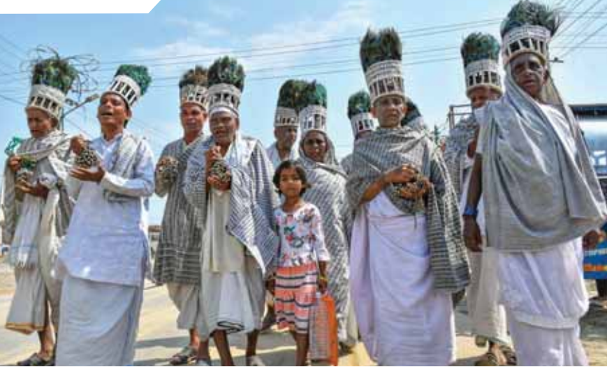
Members of the Ramnami religious movement arrive at the Sangam during the Magh Mela festival, in Prayagraj