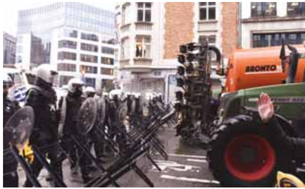
Police stand behind a barricade during a protest of farmers in the European Quarter outside a meeting of EU agriculture ministers in Brussels on Monday.

die of it," said one. Farmers dumped a trailer load of tyres a few hundred metres (yards) from the European Council building, and police brought in water cannons before the piles of