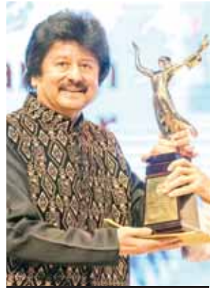
MAY 17, 1951 – FEB 26, 2024