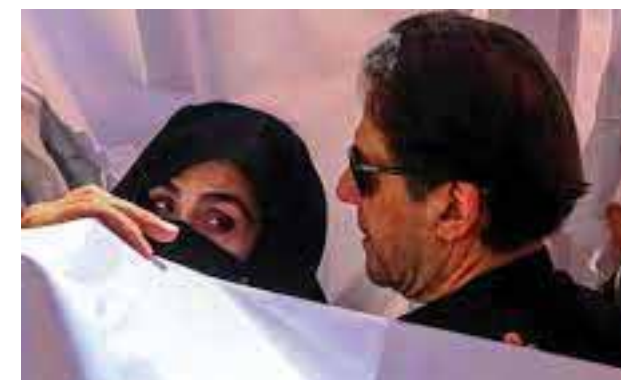
ISLAMABAD/LAHORE