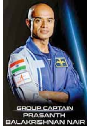
GROUP CAPTAIN PRASANTH BALAKRISHNAN NAIR

mission. "They are not just four names or four human beings; they are the four powers that are going to take the aspirations of 140 crore Indians to space. An Indian is going to space after 40 years. This time, the time is ours, the countdown is ours, and the rocket is also ours," said Modi while addressing Team ISRO after giving astronaut wings to the four Test Pilots. The Prime Minister made a special request to the media in the country. "These astronauts are still undergoing rigorous training and physical exercises. We have to ensure that their preparations do not get disturbed or disrupted because of publicity, hence please leave them alone until