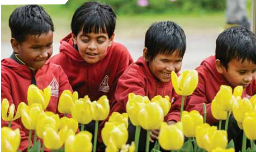
Divyangjan (persons with disability) during a 'Purple Fest' at the Amrit Udyan, in New Delhi