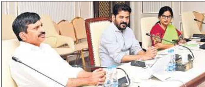
CM Revanth at Dharani Committee's review on Saturday

The CM expressed serious concern about the safety of the land records of lakhs of farmers which is now in the hands of foreign companies. Attending a review meeting of the Dharani Committee on Saturday at the Secretariat, the Chief Minister blamed the BRS government for