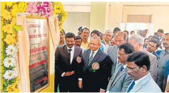
Telangana High Court Chief Justice Alok Aradhe inaugurating Second Additional Civil Judge court in Suryapet on Saturday