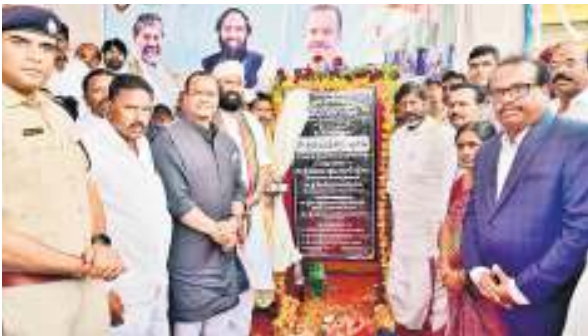
Deputy Chief Minister Mallu Bhatti Vikramarka, along with Minister N Uttam Kumar Reddy, laying foundation stone for R. 400 crore Innovera life sciences plant in Huzurnagar on Saturday

He visited Suryapeta of erstwhile Nalgonda district and stated that the Congress government would implement