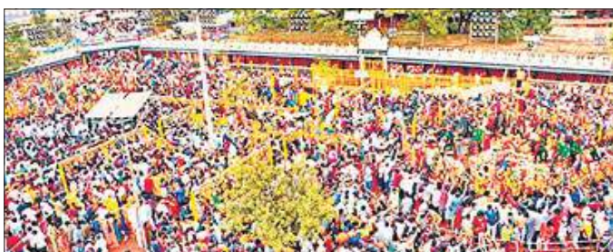
Lakhs of devotees attending the last day of tibal festival on Saturday in Medaram village

day of the three-day festival on Saturday, she pointed out that the government had earmarked Rs 100