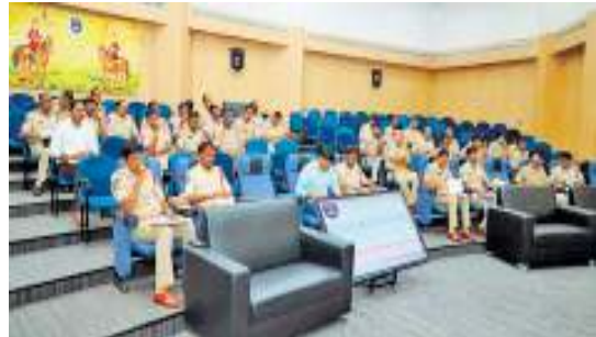
Cyberabad police personnel attending the training session in Hyderabad on Saturday