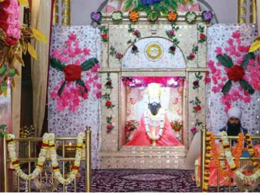
Sant Ravidas Janmasthan Mandir at Seer Govardhan in Varanasi