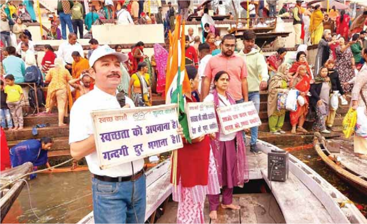
Namami Gange activists appealing to bathers to keep Ganga ghats clean, in Varanasi on Saturday