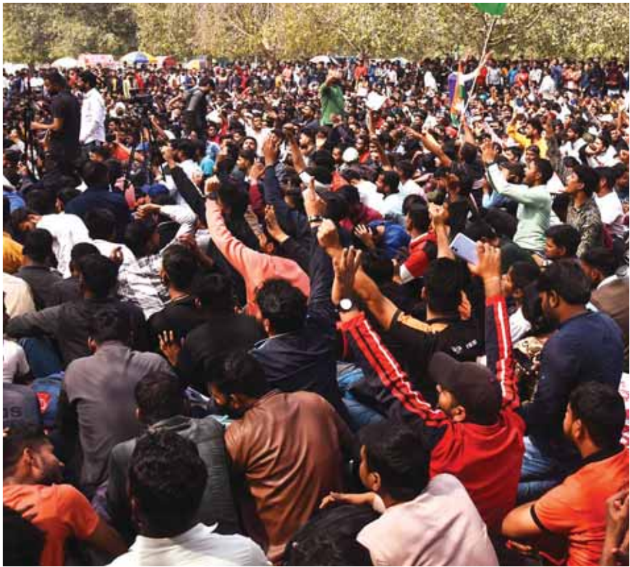
Youths staging protest demanding re-exam, in Lucknow