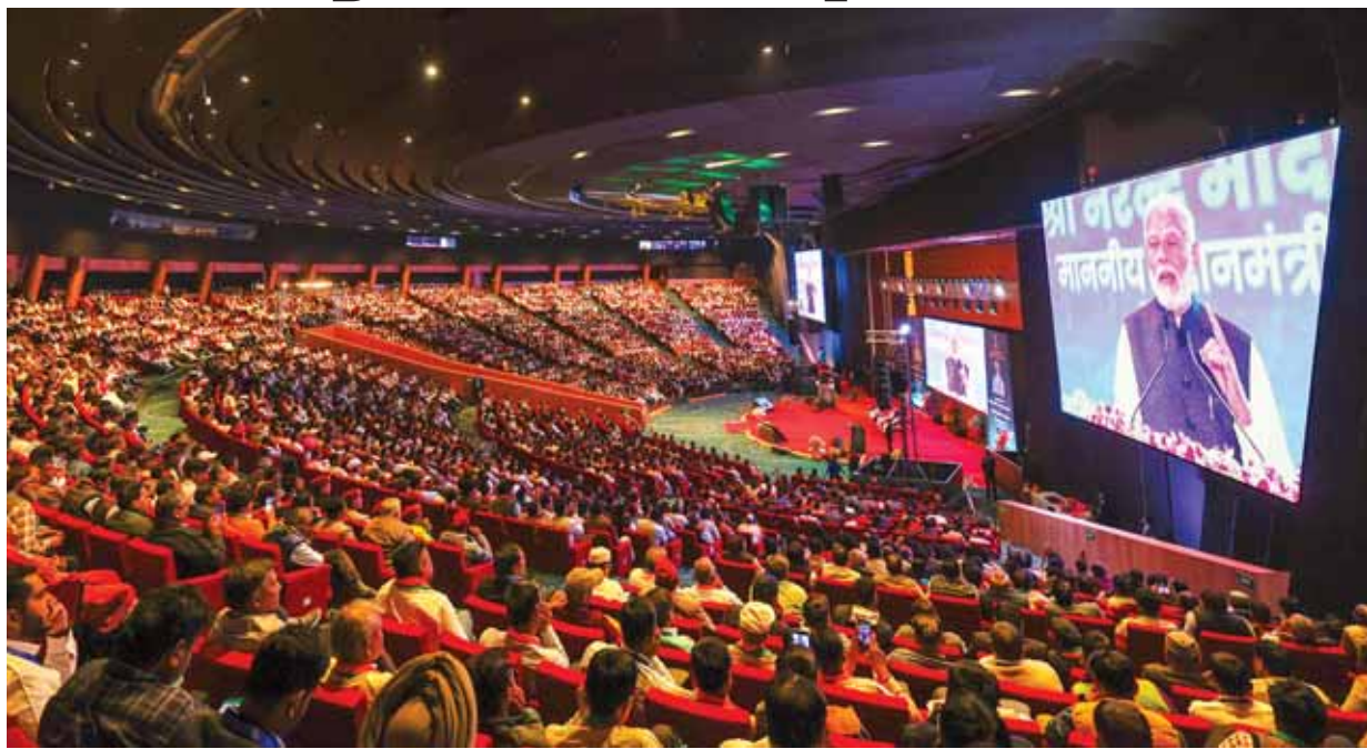
Prime Minister Narendra Modi speaks during the foundation stone laying ceremony of multiple key initiatives for cooperative sector in New Delhi on Saturday

Sources said Modi has instructed them and their ministries to brainstorm over the agenda for the period, which is also the likely duration before a new government takes office