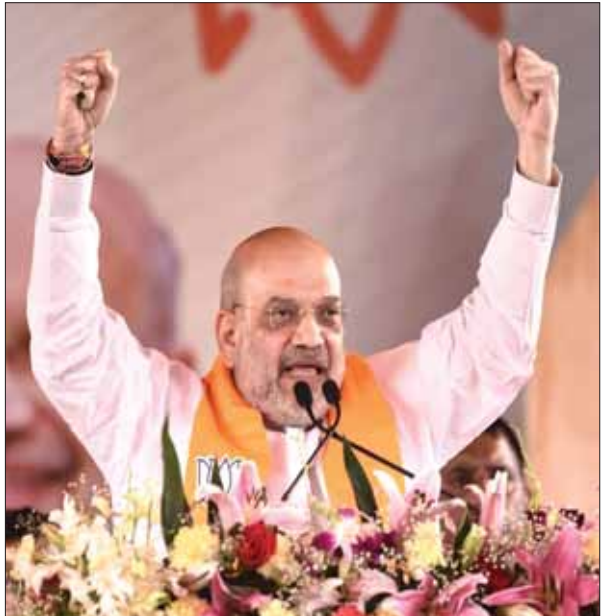
STAFF REPORTER ■ JANJGIR

Sounding poll bugle at a rally in Congress-stronghold Janjgir in the Chhattisgarh, Union Home Minister Amit Shah on Thursday said the upcoming parliamentary election would decide the future of the country. Addressing a public rally here, Shah said the name of Prime Minister Narendra Modi itself was a guarantee and he needs to be throne again in order to make India a developed nation and Vishva Guru. He urged the people of Chhattisgarh to elect Prime Minister Narendra Modi for a third term in office to make India third largest economy of the world.