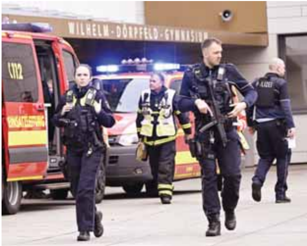
Police and ambulances at the scene of an attack, at the Wilhelm Dörpfeld school, in Wuppertal, Germany, Thursday.

Five people were injured in an incident Thursday at a school in the western German city of Wuppertal and a suspect was arrested, police said. The incident took place at the Wilhelm Dörpfeld high school in the city's Elberfeld district. Police said there was no shooting in the incident, German news agency dpa reported, but gave no further information. The Bild newspaper, which didn't name sources, said it was a knife attack. Police said they deployed large numbers of officers to the scene. They said the suspect was injured. Wuppertal is a city of some 350,000 people near Duesseldorf and Cologne.