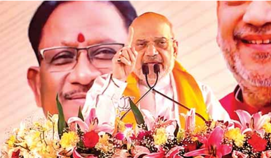
Union Home Minister and BJP leader Amit Shah addresses the Vijay Sankalp Shankhnaad rally in Janjgir on Thursday