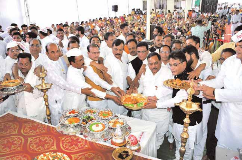
Members of the Digambar Jain Community participate in a religious programme to pay tributes to Acharya Vidyasagar Maharaj, at Digambar Jain Temple, Jawahar Chowk, in Bhopal on Sunday.