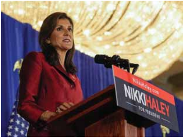
Republican presidential candidate former UN Ambassador Nikki Haley speaking at an election night event, Saturday in Charleston, S.C.

Saturday's result now places the onus on Haley, who continued in her concession speech to insist she has no plans to drop out of the race – a move that she said would leave the Republican voters in the upcoming primary states with "a Soviet-style