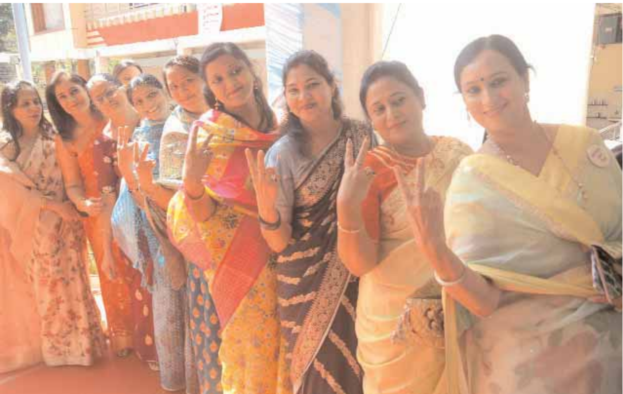
Women wait in a queue to cast their votes during the Khandelwal Community's election at Gujarati Samaj Bhawan in Bhopal on Sunday.

Tikamgarh, Niwari, Chhatarpur, Panna, Satna. On this day, hail may fall in Vidisha, Raisen, Betul, Sagar, Damoh, Jabalpur, Mandla, Dindori, Katni, Umaria, Shahdol, Anuppur. The effect of heat was seen in the state on Saturday. In many districts the day temperature crossed 29 degrees Celsius. Pachmarhi was the coldest. The temperature here was recorded at 24.8 degrees Celsius. Talking about big cities, the temperature was recorded at 28.3 degrees Celsius in Bhopal, 28.5 degrees in Indore, 26.9 degrees in Gwalior, 27.7 degrees in Jabalpur and 28.4 degrees Celsius in Ujjain. The temperature was below 30 degrees Celsius in Tikamgarh, Khajuraho, Dhar and Narmadapuram, and below 31 degrees Celsius in Narsinghpur, Ratlam. At the same time, in Khandwa the mercury crossed 32 degrees Celsius.