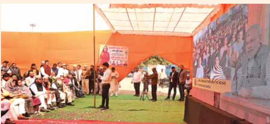
Delhi BJP organises a programme in Old Delhi to listen to PM's Mann Ki Baat