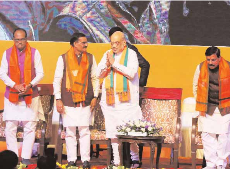
Union Home Minister Amit Shah with Chief Minister Mohan Yadav, former Chief Minister Shivraj Singh Chouhan and BJP State President VD Sharma during a meeting with the intellectuals, at Kushabhau Thackeray convention center in Bhopal on Sunday.

committees of all four Lok Sabha seats under the Gwalior-Chambal cluster — Morena, Bhind, Guna-Shivpuri, and Gwalior. Later in the evening, he addressed a gathering of intellectuals and influencers in the State capital. Asking the BJP workers to ensure party's victory in all 29 Lok Sabha seats in the State, Shah said, "In 2014, you gave us 27 out of 29 seats, in 2019, it was 28. Last time one seat got left but in 2024, put all 29 seats in Narendra Modi's lap and take us beyond 400 seats." In 2019, the BJP had won 28 parliamentary seats in the State with the Congress bagging the lone Chhindwara constituency. Modi has set a target of BJP alone winning more than 370 seats nationwide while the National Democratic Alliance (BJP) crossing the 400-mark.