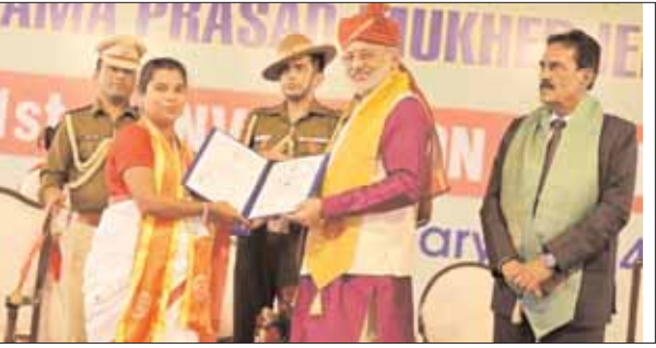
Governor CP Radhakrishnan presents a certificate to a student during the 1st Convocation of Dr. Shyama Prasad Mukherjee University, in Ranchi on Thursday.

"Remember to dream big. Success doesn't happen