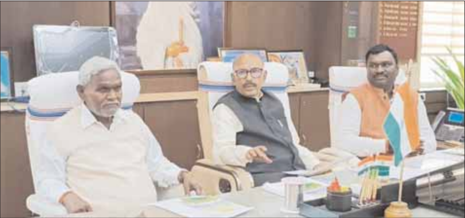
Assembly Speaker Rabindranath Mahto, Chief Minister Champai Soren and Opposition leader Amar Kumar Bauri during a meeting in view of Budget Session at Assembly in Ranchi on Thursday.

Court denies former CM Hemant Soren's plea to participate in Budget session