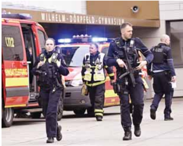
Police and ambulances at the scene of an attack, at the Wilhelm Dörpfeld school, in Wuppertal, Germany, Thursday.

Five people were injured in an incident Thursday at a school in the western German city of Wuppertal and a suspect was arrested, police said. The incident took place at the Wilhelm Dörpfeld high school in the city's Elberfeld district. Police said there was no shooting in the incident, German news agency dpa reported, but gave no further information. The Bild newspaper, which didn't name sources, said it was a knife attack. Police said they deployed large numbers of officers to the scene. They said the suspect was injured. Wuppertal is a city of some 350,000 people near Duesseldorf and Cologne.