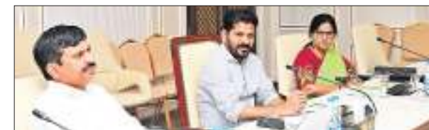
CM Revanth at Dharani Committee's review on Saturday

Attending a review meeting of the Dharani Committee on Saturday at the Secretariat, the Chief Minister blamed the BRS government for keeping highly confidential land data, Aadhaar and bank account details with the agency and