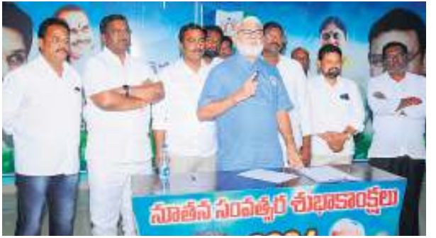
Irrigation Minister Ambati Rambabu addressing a press conference at Sattenapalli in Guntur district on Saturday.

"The JSP cadres raised slogans as Pawan Kalyan CM and hoped that the JSP would be given 70 Assembly seats. Pawan Kalyan backstabbed the Kapu