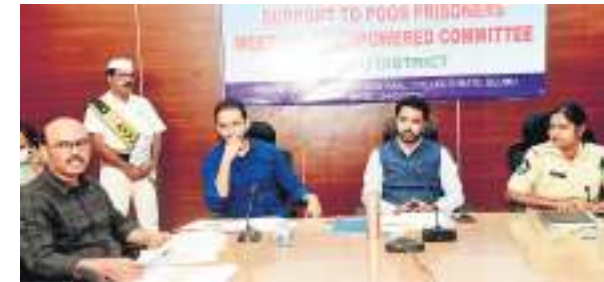
Eluru District Collector V Prasanna Venkatesh addressing the Poor Prisoners Empowered Committee meeting in Eluru on Saturday

The Collector said that the Union Home Minister issued orders to the state governments to take steps for the release of prisoners belonging to the socially backward com-