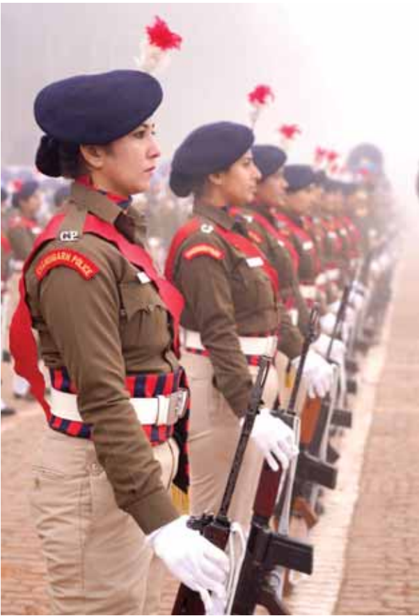
The Chandigarh Police women contingent at the full dress rehearsal of the Republic Day Parade at Parade Ground, Sector 17 on Wednesday.

AI-driven dashboards can provide law enforcement agencies with real-time analytics and insights into ongoing operations and events, improving situational awareness.