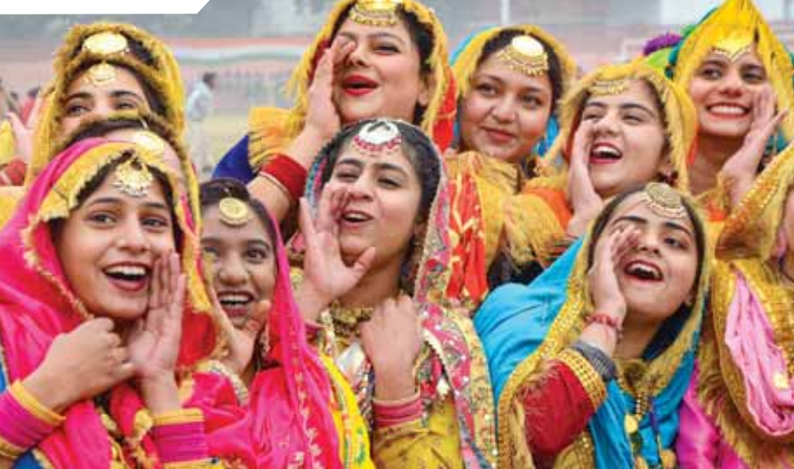
Students in traditional Punjabi attire during the full dress rehearsal for the Republic Day Parade 2024, in Amritsar