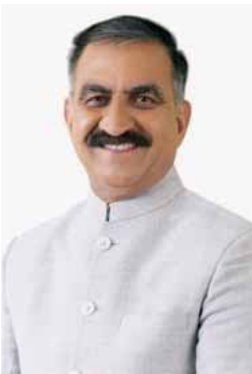
SUKHVINDER SINGH SUKHU CHIEF MINISTER HIMACHAL PRADESH

pioneering state with initiatives like the Mukhya Mantri Sukh Aashray Scheme, introducing a legal framework for orphans. In a remarkable gesture, 4,000 orphans have been granted the status of "Children of the State" under this scheme. This goes beyond festive grants, extending to bearing the expenses of education and providing pocket money exemplify the love and parental care for the orphans. In a resolute commitment to youth empowerment, the government initiates recruitment for over 21,000 positions. In the education sector, 5,291 posts are filled, including 1,070 TGT Arts, 776 TGT Non-Medical, 430 TGT Medical, 494 Shashtri and 2,521 JBT positions. Simultaneously, the HP Public Service Commission facilitates the filling of 530 lecturers, enhancing