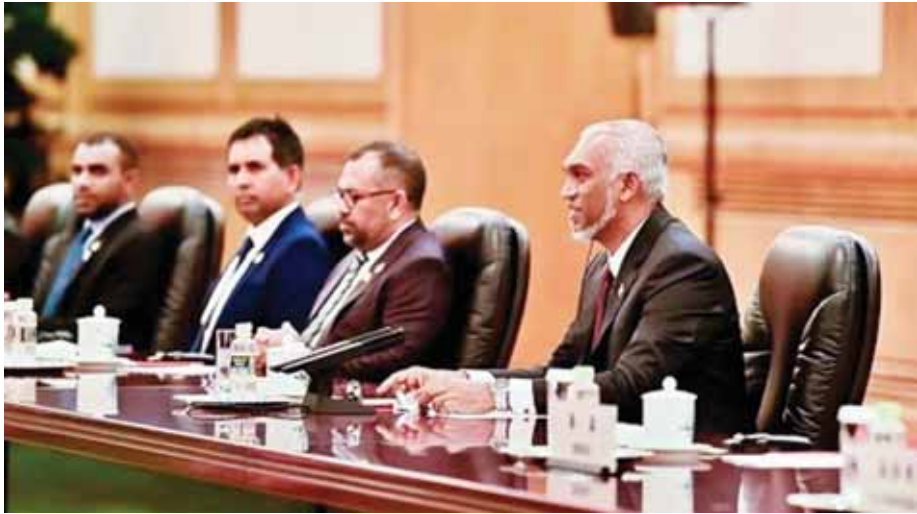
In picture, Maldives President Mohamed Muizzu during official talks in Beijing, earlier this month.

“The current administration appears to be making a