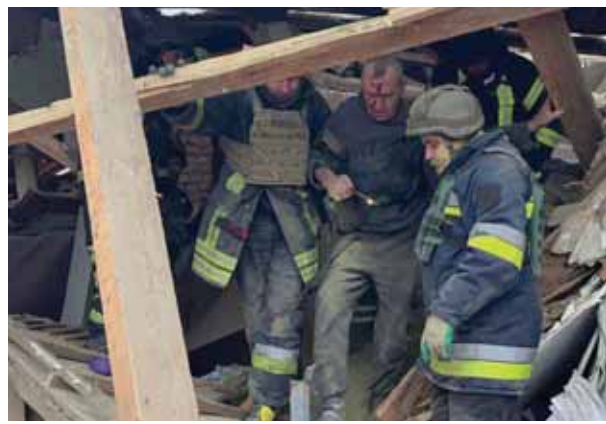
In this photo provided by the Ukrainian Emergency Service, emergency workers help a wounded man after a residential houses were badly damaged in a Russian missile attack, near Kryvyi Rih, Ukraine, on Monday

Authorities in the Khmelnytskyi region said two people died as at least six explosions were heard during the morning missile attack. Meanwhile, Russian troops