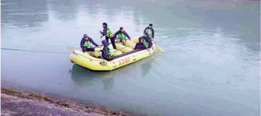
SDRF personnel search for accident victims in the canal near Rishikesh on Monday.

soon after getting the information and a team of divers from the State Disaster Response Force (SDRF) were also searching for the missing people till late in the evening. The vehicle belonged to the Forest department's jungle safari and it was being speculated that the accident occurred after one of the tyres burst. However, the police said that they are investigating the matter and it will be