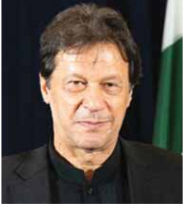
Pakistan elections, State Department spokesperson Matthew Miller said, "we want to see free and fair elections that are conducted in accordance with Pakistan's laws."

It also said that some observers expressed doubts over whether the article was indeed by Khan, but many noted that the tone and content of the article was consistent with his views. Earlier, reacting to questions on