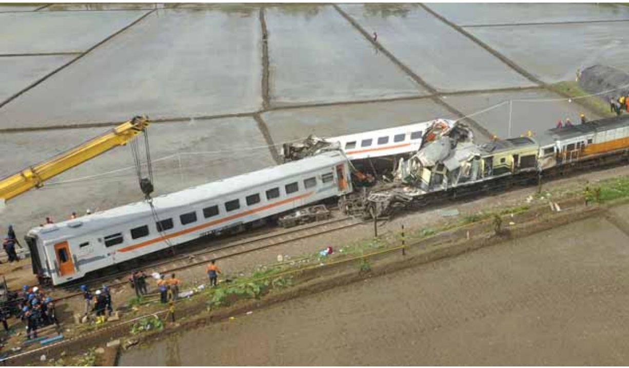
A crane tries to remove the wreckage after the collision between two trains in West Java, Indonesia, on Friday. The trains collided on Indonesia's main island of Java on Friday, causing several carriages to buckle and overturn, officials said.

Over the years, the Sri Lankan government has been aggressive against Tamilian groups following its war with LTTE which collapsed in 2009 after the Sri Lankan Army killed its supreme leader Velupillai Prabhakaran.