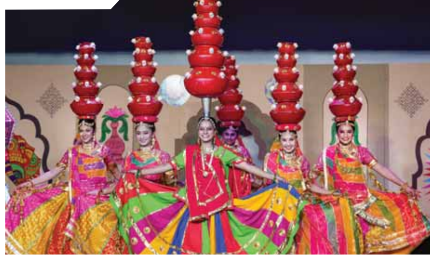
NCC cadets perform during the NCC Republic Day Camp 2024, in New Delhi