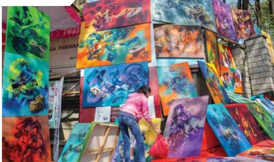
A visitor looks at paintings during the annual 'Chitra Santhe-Art Carnival', in Bengaluru