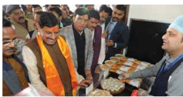
Union Health Minister Mansukh Mandaviya and Madhya Pradesh Chief Minister Mohan Yadav at India's first healthy and hygienic food street, Prasadam, in Ujjain in Madhya Pradesh on Sunday

inauguration took place in the presence of Union Health and Family Welfare Minister, Dr. Mansukh Mandaviya, along with several officials from the FSSAI and the State Government. Spread over an area of 939 square meters with a total of 19 shops, vendors at the 'Prasadam' food street will serve Ujjain cuisine to guests, including tourists, while keeping in mind the parameters of 'Eat Right', promoting healthy food. The use of plastic, along with samosas, kachoris, and junk food, will be completely banned on this street. Among the food stalls open here, tourists will be able to enjoy