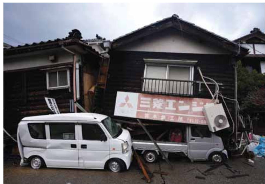
Crashed vehicles by collapsed houses are seen in Wajima in the Noto peninsula facing the Sea of Japan, northwest of Tokyo, Sunday. Monday's tremor decimated houses, twisted and scarred roads and scattered boats like toys in the waters, and prompted tsunami warnings