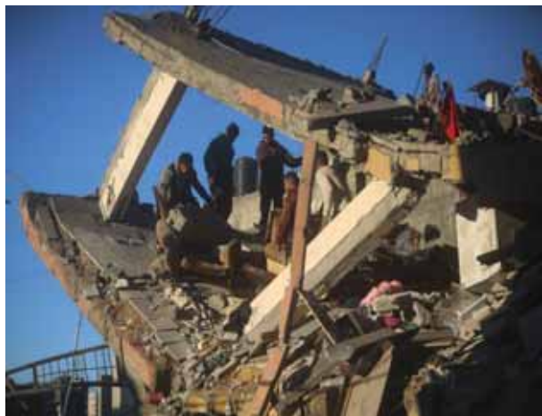
Palestinians inspect the damage of a destroyed house following Israeli airstrikes on Khan Younis, Southern Gaza Strip on Sunday.

The announcement came ahead of a visit to Israel by US Secretary of State Antony Blinken. Biden administration officials, including Blinken, have repeatedly urged Israel to wind