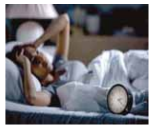
three consecutive days on two occasions approximately one year apart to calculate their averages. Participants slept for an average of six hours. Participants also reported bedtimes and wake times in a sleep diary and completed a sleep quality survey with scores ranging from zero to 21, with higher scores indicating poorer sleep quality. A total of 239 people, or 46%, reported poor sleep with a score greater than five. Participants also completed a series of memory and thinking tests. Researchers also looked at sleep fragmentation, which measures repetitive short interruptions of sleep. They looked at both the percentage of time spent moving and the percentage of time spent not moving for one minute or less during sleep. After adding these two percentages together, researchers found that participants had an average sleep fragmentation of 19%.