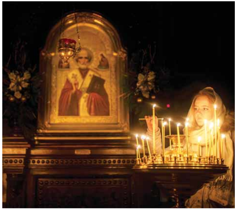
A Lithuanian Orthodox worshipper lights candles before the liturgy on Orthodox Christmas Eve in the Orthodox Church of the Holy Spirit in Vilnius, Lithuania, Saturday.