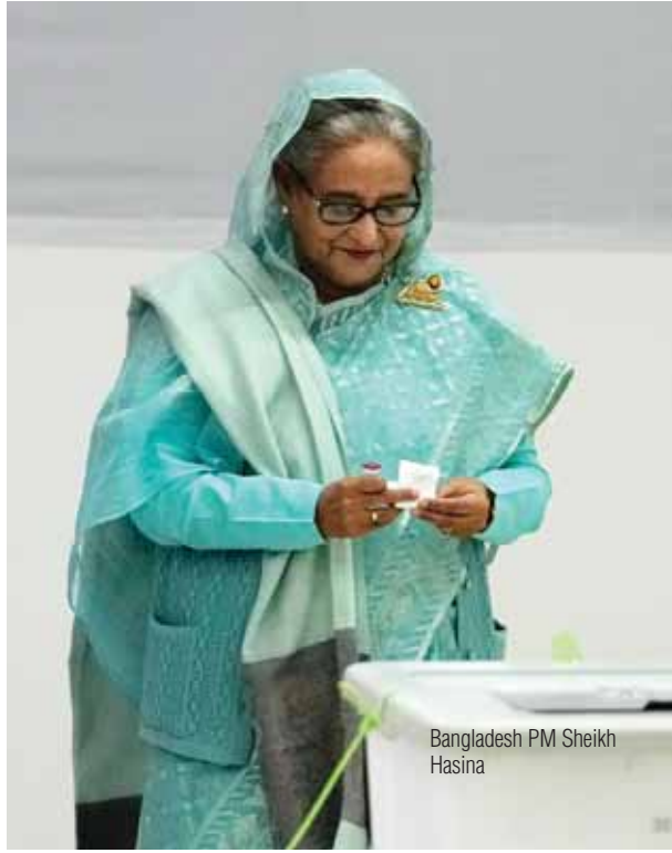
interference, she said her Awami League party does not bother who says what about the election.

About foreign countries' interference, she said her Awami League party does not bother who says what about the election.