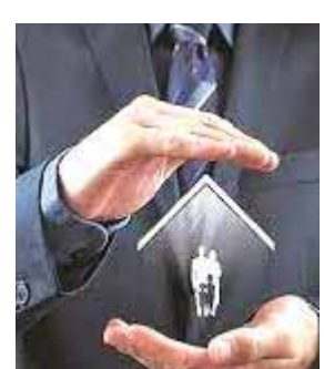
increased by 25.62 per cent to 1.98 lakh crore in 2022-23, of which public sector insurers accounted for 56.27 per cent. During the year, out of the total surrender benefits, it said, benefits for ULIP (unit-linked insurance plans) accounted for 62.51 per cent for private insurers and 1.56 per cent for state-

Payout by life insurance companies declined by about Rs 6,000 crore during 2022-23 because of lesser number of death claims as compared to previous financial year which was impacted by COVID-19. The life insurance industry paid a total benefit of Rs 4.96 lakh crore in 2022-23 as compared to Rs 5.02 lakh crore in FY22, according to the latest annual report released by sector regulator IRDAI. During FY22, the year hit by COVID-19 wave, the insurance companies paid Rs 60,821.86 crore as death claims. This came down by Rs 19,000 crore to Rs 41,457 crore in 2022-23. The benefits paid on account of surrenders/withdrawals