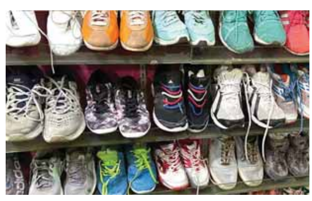
"Today many brands make in China or Vietnam shoes in India. Few others do part manufacturing in India and import the premium shoes. India should support firms to make shoes locally by removing policy and logistics impediments,"

ized by two main changes - a significant increase in the demand for non-leather footwear (like sports shoes, running shoes, casual wear, and sneakers) in India, rising from 25 per cent to 75 per cent of the market share by 2030; and a shift in leather shoe production from small-scale, cottage industries to large corporates," it said. Suggesting eight actions for the sector, the report said shoe-making technology is primitive compared to electronics or semiconductor manufacturing and India should support local production by domestic firms and MNCs and "stop imports" of finished shoes.