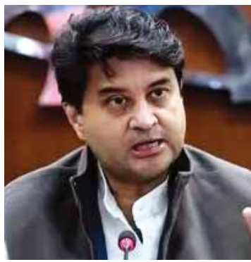
as opposed to 36 hours rest period. In December, a senior DGCA official said the regulator has received many comments on the changes to the CAR.

Engaged in Scheduled Air Transport Operations'. In a recent interview to PTI, Scindia said that for pilot fatigue issues, the CARs have been relooked at. "We are putting in place a new set of rules making sure that pilot fatigue not only conforms to international standards but also due to early sunrise in our part of the world, we look at the night hours on an expanded (basis) as opposed to generally 0100 hours to 0500 hours, we are looking at 1100 to 1200 hours, to 0500 hours. "We are looking to expanding that period, which is going to be the night shift period, thereby putting a much more facilitative regime for pilots," he said. The minister also said that the regulator is looking to ensure 48 hours rest