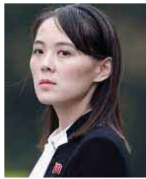
ing powder simulating the sound of its coastal artillery on the seashore, to test the South Korean military's detection capabilities. "The result was

North Korea's military later confirmed it used coastal artillery systems to carry out live-firing exercises. It said the drills were part of its military training schedules and the direction of its shells fired didn't expose any threat to South Korea. On Friday, North Korea launched about 200 shells. South Korea also claimed that the North fired more than 60 rounds on Saturday, but its rival has denied that. Kim Yo Jong said that North Korea on Saturday only detonated blast-