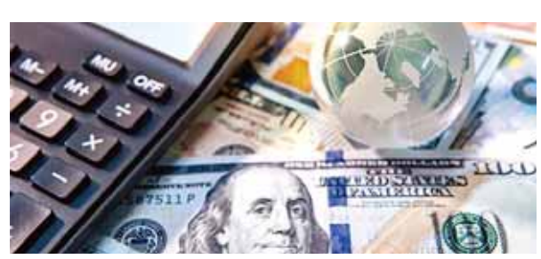
Geojit Financial Services, said. Further, FPI inflows into debt will also see acceleration in 2024, he added. According to the data, foreign investors made a net investment of Rs 4,773 crore in Indian equities this month (till January 5). This came following a massive investment of Rs 66,134 crore in December and Rs 9,000 crore in November.

Foreign Portfolio Investors (FPIs) continued their buying spree and poured close to Rs 4,800 crore in the Indian equity markets in the first week of January driven by confidence in the country's robust economic fundamentals. Additionally, they injected Rs 4,000 crore in the debt market during the period under review, data with the depositories showed. With expectations of a prolonged decline in US interest rates in 2024, there is an anticipation that FPIs will likely escalate their purchase, particularly in the initial months of the New Year leading up to the general elections, V K Vijayakumar, Chief Investment Strategist at