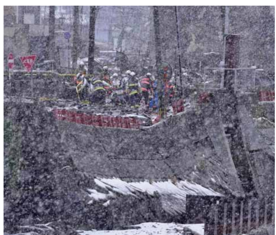
Firefighters search for missing people in the snow in Wajima, Ishikawa prefecture, Sunday. Rescue teams worked through snow to deliver supplies to isolated hamlets Monday, a week after a powerful earthquake hit western Japan.