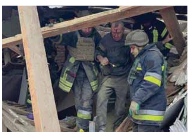
In this photo provided by the Ukrainian Emergency Service, emergency workers help a wounded man after a residential houses were badly damaged in a Russian missile attack, near Kryvyi Rih, Ukraine, on Monday

Authorities in the Khmelnytskyi region said two people died as at least six explosions were heard during the morning missile attack. Meanwhile, Russian troops