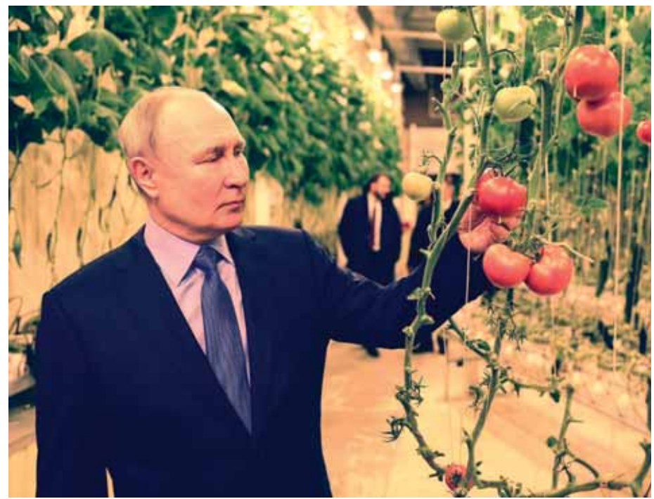
Russian President Vladimir Putin inspects growing tomatoes during his visit to the year-round greenhouse farm "Makatrov Peasant Farm" in Anadyr, Chukotka region, in the Russian Far East, Wednesday.

Chief Cabinet Secretary Yoshimasa Hayashi emphasised that the plant was safe. Eighteen of 116 radiation monitoring posts installed in Ishikawa prefecture, where Shika is located, and in neighbouring Toyama briefly failed after the quake. All but two have since been repaired and none showed any abnormality, he said. Shika is a town on the western coast of the Noto peninsula, where the quake did the most damage, leaving roads gapping, toppling and collapsing buildings and triggering landslides.