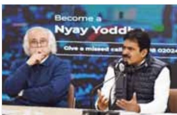
Congress leaders Jairam Ramesh and KC Venugopal during a press conference in Delhi on Wednesday

After a dispute arose between the Congress and the Manipur Government over the initial denial of permission for a venue where the grand old party's "Bharat Jodo Nyay Yatra" was scheduled to begin on January 14, the N Biren Singh Government on Wednesday approved the venue for the flagging off but with a condition. In response to protests by the Congress over the last two days, the Manipur Government granted approval for the flagging off of the proposed January 14 Bharat Jodo Nyay Yatra, albeit "with a limited number of participants". This approval came eight days after the Congress approached the government to request the flagging off of the yatra from Hapta Kangleibung ground. Only the flagging off of the Yatra with a limited number of participants is hereby allowed on January 14 to prevent any untoward incidents and disturbances in law and order. The number and names