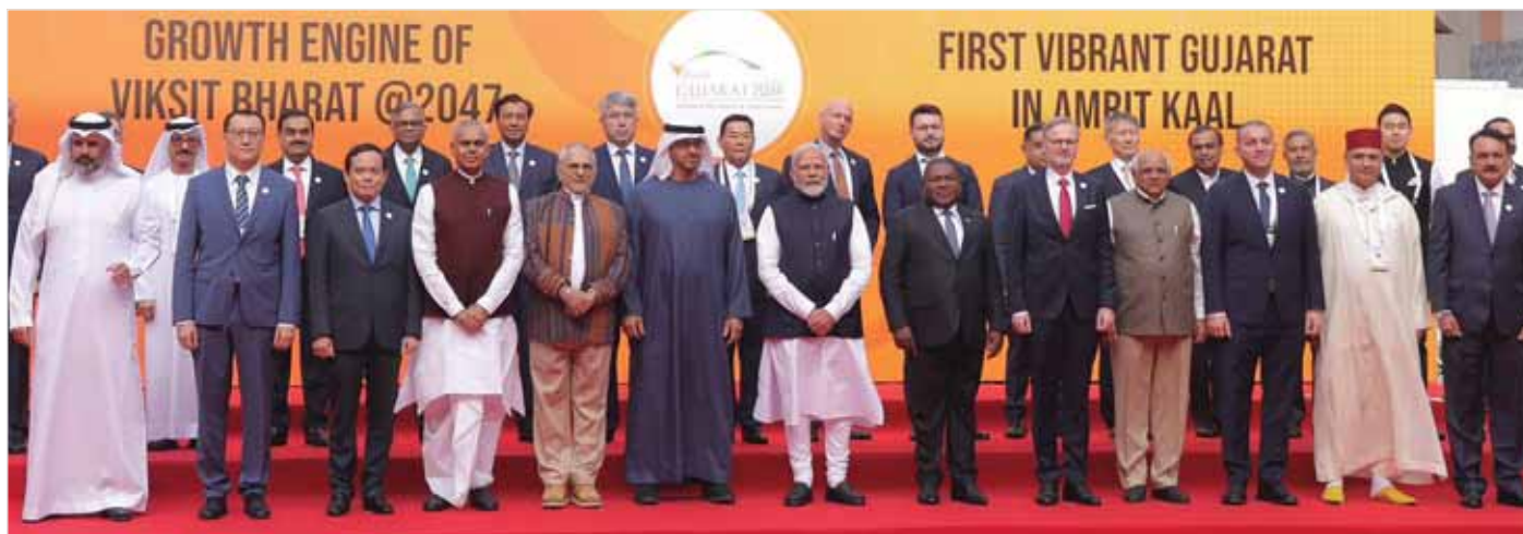
Prime Minister Narendra Modi, UAE President Mohamed bin Zayed Al Nahyan, Prime Minister of the Czech Republic Petr Fiala, Mozambique President Filipe Jacinto Nyusi, President of Timor-Leste Jose Ramos Horta, Gujarat Governor Acharya Devvrat and Chief Minister Bhupendra Patel, and others at the Vibrant Gujarat Global Summit 2024 in Gandhinagar on Wednesday

Prime Minister Narendra Modi on Wednesday revealed that his government has set a goal of making India a developed country in the next 25 years. He added that all major rating agencies are of the opinion that India will be among the three largest economies in the world in the next few years, and these upcoming 25 years represent India's Amrit Kaal. Addressing the inauguration of the 10th edition of the Vibrant Gujarat Global Summit, which saw the participation of state heads and CEOs of top private companies, PM Modi said in the rapidly changing world order, India is moving ahead as the "vishwa mitra" (friend of the world). India has emerged as a new ray of hope amid many uncertainties being faced globally, and the world