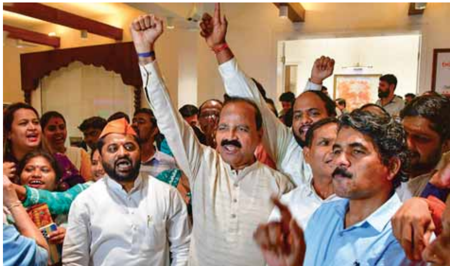
Shiv Sena (Shinde faction) members celebrate after the verdict in the MLA disqualification case came in their favour, in Mumbai on Wednesday

In a major setback to the Uddhav Thackeray-led Shiv Sena, Maharashtra Legislative Assembly Speaker Rahul Narwekar on Wednesday recognised the Sena faction led by Eknath Shinde as the "real Shiv Sena" and rejected a plea by the Sena (UBT) seeking disqualification of 16 Sena MLAs, including Shinde himself, thus retaining the stability of the "Maha-Yuti" Government. More than 18 months after the Shinde-led Shiv Sena teamed up with the BJP and toppled the Uddhav Thackeray-led Maha Vikas Aghadi (MVA) Government, the Speaker ruled that the decision taken by Uddhav to remove Shinde, after the June 2022 rebellion within the erstwhile parent Sena, lacked the mandate of the political party and that "the 'paksha pramukh' (party president) does not have the power to remove any leader from the party." "The 1999 party constitution submitted to the Election Commission by the Shiv Sena was the valid one for deciding the issues related to leadership. The Shiv Sena UBT group's contention that the amended constitution of 2018 should be relied on was