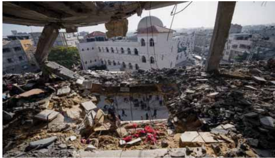
Palestinians look at a damaged residential building after an Israeli strike in Rafah, southern Gaza Strip on Wednesday.

ing with no end in sight, fuelling a humanitarian catastrophe in the tiny coastal enclave. The fighting has also stoked escalating violence between Israel and Lebanon's Hezbollah militants that has raised fears of a wider conflict. On his fourth visit to the