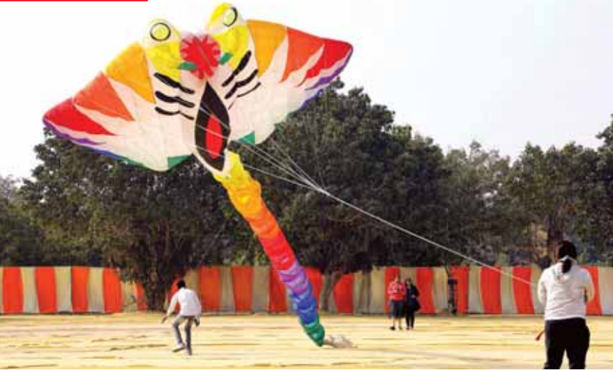
A woman flies a kite during the International Kite Festival, in Rajkot