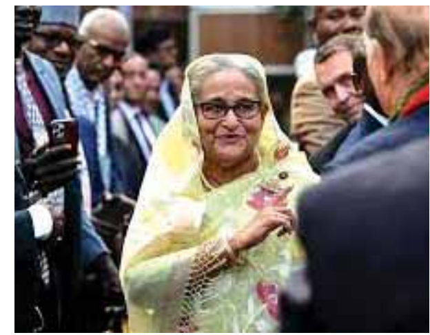
Bangladesh's Prime Minister Sheikh Hasina accepts greetings from the assembled media and election observers during a press conference, a day after she won the 12th parliamentary elections, in Dhaka on January 8, 2024.