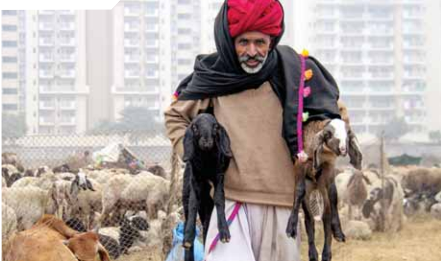
A nomadic shepherd from Rajasthan with his herd during a cold winter day, in Gurugram