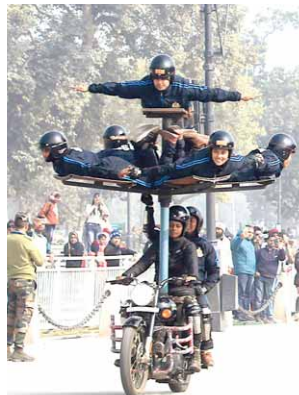
Indian Army's women team displays their skills during the rehearsals ahead of Republic Day

project will provide drinking water supply to the Palghar and Thane districts of Maharashtra, benefiting approximately 14 lakh people. During the programme, the Prime Minister will dedicate approximately ₹2000 crore to railway projects for the nation. These projects include the dedication of 'Phase 2 of Uran-Kharkopar railway line,' which will enhance connectivity to Navi Mumbai by extending suburban services from Nerul/Belapur to Kharkopar to Uran. The Prime Minister will also flag off the inaugural run of the EMU train from Uran railway station to Kharkopar. Other rail projects to be dedicated to the nation include a new suburban station, 'Digha Gaon,' on the Thane-Vashi/Panvel Trans-harbour line, and the new 6th Line between Khar Road & Goregaon railway station.