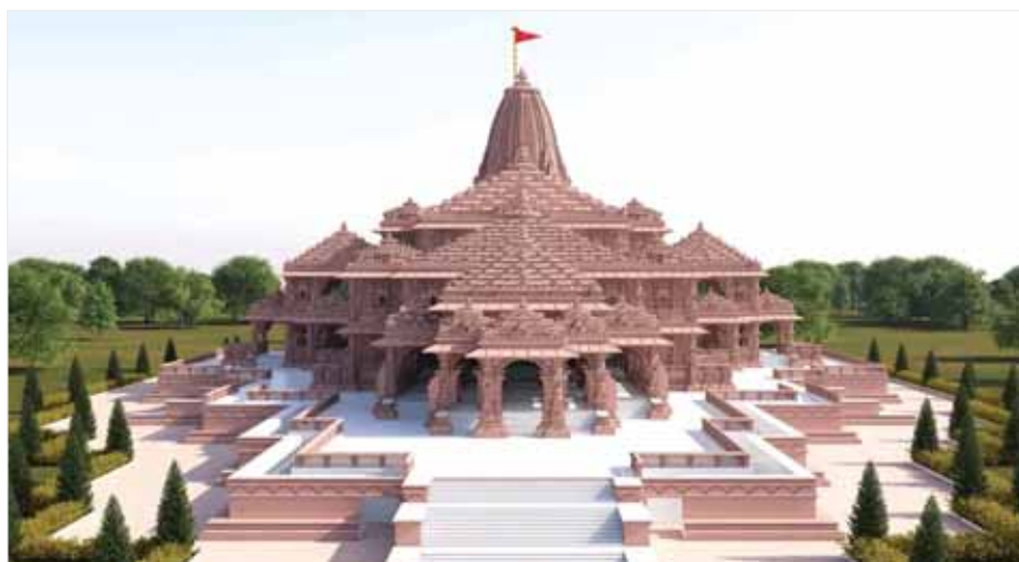
Ayodhya Ram Mandir model

A war of words has broken out between the ruling party at the Centre, the BJP, and the Opposition parties over the "decline" of the invitation to the Ram Temple consecration at Ayodhya by top leaders of the Congress and other Opposition members. While the Congress-led Opposition termed the Ayodhya ceremony a political one, the BJP called the Congress "anti-Ram" after the party declared that Mallikarjun Kharge, Sonia Gandhi, and Adhir Ranjan Chowdhury would not be attending the ceremony in Ayodhya. The Left parties and the TMC have also declined to attend the ceremony, which will be attended by Prime Minister Narendra Modi, top political functionaries, celebrities, industrialists, and a host of eminent personalities. In a letter shared on its official handle on Wednesday, the Congress termed the mega consecration ceremony as an "RSS/BJP event." Congress alleged that the Rashtriya Swayamsevak Sangh (RSS) and the BJP have turned the temple in Ayodhya into a "political project." The BJP lashed out at the Congress, stating that the party's stand and its allies have regularly "insulted" Hindus and Sanatana Dharma. BJP MP Sudhanshu