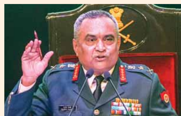
Chief of Army Staff General Manoj Pande addresses a press conference ahead of Army Day in New Delhi on Thursday

As tension continues to prevail at the border with China for the past three years, Army Chief General Manoj Pande on Thursday said the situation along the Line of Actual Control (LAC) in eastern Ladakh is "stable" but "sensitive". He asserted that Indian troops are maintaining a "high state" of preparedness to deal with any challenge. He also mentioned a decrease in overall incidents of violence in Jammu and Kashmir. However, he expressed concern about an increase in such incidents in the Rajouri-Poonch sector. Pande pointed out that terror infrastructure continues to thrive across the border, making an apparent reference to Pakistan's support for various terrorist groups. Addressing these points during the annual press conference ahead of Army Day on January 15, the Army Chief said India and China are engaged in talks at both the military and diplomatic levels to resolve the remaining differences. Trouble began in May 2020 when Chinese troops attempted to alter the status quo at the Line of Actual