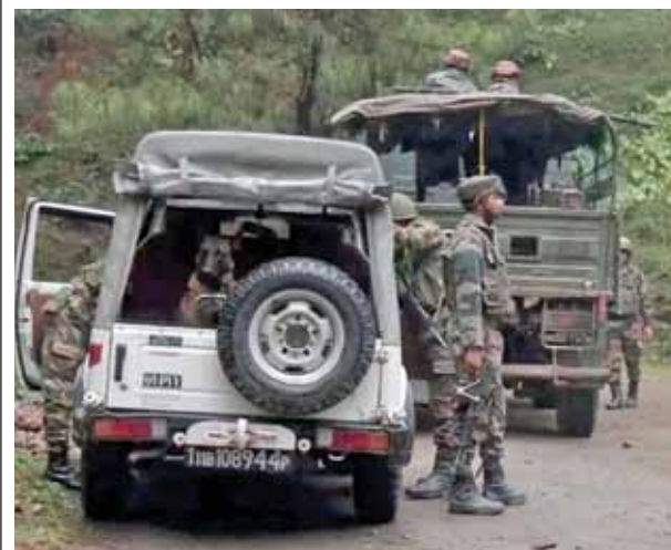
PIONEER NEWS SERVICE ■ JAMMU

A day after Army Chief General Manoj Pande said the situation in the Rajouri-Poonch region is a matter of "concern", suspected terrorists late Friday evening once again targeted a convoy of army vehicles near Krishna Ghati area of the Poonch district from a nearby forested area. No one was injured in the surprise attack which took place around 6.00 p.m. The security forces have launched a massive search operation in the area to track down the footprints of the terrorists hiding in the thickly forested area.