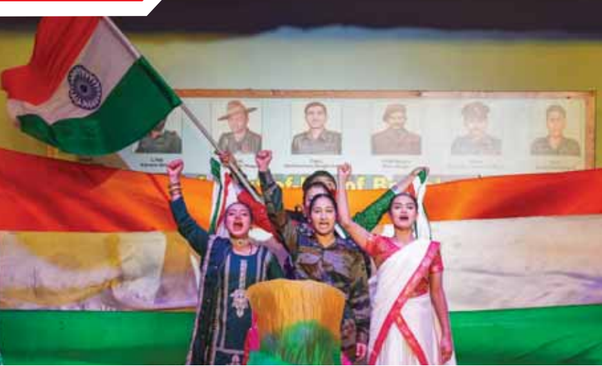
Cadets perform during the NCC Republic Day Parade 2024 camp, in New Delhi