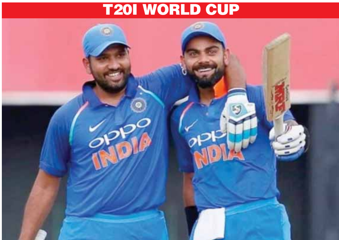
T20I WORLD CUP

...And that's how it should be. But I'm sure that you will have a very formidable side."