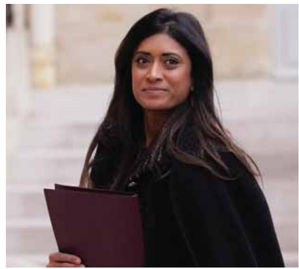
Newly appointed French Government's Spokesperson Prisca Thevenot arrives to attend the weekly cabinet meeting after a cabinet reshuffle, at the Elysee Palace in Paris, on Friday.

Macron's office has said the change of government seeks to reflect a rejuvenated image, with fresh faces joining high-profile ministers who retain their jobs. The interior, finance,