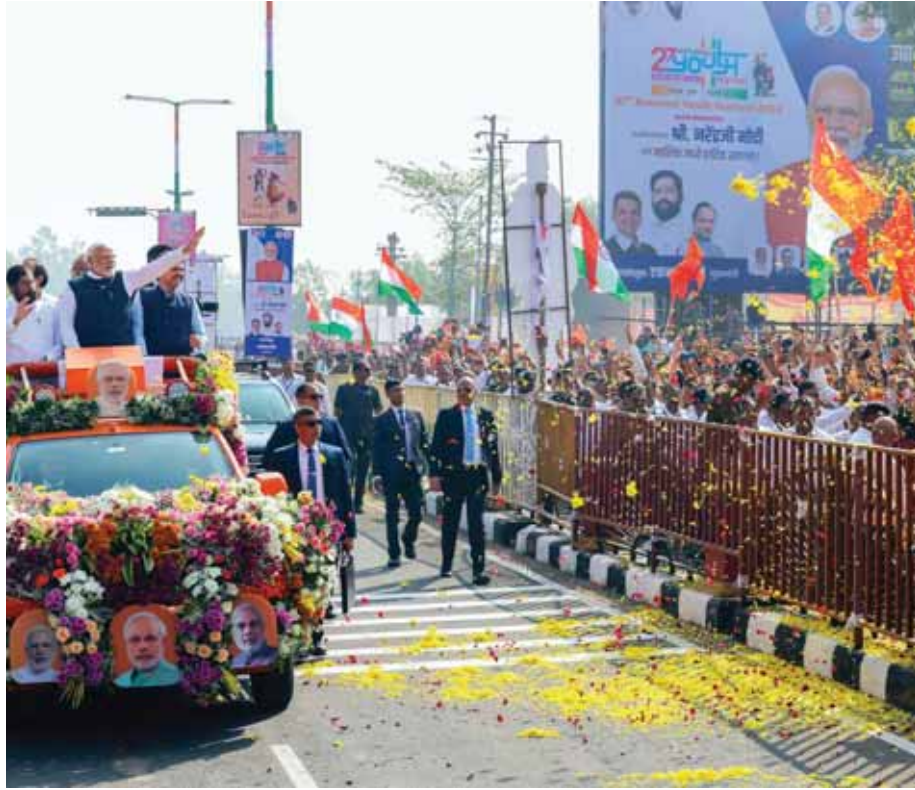
Prime Minister Narendra Modi waves to the crowd during a roadshow in Nashik on Friday. (Right) The PM walks on the newly built Atal Setu, the longest sea bridge in India.

"In the scriptures, the Pran Pratishtha of a deity's idol is a detailed and comprehensive process. Detailed rules, which must be followed several days before the ceremony, have been provided for this purpose. The Prime Minister consistently adheres to rules such as Brahmamuhurta Jagran, Sadhana, and a Satvik diet in his daily routine. However, for the next 11 days, the Prime Minister will follow an ascetic routine, including