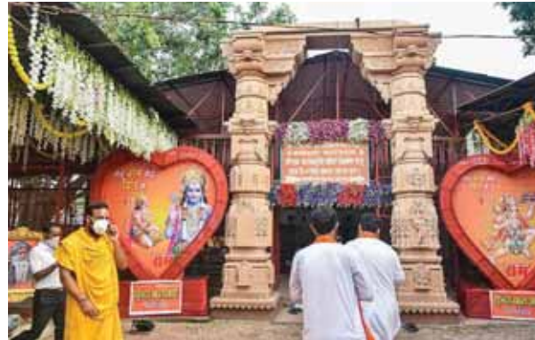
Lord Ram, Lord Hanuman and the upcoming grand temple has risen manifold. Saffron flags bearing images of Lord Ram and the upcoming Ram