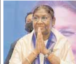
■ NEW DELHI

President Droupadi Murmu Friday greeted people on the eve of harvest festivals and wished that these occasions foster the spirit of love and harmony besides making the country more peaceful and prosperous. According to a statement issued by the Rashtrapati Bhavan, the President greeted her fellow citizens on the eve of Lohri, Makar Sankranti, Magh Bihu and Pongal, which fall on January 13, 14 and 15 respectively. "These festivals are living forms of the country's cultural heritage as well as the symbols of unity in diversity, she said. "On these occasions, we bathe in holy rivers and undertake charity and other cultural activities. These festivals, celebrated in different manifestations across the country, forge social amity, unity and brotherhood," the president said. "These agricultural festivals also promote environment conservation, she said. "We also recognise the hard work of our farmers by celebrating these festivals. May these festivals foster the spirit of love and harmony and contribute in making our country more peaceful and prosperous," Murmu added.