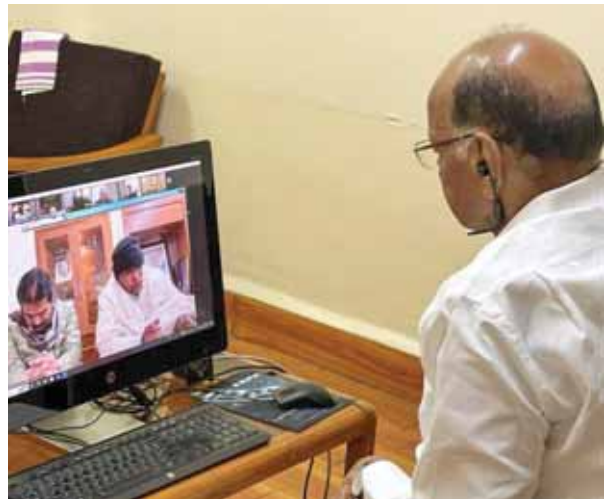
NCP chief Sharad Pawar attends a meeting of INDIA bloc leaders via video conferencing, on Saturday

After expressing his earnest desires for the last six months to assume the role of Convener of the Opposition grouping INDIA bloc, JD(U) president and Bihar Chief Minister Nitish Kumar declined the offer made during the virtual meeting of Opposition leaders. In that meeting, Congress president Mallikarjun Kharge was named the Chairperson of the large alliance preparing to take on the juggernaut of Narendra Modi-led BJP in the Lok Sabha polls. Major stakeholders, including Mamata Banerjee-led TMC, Uddhav Thackeray-led Shiv Sena, and Samajwadi Party's Akhilesh Yadav, skipped the meeting for the second time in a fortnight. Despite pressures from other allies, there has been no consensus headway in the seat sharing for the general elections. AAP, which also attended the virtual meet, had a separate meeting between Kharge and Delhi CM Arvind Kejriwal in the presence of Congress leaders, including Rahul Gandhi, and other AAP leaders at the residence of the Congress chief. Sources said that the intense deliberation, which also saw participation by NCP supremo Sharad Pawar, reached a consensus to choose Kharge as the Chairperson of the INDIA bloc. Nitish was