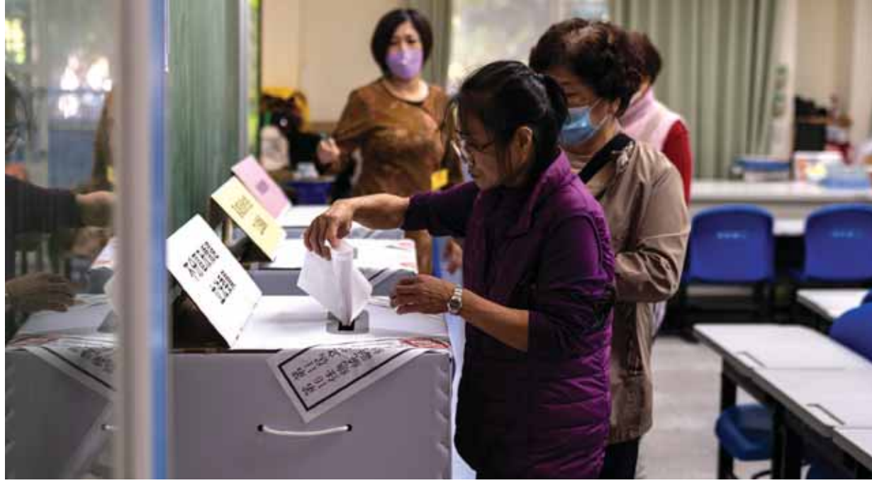
People cast a vote at a polling station during the elections in New Taipei City on Saturday. Taiwanese cast their votes Saturday for a new president in an election that could chart the trajectory of its relations with China over the next four years.

The United States, which is bound by its laws to provide Taiwan with the weapons needed to defend itself, pledged support for whichever government emerges, reinforced by the Biden administration's plans to send an unofficial delegation made up of former