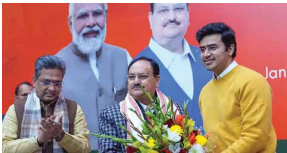
CBI or ED cases, he claimed, alleging that they commit corruption but abuse probe agencies. In a reference to former Congress presidents Sonia Gandhi and Rahul Gandhi, he said both are on bail. Nadda asserted that Modi

ing Modi". When he enquired about the meeting of INDIA parties, he was told they were meeting virtually, Nadda said. "A virtual alliance will do virtual meetings only. It will do so for the sake of formalities," he said. Opposition leaders, including the likes of M Karunanidhi and Parkash Singh Badal who are no more, were always concerned about their children's political future, he said, attacking Mamata Banerjee, Sharad Pawar, Farooq Abdullah and M K Stalin among others. Isn't Akhilesh Yadav concerned about Dimple Yadav, his wife and a Lok Sabha MP, he asked. All of them are facing some