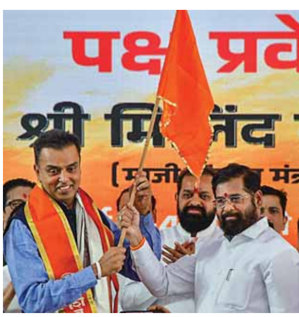
Maharashtra Chief Minister Eknath Shinde welcomes former Congress leader Milind Deora who joined Shiv Sena in Mumbai on Sunday

Later, he went to Siddhivinayak Temple in Prabhadevi to offer prayers. In the afternoon, Deora joined the Shiv Sena in the presence of Eknath Shinde at Varsha, the official residence of the Chief Minister. Earlier in the day, when Deora stepped out of his residence "Ramalayam" in south Mumbai, he told reporters that he was "going to walk on the path of development." Deora also launched a veiled attack on the Congress leadership after joining the Shiv Sena, saying that his parent party is not the same as it used to be when Manmohan Singh launched economic reforms. He emphasised that the Congress is now criticising industrialists and businessmen, labeling them as anti-nationals. Deora expressed his belief that PM Modi and Union Home Minister Amit Shah have a vision for developing the country. He also praised Shinde as the "most accessible" chief minister. Deora, recently appointed as the joint treasurer of the All India Congress Committee, had previously expressed disapproval of the Uddhav Thackeray-led Shiv Sena (UBT) staking a claim to the Mumbai South Lok Sabha constituency, which he had represented in the past. In the undivided Shiv Sena, Arvind Sawant, now with the