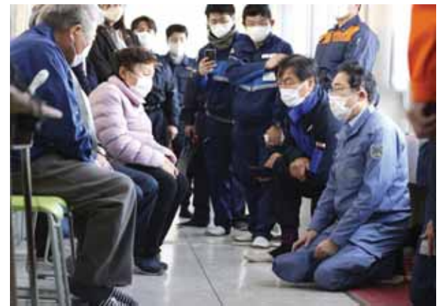
Japan's Prime Minister Fumio Kishida, right, talks with evacuees at an evacuation center in Suzu, Ishikawa prefecture, Japan Sunday.

The magnitude 7.6 earthquake left 220 dead and 26 others still missing while injuring hundreds. More than 20,000 people, many of whom had their homes damaged or destroyed, are taking refuge at about 400 school gymnasiums, community centers and other makeshift facilities, according to the Fire and Disaster Management Agency report. Road damage has hampered rescue efforts, and though relief supplies have reached most regions affected by the quake, hundreds of people in isolated areas are getting little support. Additionally, in the hard-hit towns of Noto, Wajima and Suzu, elderly residents account for half their