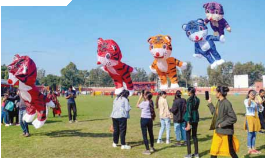
Young women participate in the kite festival organised to celebrate Makar Sankranti festival, in Bhopal