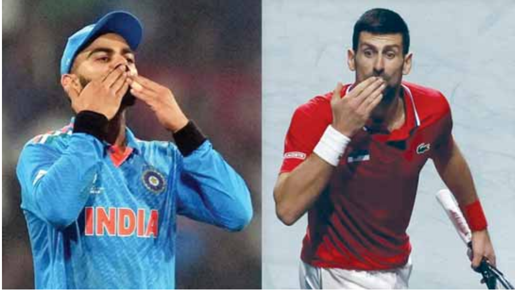
journey, his passion for fitness, something that I dearly follow myself and believe in a lot. So there's a lot to connect on. "Hopefully if he comes to India soon, I happen to be in a country where he is playing. I will definitely catch up with him and just chill out and maybe have a cup of coffee."

Kohli's message for Djokovic came hours after the 36-year-old tennis told the Sony Sports Network that they both are "text buddies". "Virat Kohli and I have been texting a bit for a few years. We never got a chance to meet in person, but it was really an honour and a privilege to hear him speak nicely about me. "I obviously admire all of his career and achievements. I started to play cricket, but I'm not very good at it. But I have a task to perfect my cricket skills before I come to India, and don't embarrass myself, when I'm there," Djokovic said. Djokovic's only visit to India came in 2014 when he visited New Delhi for the now defunct International Tennis Premier League. The 36-year-old hopes to revisit the country with which he feels strongly connected to. "I've felt that for many years (connection). I visited India only once around 10 or 11 years ago for a two-day exhibition event in New Delhi. It was a brief stay, and I hope to return soon to explore the country's rich history, culture, and spirituality," he added.