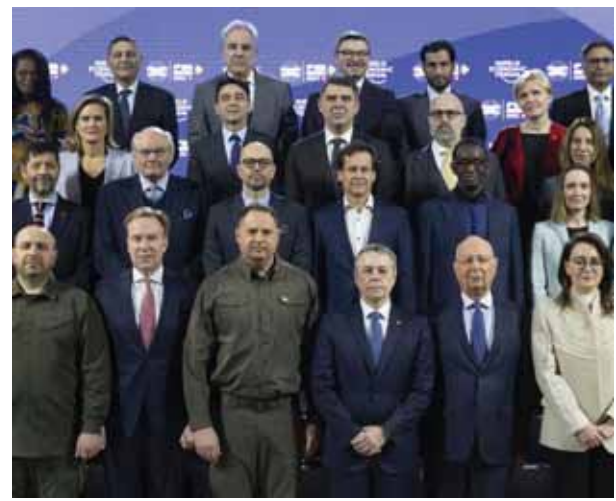
Andriy Yermak, front sixth left, Head of the Ukrainian President's Office, Swiss Federal Councillor Ignazio Cassis, front seventh right, and other participants pose for a photo during the 4th meeting of the National Security Advisors (NSA) on the peace formula for Ukraine, in Davos, Switzerland, Sunday.

In addition to army personnel, there is a huge number of police men and women, support staff running into thousands and then nearly 3,000 world leaders are attend-