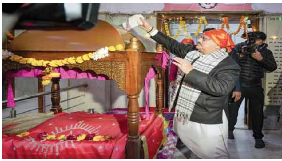
BJP National president JP Nadra during a cleanliness drive at Guru Ravidas Mandir ahead of the Pran Pratishtha of Ram Lala, in New Delhi, on Sunday

Saint Guru Ravidas. Nadra said the BJP has decided to carry out a cleanliness campaign at temples across the country from Makar Sankranti to January 22 (consecration ceremony of the Ram Temple in Ayodhya). "Following the directions of Prime Minister Narendra Modi, the BJP has decided that from Makar Sankranti to January 22, we (party leaders and workers) will conduct a cleanliness campaign at several temples and holy premises in the country," he told reporters as he kicked off the campaign from Delhi's Ravidas Temple. In a post on X in Hindi, he said that he felt blessed to come to the place. "... Under this campaign, all of us are doing 'Shramdaan' (voluntary work) in various temples from