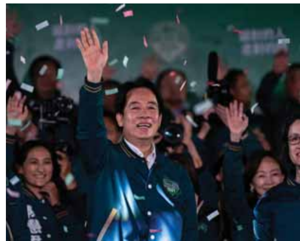
Taiwanese Vice President Lai Ching-te, also known as William Lai, left, celebrates his victory with running mate Bi-Khim Hsiao in Taipei, Taiwan on Saturday.

Taiwan said as much, taking issue with China over its often-repeated line that Taiwan is a domestic Chinese issue. China regards the island of 23 million people as a renegade province and says it should not have its own president or official relations with foreign governments. The Chinese Foreign Ministry said in a statement on the election that "the Taiwan question is China's internal affair" and "the basic fact that ... Taiwan is part of China will