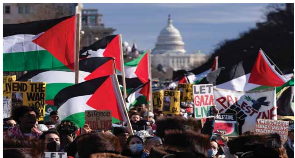
With the U.S. Capitol in the background, demonstrators rally during the March on Washington for Gaza at Freedom Plaza in Washington on Saturday.

In Tel Aviv, many of the protesters were planning to stay out all night. The crowd listened to a recorded message from French President Emmanuel Macron, and heard from the US ambassador to Israel, Jacob Lew.