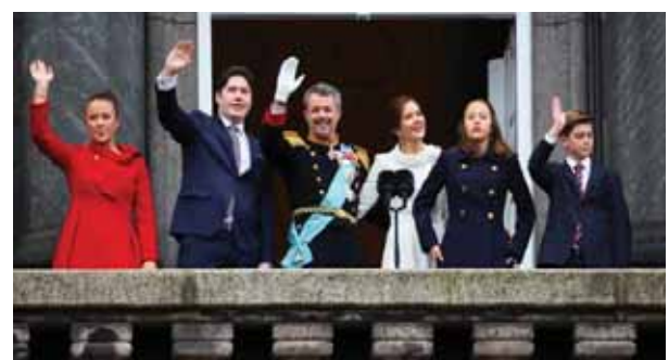
Denmark's newly proclaimed King Frederik and Queen Mary, with Prince Christian, Princess Isabella, Prince Vincent and Princess Josephine, on the balcony of Christiansborg Palace.

Wearing a magenta outfit, Margrethe signed her abdication during a meeting with the Danish Cabinet at the