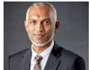
of the India-Maldives high-level core group in Male. The two sides decided to set up the core group on the contentious issue following a

PTI ■ NEW DELHI Maldivian President Mohamed Muizzu on Sunday asked India to withdraw its military personnel from his country by March 15 even as the two sides deliberated on finding a "mutually workable solution" to enable continued operation of the Indian military platforms in the island nation. The issue was extensively discussed at the first meeting