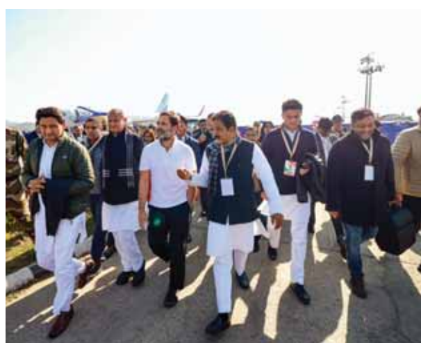
Congress leaders Rahul Gandhi, Ashok Gehlot, Sachin Pilot, KC Venugopal, Deepender Singh Hooda and others upon their arrival in Imphal ahead of the Bharat Jodo Nyay Yatra on Sunday

PIONEER NEWS SERVICE ■ IMPHAL/NEW DELHI Former Congress president Rahul Gandhi embarked on the Bharat Jodo Nyay Yatra from Manipur on Sunday, promising to bring peace and harmony to the ethnically violence-hit State. Addressing a public meeting in Thoubal, south of Manipur's capital Imphal, Rahul criticised Prime Minister Narendra Modi, suggesting that, for the BJP and the RSS, Manipur might not be considered a part of India. "Lakhs of people faced losses, but the Prime Minister has not come here to wipe your tears, hold your hand, or embrace you. Maybe for Narendra Modi, the BJP, and the RSS, Manipur is not a part of India. Your pain is not their pain," Rahul said.