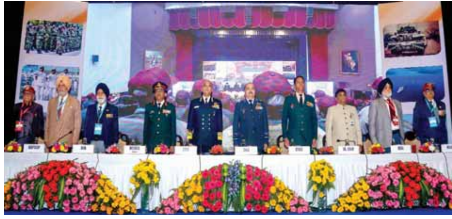
Chief of Air Staff Air Chief Marshal VR Chaudhari speaks during the 8th Armed Forces Veterans Day event at Manekshaw Centre in New Delhi on Sunday

PIONEER NEWS SERVICE ■ NEW DELHI IAF Chief Air Chief Marshal VR Chaudhari on Sunday said the Indian armed forces have transformed with changing times to meet the challenges of the "entire spectrum of warfare". In his address at an event hosted here to mark the 8th Armed Forces Veterans Day, Chaudhari also asserted that resilient spirit, leadership, and vision of its veterans have laid the foundation of today's armed forces.