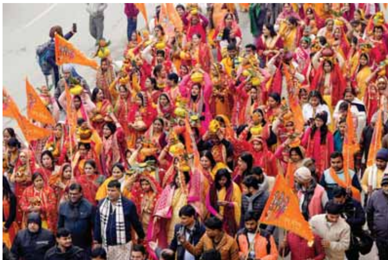
Devotees participate in a Kalash Yatra ahead of the Shri Ram Janmabhoomi Temple consecration ceremony in Ayodhya

PNS ■ AYODHYA Ramnagari Ayodhya is currently immersed in a tidal wave of devotion as thousands of devotees from across the country through the sacred city to seek darshan of Ram. The fervour has intensified as the consecration of Ram Lalla's life in the Ram temple approaches, attracting an increasing number of pilgrims each day. The number of devotees has seen a remarkable surge, doubling in recent times, with a corresponding increase in offerings to Ram Lalla. The month of December witnessed a generous donation of Rs 2 crore to the deity, a figure that has been sustained into the month of January. Enthusiasm among devotees is palpable as they arrive in Ayodhya daily to witness Ram Lalla before the consecration ceremony. The influx of visitors has