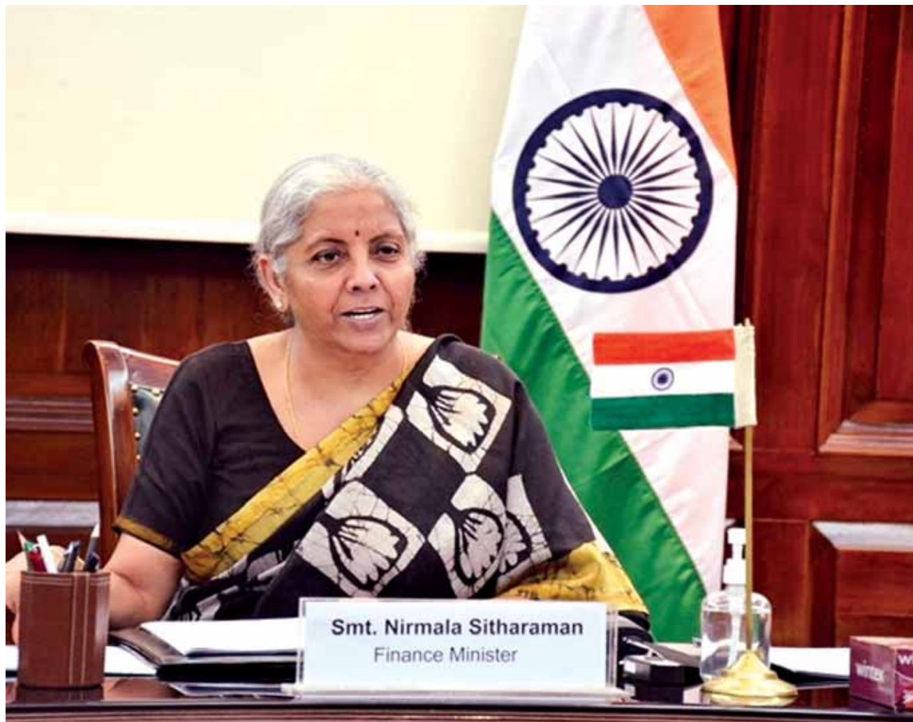
Smt. Nirmala Sitharaman Finance Minister

The robustness of the tax regime in a country can be tested by looking at its ability to engineer and sustain an accelerated growth in its GDP (gross domestic product); help the government in garnering tax revenue commensurate to growth in GDP and be 'progressive' in as much as it collects more taxes from those who can afford to pay more while imposing less burden on those who can't. Look at the growth in real GDP which is GDP at constant prices. After a decline of 5.8 percent during 2020-21 caused by Corona - pandemic, growth in real GDP rebounded to 9.1 percent during 2021-22. It was 7.2 per cent during 2022-23. The pace was maintained at a high of 7.7 per cent during the first half of the current FY. For the whole year, growth is estimated to be over 7 per cent. For tax collection purposes, we need to look at nominal GDP (NGDP) which is GDP at current prices. During 2021-22, growth in NGDP was 18.4 per cent which was higher than the budget estimate (BE) of 14.4 per cent. During 2022-23 also, growth at 16.1 per cent was significantly higher than BE of 10.3 per cent. During the first half of the current FY, growth decelerated to 8.6 per cent which was lower than the BE 10.8 per cent. This was due to negative inflation as measured by the wholesale price index (WPI) during the first half. During the second half, growth is expected to be higher as the WPI will move to positive territory. For the whole year, it is expected to be 9 - 9.5 per cent.