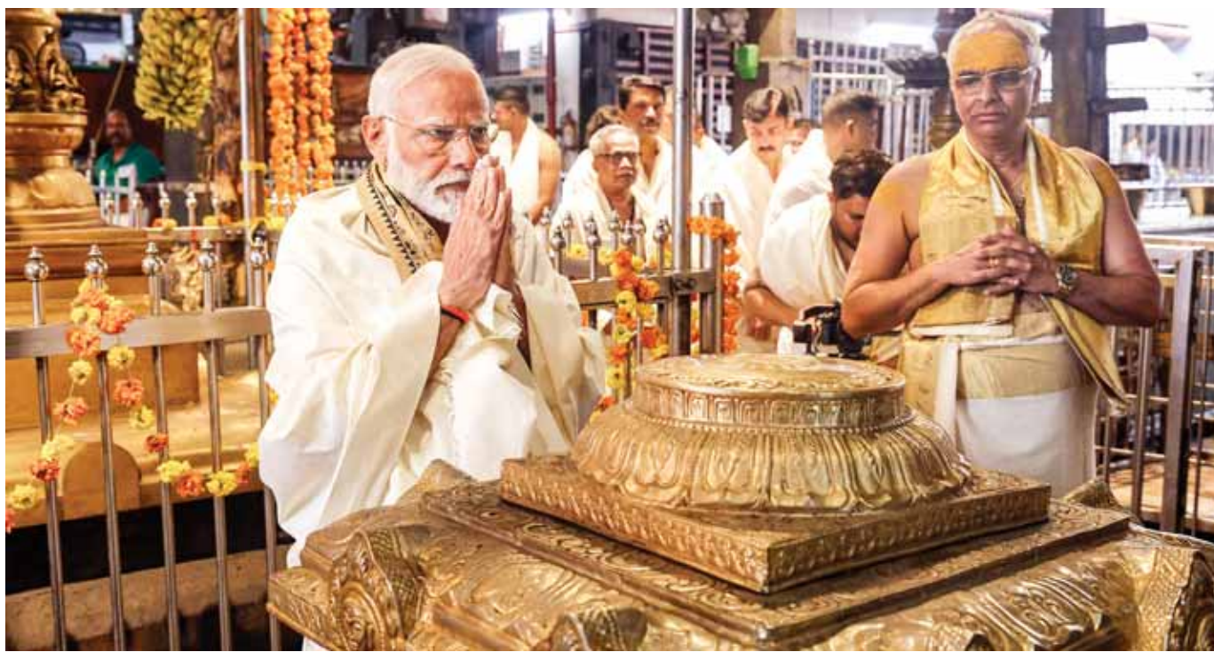
Prime Minister Narendra Modi offers prayers during his visit at Guruvayur Temple in Guruvayur in Thrissur district on Wednesday