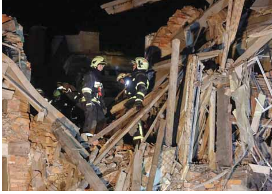
emergency workers work in an apartment house damaged in Russian rocket attack in Kharkiv, Ukraine, in the early hours of Wednesday.

Kharkiv came from the Russian border region of Belgorod, Ukrainian officials said. That area has seen a recent increase of cross-border attacks by Ukraine.