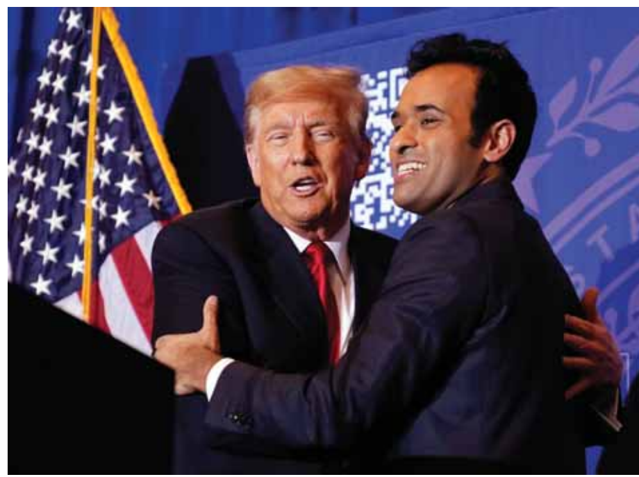
Republican presidential candidate former President Donald Trump embraces former candidate Vivek Ramaswamy at a campaign event in Atkinson, N.H. on Tuesday.

With no majority in parliament, Macron suggested many of the changes could be implemented without passing new laws. The French president vowed to make France "stronger" to face global crises, announcing plans to deliver more long-range cruise missiles as well as bombs to Ukraine. He also proposed a joint initiative with Qatar to mediate a deal between Israel and Hamas to allow the delivery of medications to around 45 of the more than 100 Israeli hostages held captive in Gaza.