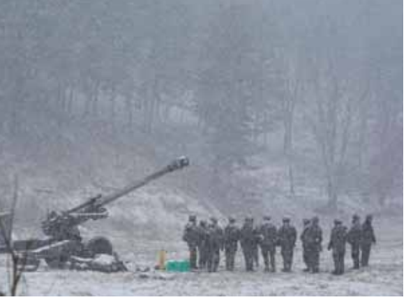
South Korean army soldiers gather during a military exercise in Paju, South Korea, near the border with North Korea, Wednesday.

He didn't specify whether the training reflected concerns about North Korea's alleged arms