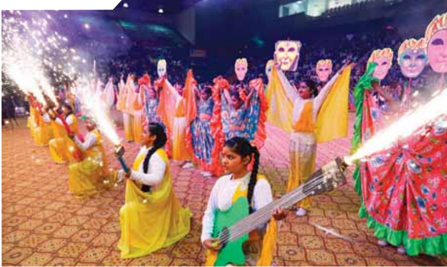
Students perform during Educational Excellence Awards at Thyagaraj Stadium, in New Delhi