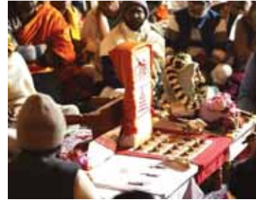
Puja being performed at Garb Grih

Lord Ganesha was invoked to bless the proceedings, which included the ceremonial bathing of the idol with water from holy rivers and the application of various consecrated medicines. The journey of the silver statue of Ram Lalla to the sanctum sanctorum began late on Wednesday night, symbolically touring the Ram temple complex. Originally intended for a Janmabhoomi complex tour, the decision to use a smaller silver statue