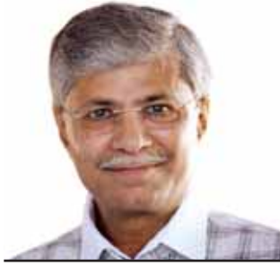
VAIDYA RAJESH KOTECHA

A pivotal shift is underway as the Ministry of Ayush spearheads a global medical revolution, bridging the gap between ancient wisdom and modern healthcare