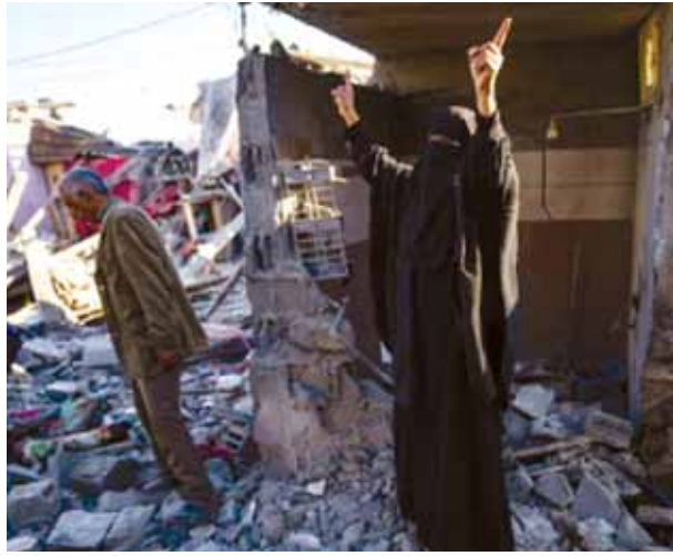
Palestinians look at the destruction after an Israeli strike in Rafah, southern Gaza Strip, Thursday.

A communications blackout in the territory was in its seventh day on Friday, the longest such blackout since the war began. The lack of communications hampers the coordination of aid deliveries