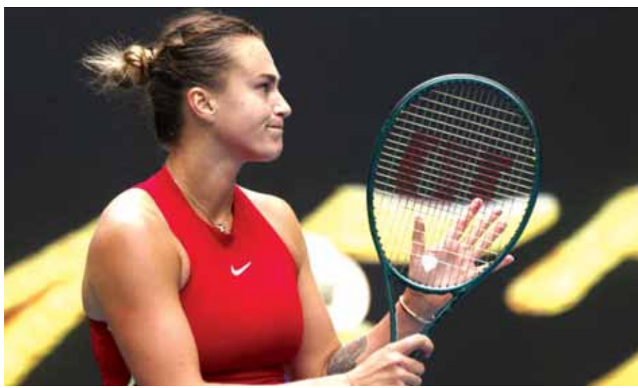
is still there. People are still dying every day. I still don't understand what all these (Russian and Belarusian) players are doing here." When Russia invaded Ukraine in February 2022, the plight of Ukrainian players was uppermost in everyone's minds, with Wimbledon banning Russian and Belarusian players from competing that year and numerous fund-raising events held around the tennis world. However, the ATP and WTA Tours decided to allow individuals from those countries to compete, albeit not under their country's flag. Wimbledon lifted its ban in 2023, under pressure of sanction against Britain's grass-court events. Since the war began, Ukrainian players have made a point of not shaking the hands of Russians and Belarusians, sometimes to the confusion of crowds, who have blamed the loser. At Wimbledon last summer, Belarusian player Victoria Azarenka was booed after losing to Elina Svitolina. Wimbledon rejected a suggestion by Svitolina that crowds should be informed about the situation before and during the

Two years on from the start of the invasion, the war continues but with Ukraine slipping down the news agenda, players are worried that their cause is being forgotten. "The worst thing is that you get too used to it," Dayana Yastremska told reporters in Melbourne this week. "And, this is very bad. Because most of the people are forgetting what is going on there. "We know about everything because we receive the news, we are reading, we are into it (but) the words are not hitting that hard like it was when the war just started. I think it's important to remember about it and do everything." Kostyuk said journalists need to keep the news alive. "They want the drama, they wanted news, they wanted all this heating between players and everything," she said. "The war