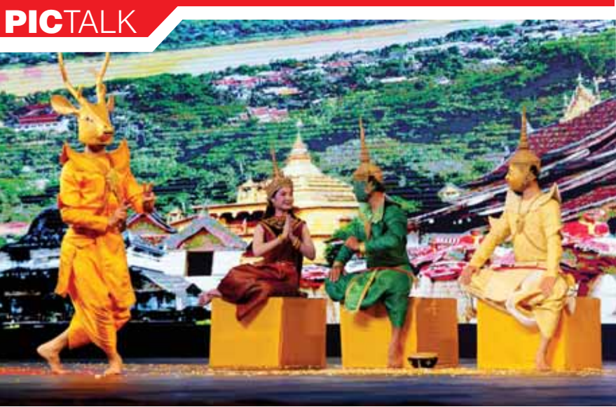
Artists from Laos perform during the 7th edition of India International Ramayan Mela, in New Delhi

instability on the Iran-Pakistan border may have repercussions for India. The potential for an influx of refugees, increased terrorism or the spillover of violence could create challenges for India's border security and counter-terrorism efforts. Economically, any disruption in the Iran-Pakistan relationship may affect regional trade dynamics. India has been striving to enhance economic ties with Iran, particularly in the energy sector, and maintain stability its relations with Pakistan for overall regional economic prosperity. Besides, the involvement of world powers could make things worse. The US is already at loggerheads with Iran and would like to bleed it by funding Pakistan's offensive in terms of dollars and drones, not to speak of heavy artillery which Pakistan could use against India as well. India may find itself in a precarious situation and might have to settle for a nuanced approach, siding with Iran but not annoying the US. This, however, presents its own set of challenges, given the complex nature of the situation and the strong anti-Iran stand of the US. New Delhi must carefully navigate its foreign policy to safeguard its strategic interests while promoting stability and cooperation in the region.