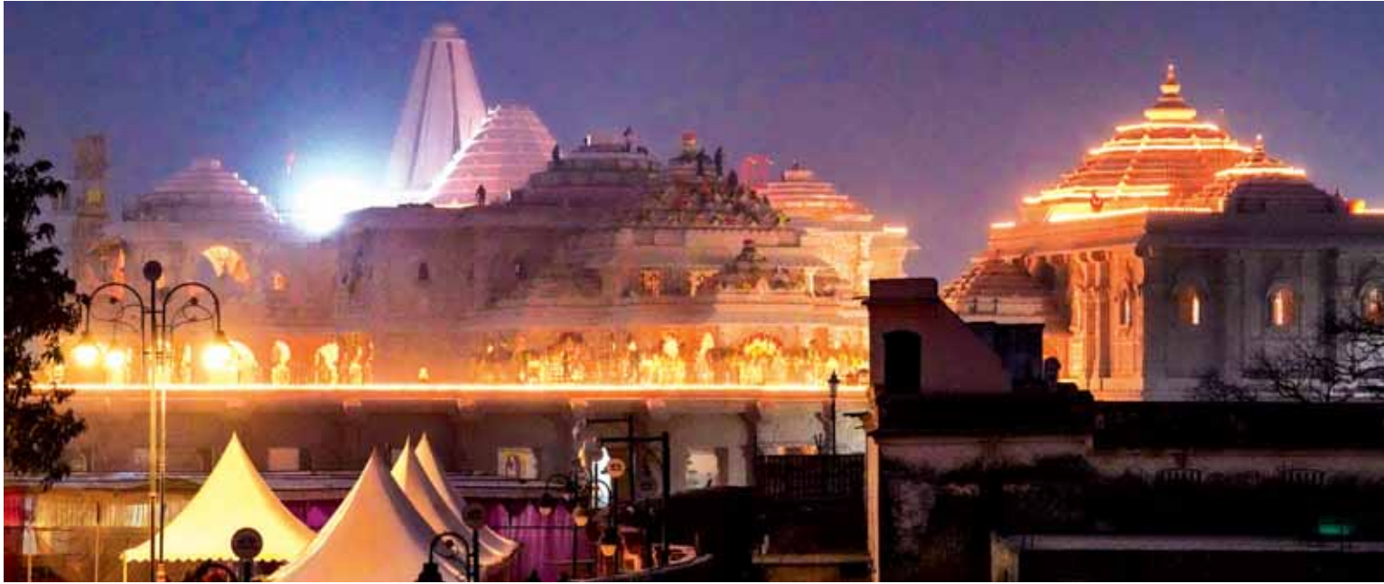
Evening view of the Ram Temple ahead of its consecration ceremony in Ayodhya

In the lead-up to the consecration ceremony, the trust has witnessed a remarkable surge in daily donations and offerings to Ram Lalla. The trust is currently receiving three to four lakh daily, with monthly donations ranging from ₹1.5 crore to ₹2 crore. The spokesperson added, "The outpouring of contributions demonstrates the global reverence for Ram Lalla and the significance attached to the completion of the temple."