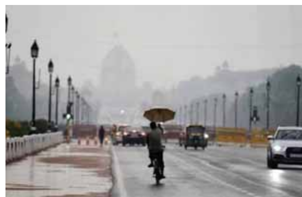
ious observatories in Delhi late night on Tuesday, with Safdarjung recording a visibility of 500 metres and Palam recording 700 metres at 11.45 pm. Delhi's Indira Gandhi International Airport reported a visibility of 600 metres from 5.30 am. Several flights were delayed at the Indira Gandhi International Airport. According to the Indian Railways, 24 Delhi-bound trains were delayed by one to six hours due to fog in parts of northern India. According to IMD, the national capital has not received any rainfall in January so far, an unusual occurrence when compared to previous years, according to IMD's data. In the last seven years, Delhi saw one to six days of rain in January where normal rainfall during the month is 8.1 mm at Safdarjung Observatory, the

Some parts of Delhi and its neighbouring areas in the National Capital Region (NCR) received light rainfall in the early hours of Wednesday as cold wave conditions continued to prevail in the national Capital and several other places in North India. The India Meteorological Department (IMD) reported 'trace' rainfall at the Safdarjung observatory. Delhiites on Wednesday woke up to a slight respite from biting cold as the national capital recorded a minimum temperature of 8.3 degrees Celsius, a notch above the season's average. The maximum temperature was settled at 18.3 degree Celsius, two notches below the normal. Dry icy winds added the chill to the capital. Mungeshpur was the coldest station which recorded at 14.8 degree Celsius. Followed by Jafarpur at 15.1 degree Celsius. The city saw some respite from "cold day" conditions on Wednesday with a slight rise in maximum and minimum temperatures, although the weather department expects respite to continue towards Thursday. Delhi has experienced five cold days and five coldwave days in January so far, the highest in the past 13 years, according to India Meteorological Department data. The visibility improved at var-