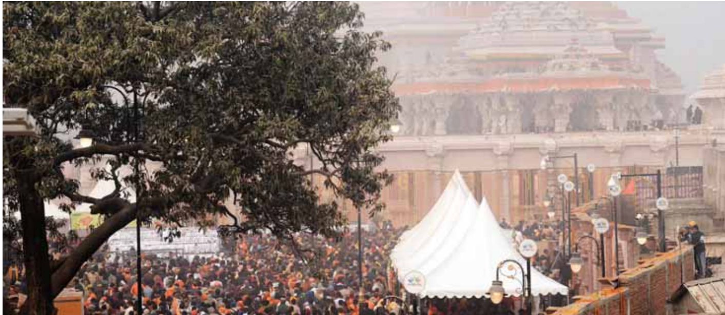
Barricading inside the temple premises has been strategically implemented to streamline the devotees' movement and prevent chaos. A security official highlighted the organised arrangement, saying, "There was a queue outside the temple today. There was an atmosphere of chaos on Tuesday, but that is no more. Devotees are being sent to the sanctum sanctorum by forming groups."

PIONEER NEWS SERVICE ■ LUCKNOW Despite temperatures plummeting to 2.9 degrees Celsius, the unyielding devotion of pilgrims continues to illuminate Ayodhya, as devotees persist in seeking darshan of Ram Lalla for the second consecutive day.