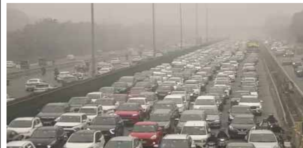
STAFF REPORTER ■ NEW DELHI