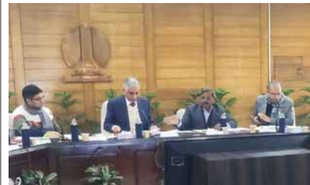
STAFF REPORTER ■ NEW DELHI

The New Delhi Municipal Council (NDMC) on Wednesday approved various proposals relating to citizens, employees and tech-driven education initiatives. The members of the NDMC also proposed a vote of thanks to Prime Minister Narendra Modi for the inauguration of Ram temple in UP's Ayodhya and expressed their gratitude to him. The Council approved distribution of Pre-loaded Tablets for Digital Learning to the students and teachers of Class-9th to Class 12th in NDMC and Navyug Schools. "NDMC had distributed 811 tablets to the students of Class 10th and 12th in four Schools as pilot project. Now, this project is being extended for procurement and distribution of