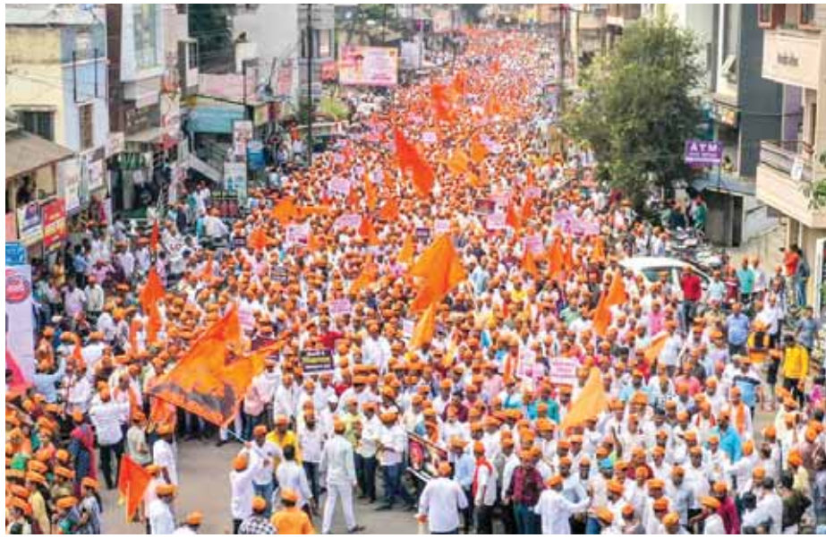
Before the morcha's entry into Mumbai, the State government had sent out a delegation to meet Jarange Patil...