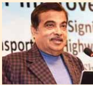
Highways (MoRTH), said, "The Ministry of Roads will soon adopt a qualitative tendering

Nitin Gadkari, the Union Minister of Road Transport and