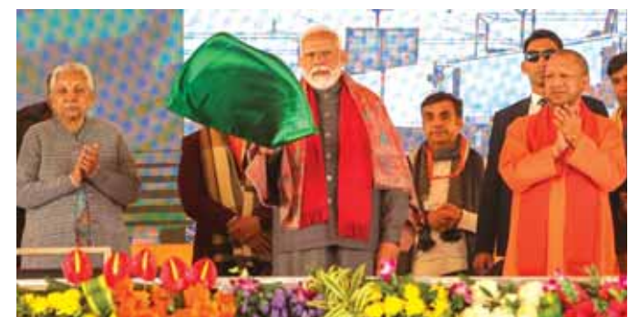
Prime Minister Narendra Modi with Uttar Pradesh Governor Anandiben Patel, Chief Minister Yogi Adityanath, and others during the inauguration and foundation stone laying ceremony of various developmental projects in Bulandshahr on Thursday