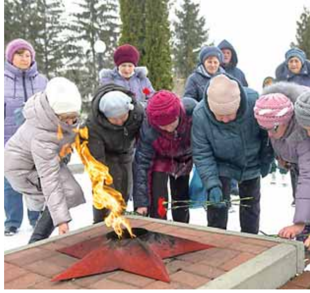
Women lay flowers in memory of those who were killed in the plane on Wednesday, at the memorial to soldiers who died in the Great Patriotic War “Eternal Flame” in Belgorod, Russia.

■ MOSCOW Investigators have found the flight recorders of a Russian military transport plane that crashed in a border region near Ukraine, Russian media reported Thursday, a day after Moscow accused Kyiv of shooting down the aircraft, which it said was carrying 65 Ukrainian prisoners of war. The Il-76 crashed in a huge ball of fire in a rural area of Russia on Wednesday, and authorities said all 74 people on board, including the POWs, six crew and three Russian servicemen, were killed. Ukraine’s president has demanded an international investigation into the episode, which has triggered a spate of claims and counterclaims. Russian officials accused Kyiv of shooting down the plane with two missiles and said the prisoners of war were headed for an exchange. They offered no evidence for their allegation. The Associated Press could not independently confirm who was aboard or how the plane was downed. The commander of Ukraine’s air force accused Russia of “rampant...propaganda” — though he did not specifically address the allegations. Ukrainian authorities confirmed a prisoner exchange was due to happen Wednesday, and that it was called off, but said they had no information about who was on the plane. “We haven’t seen any indication that such a large number of people was on that plane, Ukrainian citizens or not,” Dmytro Lubinets, Ukraine’s human rights ombudsman, said on national television Thursday. Ukrainian officials noted that Moscow didn’t ask for any spe