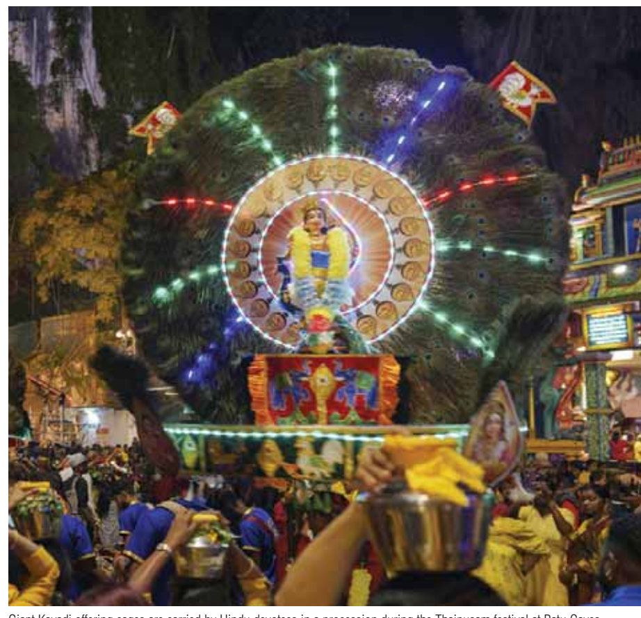
Giant Kavadi offering cages are carried by Hindu devotees in a procession during the Thaipusam festival at Batu Caves, outskirts of Kuala Lumpur, Malaysia, on Thursday. Thaipusam, which is celebrated in honour of Hindu god Lord Murugan, is an annual procession by Hindu devotees seeking blessings, fulfilling vows and offering thanks