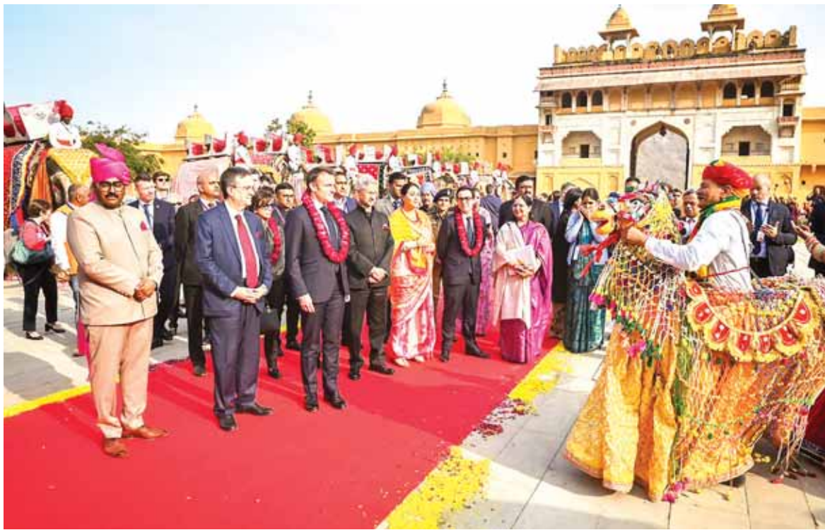
French President Emmanuel Macron during his visit to the Amber Fort in Jaipur