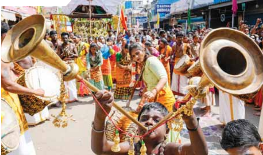
Devotees take part in a religious procession to celebrate Thaipusam festival, in Chennai