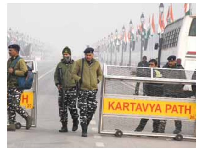
Ranjin Dimri / The Pioneer