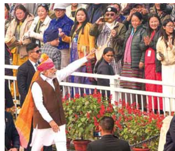
Prime Minister Narendra Modi acknowledges the crowd as he leaves after the 75th Republic Day function, at the Kartavya Path in New Delhi on Friday

For the first time, an all-women tri-services contingent marched down Kartavya Path, reflecting the country's growing 'Nari Shakti' (women power). In another first, the parade was heralded by over 100 women artists playing Indian musical instruments such as sankh, naadsawram, and nagada instead of traditional military bands, kickstarting the celebrations. The first Army contingent leading the mechanised column was the 61 Cavalry, established in 1953. It was followed by 11 mechanised columns, 12 marching contingents, and a fly-past featuring advanced light helicopters of the Army Aviation Corps.