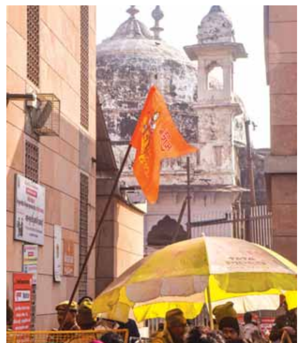
Muslims come out of Gyanvapi mosque after offering 'namaz' amid a tight security arrangements in Varanasi on Friday