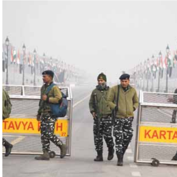
Security personnel at Kartavya Path