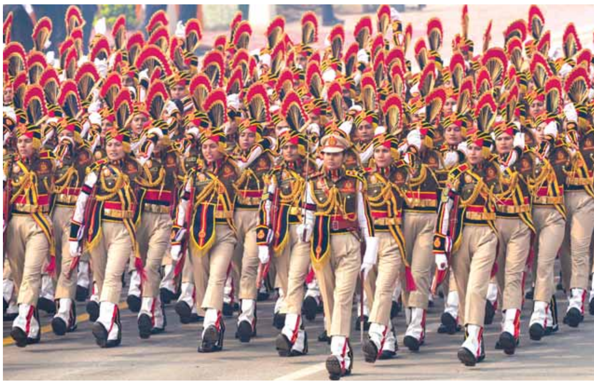
Women personnel in a marching contingent of the Delhi Police during the 75th Republic Day parade, at the Kartavya Path in New Delhi on Friday

India celebrated its 75th Republic Day on Friday with a grand display of its women power, rich cultural heritage, and military might, which included missiles, warplanes, surveillance gadgets, and lethal weapon systems. French President Emmanuel Macron graced the occasion as the chief guest. The Republic Day Parade at Kartavya Path in the heart of the national capital commenced with President Droupadi Murmu taking the salute shortly after she and Macron, flanked by the Indian President's bodyguards, arrived in a traditional buggy. Prime Minister Narendra Modi, Defence Minister Rajnath Singh, several other Union ministers, the country's top military brass, foreign diplomats, and senior officials were among those who witnessed the impressive show. The event also featured a gravity-defying fly-past by helicopters and planes, with even dense fog failing to dampen the spirits of the spectators.