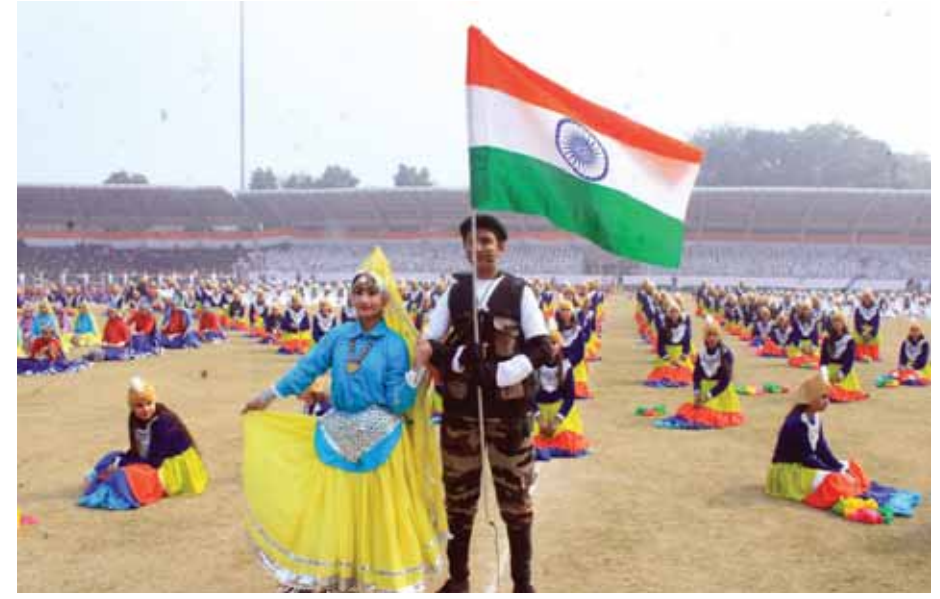
Schoolchildren perform during the Republic Day parade at Chhatrasal Stadium Ranjan Dimri