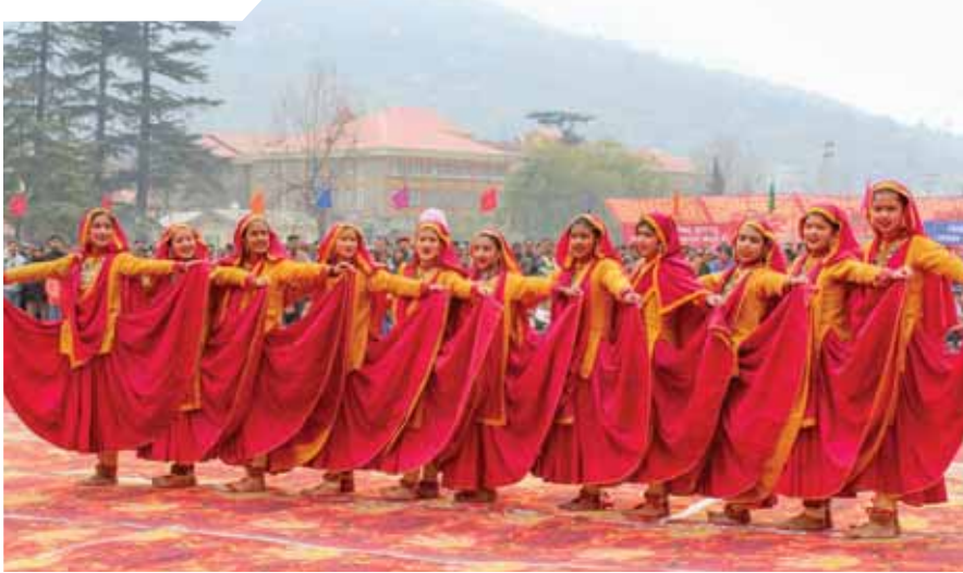
Artists perform during the 75th Republic Day celebrations in Kullu