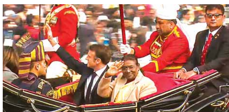
President Droupadi Murmu and French President Emmanuel Macron riding in a special presidential carriage arrive at the Kartavya Path for the 75th Republic Day celebrations in New Delhi on Friday

attention at the grand parade. This marked the second time the French armed forces participated in India's Republic Day celebrations. In 2016, French troops became the first foreign military contingent to take part in the country's biggest ceremonial event.