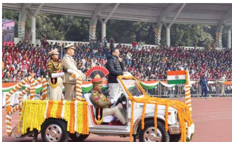
Delhi Chief Minister Arvind Kejriwal inspects the Republic Day parade at Chhatrasal Stadium Ranjan Dimri | Pioneer