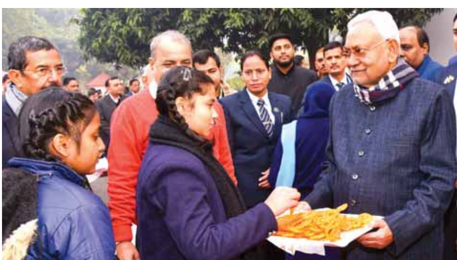
Bihar Chief Minister Nitish Kumar offers 'jalebi' to school students during the 75th Republic Day celebration, at his official residence in Patna

Amid political uncertainty in Bihar, where Chief Minister Nitish Kumar is, in all likelihood, prepared to break ranks with his alliance partners RJD, Congress, and others, and realign with his "natural" ally BJP, former Deputy Chief Minister and senior BJP leader Sushil Kumar Modi indicated that doors are never permanently closed to anyone in politics. Ever since Nitish separated for the third time from the BJP in Bihar, Sushil Modi has, on numerous occasions, said that Nitish will not be welcomed back into the BJP fold. However, sources in both the BJP and the JD(U) indicated that a "dignified" realignment is being worked out against the backdrop of BJP leadership repeatedly tagging Nitish as a 'Paltu Ram'. BJP sources have asserted that the JD(U) joining their alliance will ensure a sweeping victory