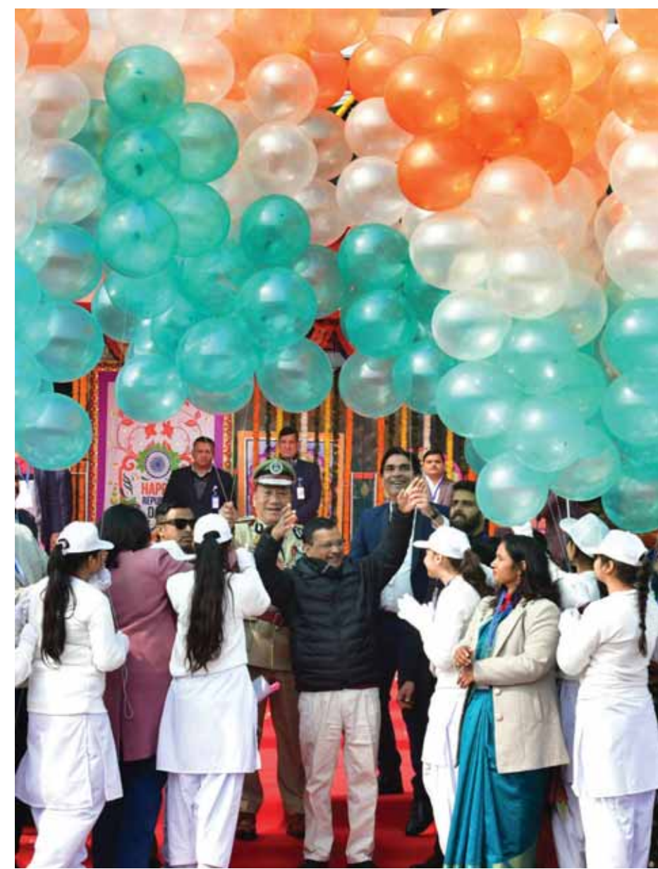
Delhi Chief Minister Arvind Kejriwal interacts with schoolchildren