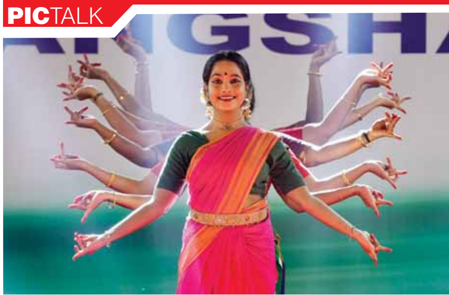
Artistes perform during the presentation of the best tableau in the Republic Day parade, in New Delhi

handsomely to the NDA's kitty in the general elections. Nitish's decision to realign with the BJP has far-reaching consequences, influencing not only his political trajectory but also the future dynamics of the NDA and INDIA bloc. Interestingly, the Bihar developments coincide with Rahul Gandhi's Bharat Jodo Nyay Yatra entering the State. It is sure to have a dampening effect on the Congress' campaign and lower its confidence considerably. However, nothing can be said with finality about Nitish. It will all depend on the understanding he has with the BJP and how the latter treats him. His switch was ostensibly prompted by the treatment he received from his INDIA partners. During alliance meetings, clashes of aspirations and perceived attempts by the RJD to expand its influence within the JD(U) hint at a shifting power dynamic. Nitish's political somersault and his realignment with the BJP have unleashed a series of ripple effects that extend far beyond the borders of Bihar. The departure of this seasoned politician from the INDIA bloc has injected an element of uncertainty into the political equations, casting shadows over the future cohesion and effectiveness of the coalition. The nation observes closely as this strategic realignment unfolds, shaping the future contours of Indian politics.