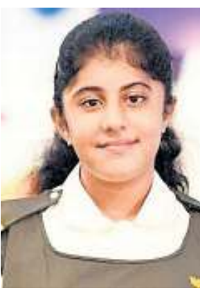
Telangana State Police.

She gathered over 6,498 used books and established nine libraries, the first of which is at MNJ Cancer Children Hospital, the second at the Sanath Nagar Police Station, the third at the Gayathri Nagar Association, Borabanda, the fourth at the Juvenile and Observation Home for Girls Hyderabad, the fifth with the Coimbatore City Police Street libraries, and the sixth at Chennai Boys Club in the Nalamur Police Station, the seventh library at Government High School, Sanath Nagar, Eighth Library was at Bharosa Centre at Siddipet maintained by Women Safety wing of