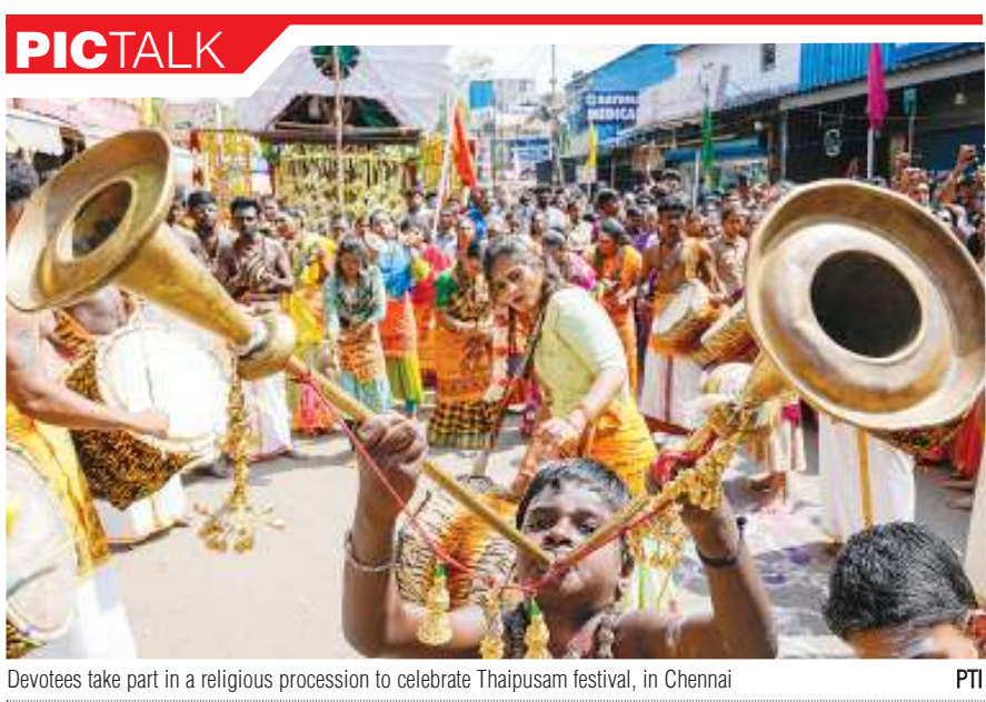
Devotees take part in a religious procession to celebrate Thaipusam festival, in Chennai PTI