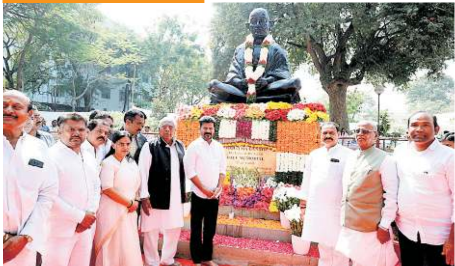
Chief Minister A Revanth Reddy and other Congress leaders pay tributes to the statue of Mahatma Gandhi to mark his death anniversary in Hyderabad on Tuesday