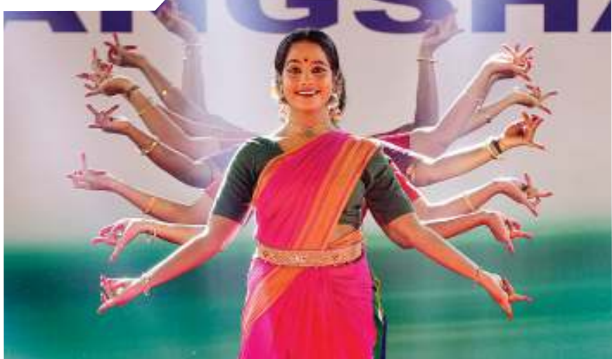
Artistes perform during the presentation of the best tableau in the Republic Day parade, in New Delhi