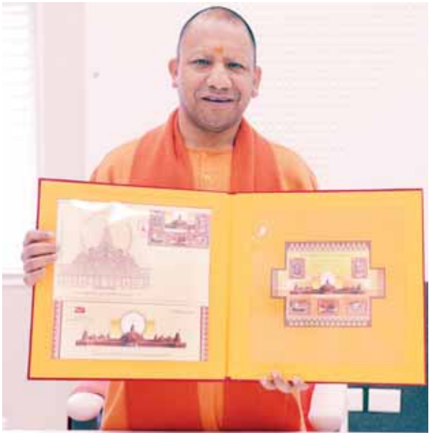
C Yogi Adityanath with the Ayodhya's Ram temple postal stamp, launched by PM Narendra Modi, at his official residence in Lucknow on Tuesday

Despite instructing officials to re-verify and provide assistance to farmers excluded from compensation, several district officials in the state failed to conduct surveys on the farmers affected by crop damage. As a result, the farmers were not able to receive