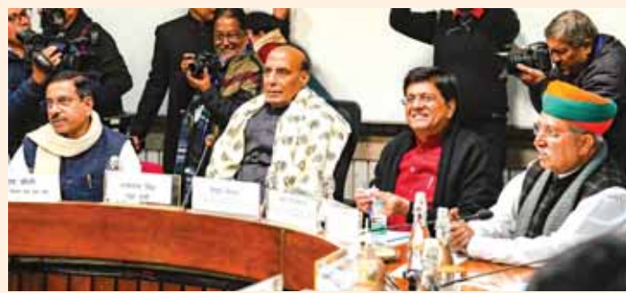
Union Defence Minister Rajnath Singh with Union Ministers Piyush Goyal and Pralhad Joshi, Union Minister of State Arjun Ram Meghwal and others during an all-party meeting ahead of the Budget session of Parliament in New Delhi on Tuesday