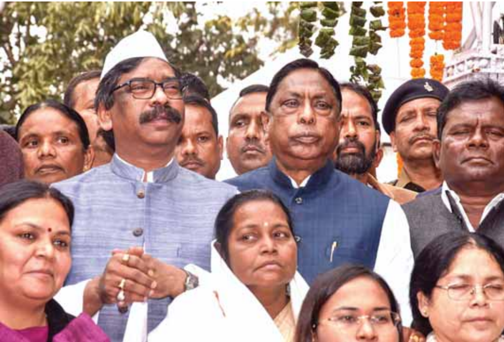
Jharkhand Chief Minister Hemant Soren with JMM MLAs after paying tribute to Mahatma Gandhi on his death anniversary, in Ranchi, on Tuesday

Travelling in his official car, Soren smiled and waved at the media persons amid intense speculation of his whereabouts.