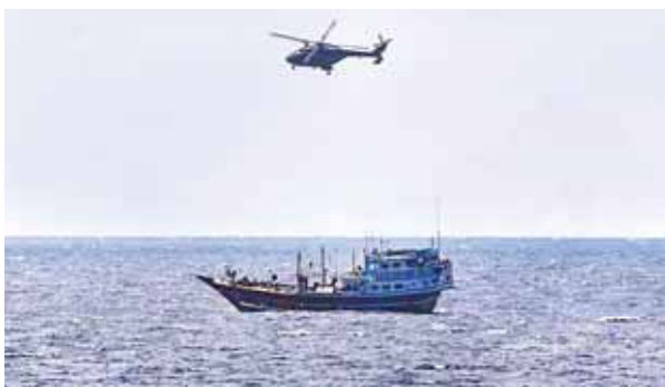
An anti-piracy operation by the Indian Navy's INS Sumitra, rescuing Fishing Vessel Al Nazeemi and her Crew (19 Pakistani Nationals) from 11 Somali Pirates off the East Coast of Somalia

In a similar action, the Indian Navy responded to the hijacking of a Sri Lankan fishing vessel in collaboration with Seychelles defence forces and the Sri Lanka Navy, officials said here on Tuesday.