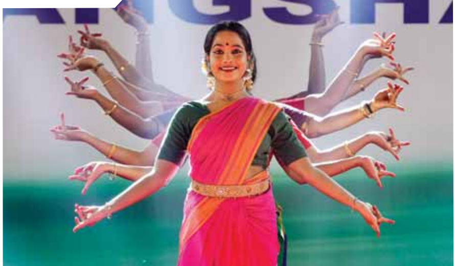
Artistes perform during the presentation of the best tableau in the Republic Day parade, in New Delhi