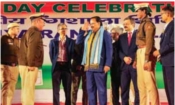
Defence MoS Ajay Bhatt during the presentation of the Republic Day parade 2024 best marching contingent trophy to Delhi Police Women among the CAPF and others auxiliary forces in Judges Choice category, in New Delhi

The beautiful beaches and the island experience, coupled with affordable airfare that is even cheaper than the cost of travel to some Indian cities, have been a big draw for Indian tourists.