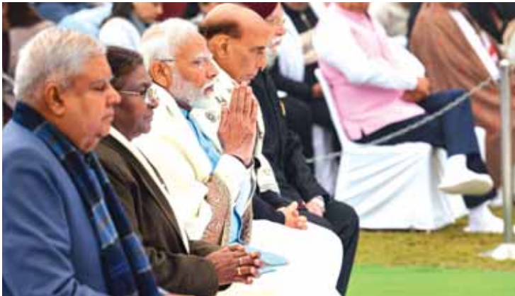
President Droupadi Murmu, Vice President Jagdeep Dhankar, Prime Minister Narendra Modi, Union Defence Minister Rajnath Singh and others pay homage to Mahatma Gandhi on Martyrs' Day, observed to mark the death anniversary of the father of the nation, at Rajghat in New Delhi

One such memory from the past, rarely read or known about, is the place where Mahatma Gandhi, on August 16, 1908, led 3,000 Muslims, Hindus, and Christians outside the Hamidia Mosque at Johannesburg in South Africa, where they burned their passes — documents classified as "non-white" by the Government.