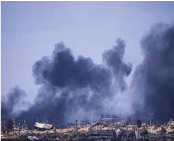
Smoke rises following an Israeli bombardment in the Gaza Strip, as seen from southern Israel on Tuesday.

Israeli forces disguised as civilian women and medical workers stormed a hospital on Tuesday in the occupied West Bank, killing three Palestinian militants in a dramatic raid that underscored how deadly violence has spilled into the territory from the war in Gaza. The Palestinian Health Ministry said Israeli forces opened fire inside the wards of the Ibn Sina Hospital in the town of Jenin. The ministry condemned the raid and called on the international community to pressure Israel's military to halt such operations in hospitals. A hospital spokesperson said there was no exchange of fire, indicating that it was a targeted killing. The military said the militants were using the hospital as a hideout, without providing evidence. It alleged that one of those targeted in the raid had transferred weapons and ammunition to others for a planned attack, purportedly inspired by the Hamas assault on southern Israel on October 7 that triggered the