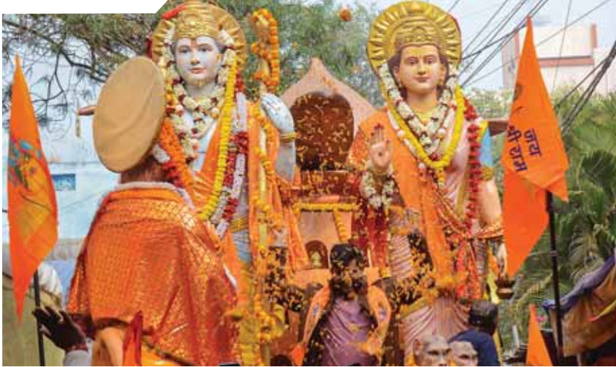
Devotees participate in a 'Ram Rath Yatra' ahead of the consecration ceremony of Ayodhya Ram temple, in Ranchi