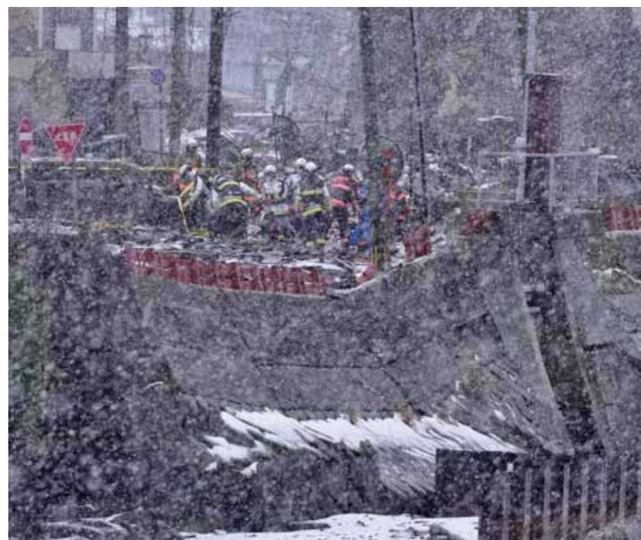
Firefighters search for missing people in the snow in Wajima, Ishikawa prefecture, Sunday. Rescue teams worked through snow to deliver supplies to isolated hamlets Monday, a week after a powerful earthquake hit western Japan.