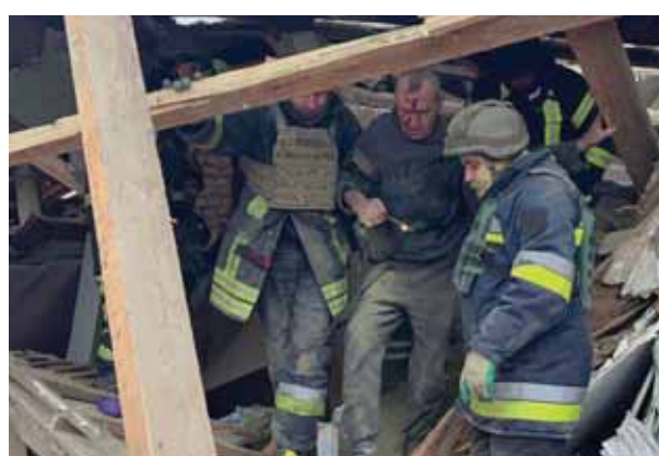
In this photo provided by the Ukrainian Emergency Service, emergency workers help a wounded man after a residential houses were badly damaged in a Russian missile attack, near Kryvyi Rih, Ukraine, on Monday

Authorities in the Khmelnytskyi region said two people died as at least six explosions were heard during the morning missile attack. Meanwhile, Russian troops