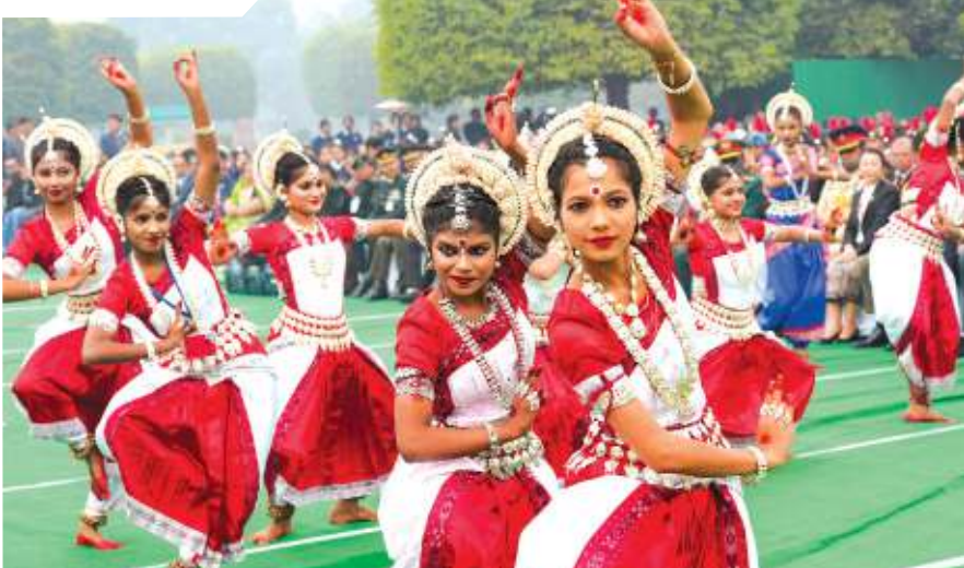
Artists who participated in the 75th Republic Day parade perform at the Rashtrapati Bhavan, in Delhi