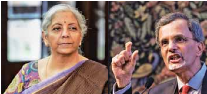
Chief Economic Advisor V Anantha Nageswaran addresses a Press conference after tabling of the Economic Survey 2023-24 in Parliament by Union Finance Minister Nirmala Sitharaman, in New Delhi, on Monday

uncertain global economic performance. Improved balance sheets will help the private sector cater to strong investment demand. The Survey also added a note of caution saying "private capital formation after good growth in the last three years may turn slightly more cautious because of fears of cheaper imports from countries that have excess capacity". While merchandise exports are likely to increase with improving growth prospects in advance