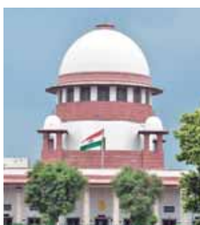
Supreme Court

In an interim order, the Supreme Court on Monday stayed the directives issued by the Governments of Uttar Pradesh and Uttarakhand directing eateries along the Kanwar Yatra route to display names of owners, the staff and other details "to ensure... no confusion among kanwariyas" but said they will be required to display the kind of food they are selling to the Kanwariyas. The bench of Justices Hrishikesh Roy and SVN Bhatti passed the interim order while issuing notice to the Governments of Uttar Pradesh, Uttarakhand and Madhya Pradesh, where the