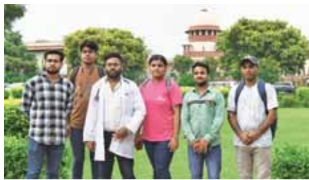
Students and others are seen within the precinct of the Supreme Court during a hearing on a batch of petitions related to the controversy-ridden medical entrance exam NEET-UG 2024, in New Delhi on Monday

track down the footprints of terrorists. Special forces were also inducted in the ongoing operations spread across the thickly forested area. In a post on X, White Knight Corps said, "Terrorists attacked the house of a VDC at Gunda, Rajouri at 3.10 am. A nearby Army column reacted and a firefight ensued. In another update the White Knight Corps posted on X, "Indian Army acted on intelligence, anticipating the threat to a Village Defence Guard in a remote area in Rajouri - Reasi. Tactical teams swiftly intervened, ensuring no harm to the VDC member and his family. Operations are continuing and a firefight is in progress". Additional troops remained stationed in the area during the day to instil confidence among the fear-stricken residents. The villagers also raised the demand to equip the local village defence guards with modern weapons to tackle the growing threat of terrorist violence in the remote areas of the Jammu region. To counter the growing threat of terrorism in the Jammu region the Indian Army has already inducted more than 3,000 troops and 500 para commandos to launch massive combing operations to neutralise Pakistani terrorists active in the area. According to a preliminary assessment over 50 Pakistani terrorists have infiltrated inside the Indian territory to launch targeted strikes on the security forces.