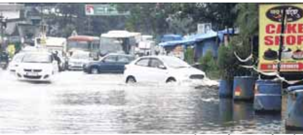
PTI ■ MUMBAI

Several locations in Mumbai received over 200 mm of rainfall in the 24 hours leading up to 8 AM on Monday, with the intense rain in the morning briefly disrupting local train services during the rush hour between Kalyan and Thakurli stations, causing delays. Some areas received up to 34 mm of rainfall in just one hour between 6 AM and 7 AM. The civic body claimed its Automatic Weather Stations (AWS) located across the city recorded more than 200 mm of rainfall at multiple locations in the last 24 hours ending at 8 AM. Three teams of the National Disaster Response Force (NDRF) have been deployed in Mumbai to tackle any situation amid the forecast of a high tide and moderate to heavy rains in the city and its suburbs, officials said.