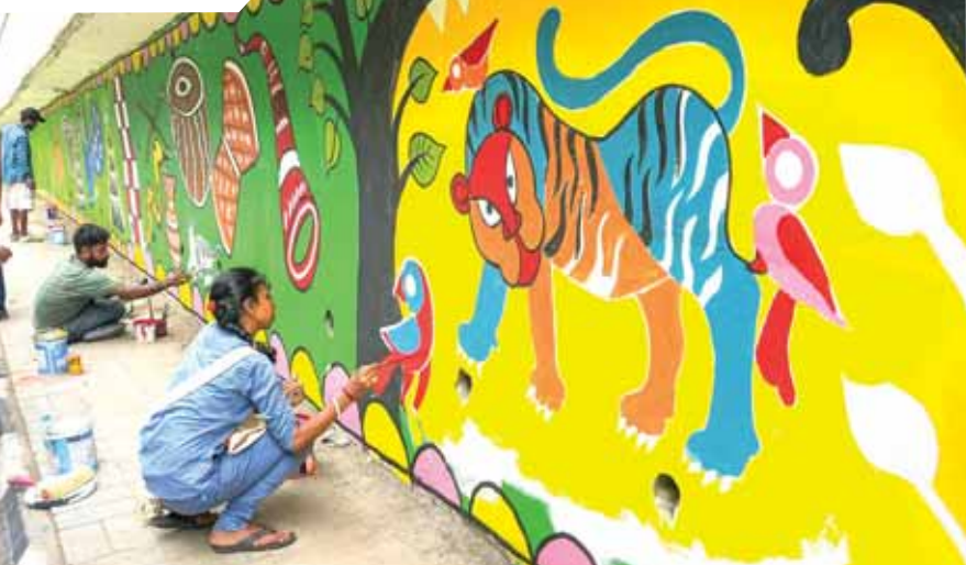
Artists decorate a wall for the 46th Session of UNESCO's World Heritage Committee, in New Delhi