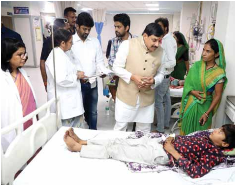
Madhya Pradesh Chief Minister Mohan Yadav inspects Government Hamidia Hospital in Bhopal on Monday.

lish new dimensions of success. One-to-one meetings providing prompt solutions to problems Regional Industry Conclaves being held in the state are becoming the basis for the development of industries due to multidimensional activities. While these conclaves prove to be important platforms through buyer-seller meets, one-to-one meetings between Yadav and leading industrialists will prove to be a milestone for the establishment of large industrial units. One-to-one meetings help in the quick resolution of difficulties or any obstacle that arises in providing necessary facilities to the industries. The role of the MSME sector is becoming increasingly important in strengthening the economy of the state.