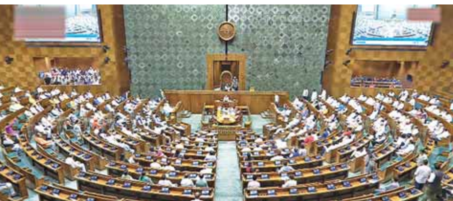
Lok Sabha Speaker Om Birla being greeted by TMC MP Shatrughan Sinha after the latter took oath as a member of the House during the first day of the Parliament Session, in New Delhi, on Monday

of the economy and identifies areas for further growth and progress as "we move towards building a Viksit Bharat". Chief Economic Advisor V Anantha Nageswaran on Monday said a 7 per cent GDP growth rate, the upper end of the projection made in the Survey, is doable depending on monsoon and global financial risks. The Economic Survey is an annual document presented by the Government ahead of the Union Budget to review the state of the economy.