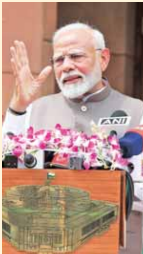
Prime Minister Narendra Modi addresses the media on the first day of the Parliament Session, in New Delhi, on Monday

A day before his Government is to present its first Budget in the third term, Prime Minister Narendra Modi outlined the agenda for this Session with an appeal to the Opposition to be constructive and a combative message saying some parties have practised "negative politics" and "misused" Parliament to hide their political failures. "In a democracy, there should be no place for tantrums to silence the Prime Minister for 2.5 hours, stifling his voice. It is a cause for concern that there is no remorse or regret for such actions," the Prime Minister said. His remarks were an apparent reference to the incident in the last Session when Modi delivered his reply to the debate on the Motion of Thanks on the President's Address amid vociferous protests and sloganeering by the Opposition that was demanding that both MPs from Manipur be allowed to speak. Asserting that Parliament is not for 'dal' but for 'desh', Modi said people have given their verdict in the Lok Sabha polls and now all political parties must work together for the country for the next five years. "This Parliament is not for 'dal (party)' but for 'desh (country)'" This Parliament is not limited to MPs but it is for 140 crore people of the country," the Prime Minister said. He appealed to MPs from all parties to set aside political difference and participate in discussions in a constructive