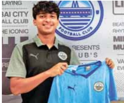
Super Division League during the 2022-23 season. He also participated in the Reliance