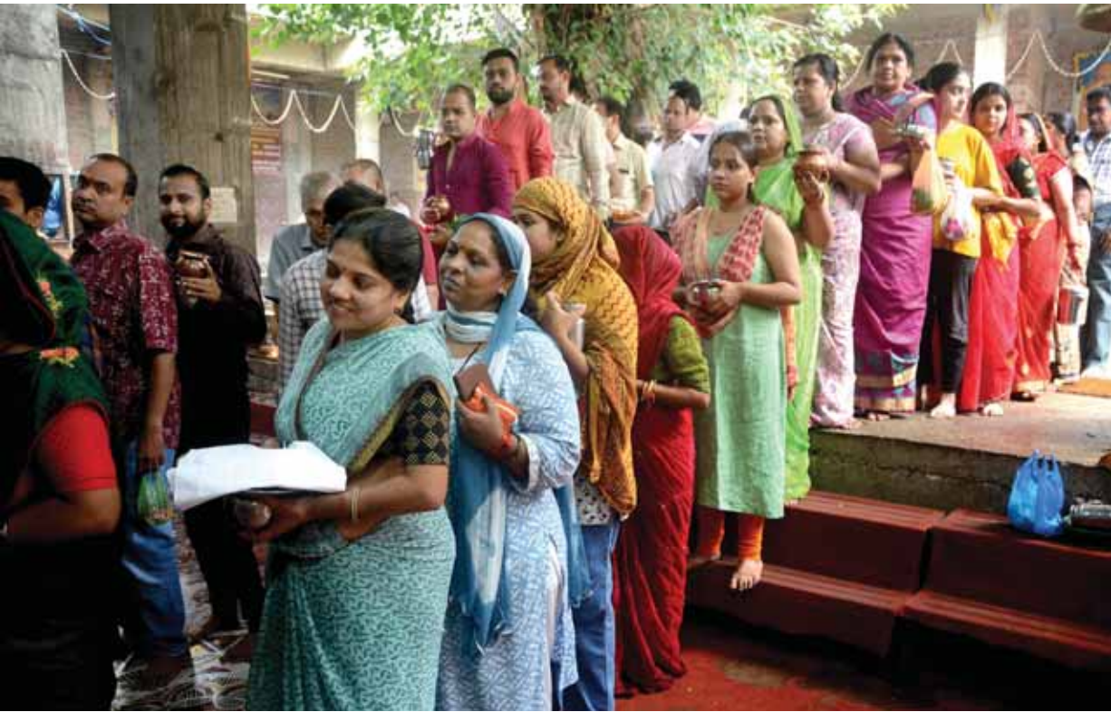
Devotees wait in a queue to offer prayers on the first Monday during the holy month of Shravan, at Badwale Mahadev temple in Bhopal on Monday.

Kolans, Bada Talab, Bhabhbada and Kaliyasot Dam are connected to each other. This time the monsoon entered Bhopal on 23 June. Since then, the rainy season has continued. Due to this, half the rain has already occurred in a month. The total normal rainfall in Bhopal is 37.6 inches. In comparison, 18.7 inches of water has fallen so far. The average rainfall in Bhopal in July is 367.7 mm i.e. 14.4 inches. More than 9.6 inches of water has fallen in Bhopal from 1 to 21 July. Now about 5 inches more water is needed to complete the quota of July. Meteorologists said that there is a trend of heavy rain in the second fortnight of July. Similar weather is prevailing this time also. It has been raining continuously since July 15. Now since there is a strong system. Therefore, the period of heavy rain will continue.