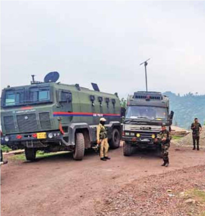
Army personnel during an encounter with terrorists in Gundha area of Rajouri district on Monday