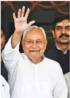
Bihar Chief Minister Nitish Kumar

In a written reply in the Lok Sabha on the first day of the Monsoon Session, Minister of State for Finance Pankaj Chaudhary said Special Category Status was granted in the past by the National Development Council (NDC) to some States which were characterised by a number of features necessitating special consideration. These included hilly and difficult terrain, low population density or sizeable share of tribal population, strategic location along borders with neighbouring countries, economic and infrastructural backwardness and non-viable nature of state finances, he said in reply to a question asked by JD(U) member Rampreet Mandal. The decision was taken based on an integrated