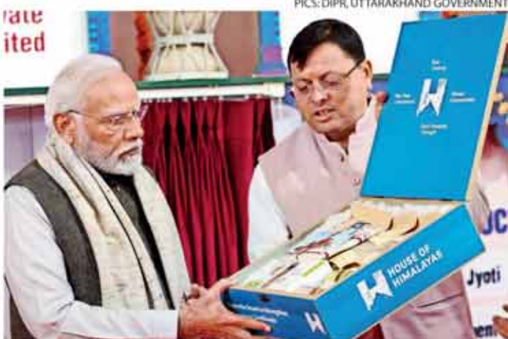
CM Pushkar Singh Dhami presenting 'House of Himalayas' brand products to PM Narendra Modi at GIS 2023, Dehradun

Nestled in the lap of the Himalayas, Uttarakhand is well-known for its beautiful landscapes, along with its rich treasure trove of organic and traditionally prepared products. Identifying the untouched potential of these products and the demand to strengthen rural livelihoods, the Uttarakhand government has been working actively by undertaking several schemes.