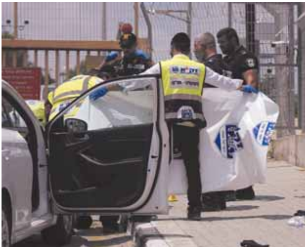
Israeli Police and ZAKA emergency service work at the scene of an attempted stabbing attack at the entrance to Netiv Haasara, near the Gaza border in southern Israel on Monday.