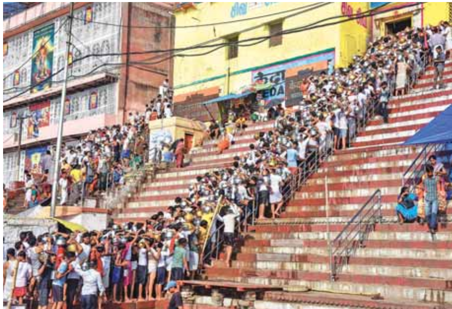
Devotees arrive to perform 'Jalabhishek' ritual on the first Monday of Sawan month, at Kedar Ghat in Varanasi, on Monday