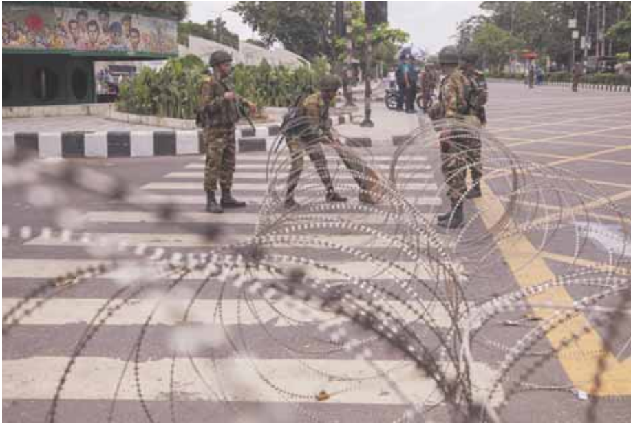
Bangladeshi military forces soldiers put up barbed wires on a main street in Dhaka, Bangladesh, Monday, July 22

Bangladesh remained without internet for a fifth day and the government declared a public holiday Monday, as authorities maintained tight control despite apparent calm following a court order that scaled back a controversial system for allocating government jobs that sparked violent protests. This comes after a curfew with a shoot-on-sight order was installed days earlier and military personnel could be seen patrolling the capital and other areas. The South Asian country witnessed clashes between the police and mainly student protesters demanding an end to a quota that reserved 30% of government jobs for relatives of veterans who fought in Bangladesh's war of independence in 1971. The violence has killed more than a hundred people, according to at least four local newspapers. Authorities have not so far shared official figures for deaths. There was no immediate violence reported on Monday morning after the Supreme Court ordered, the day before, the veterans' quota to be cut to 5%. Thus, 93% of civil service jobs will be merit-based while the remaining 2% reserved for members of ethnic minorities as well as transgender and disabled people. On Sunday night, some student protesters urged the govern-