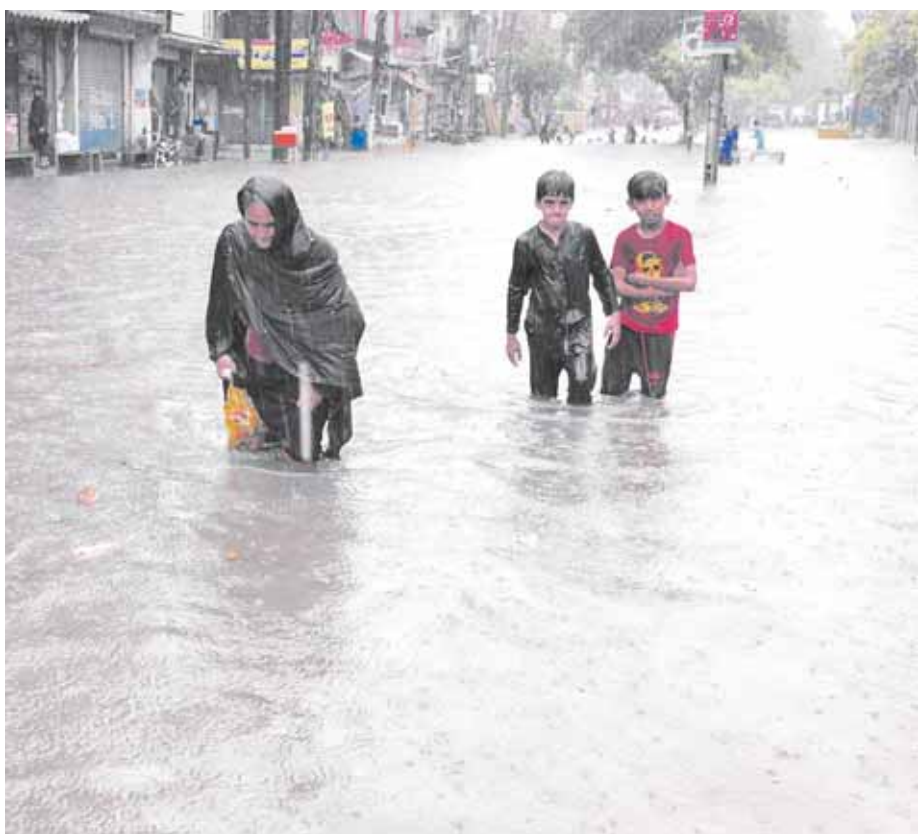
A woman and children wade through a flood road during heavy rainfall in Lahore, Pakistan, on Friday

A Russian passenger jet crashed Friday while flying empty, killing its crew of three, officials said. The Sukhoi Superjet went down in the Moscow region, according to Russian emergency officials. The authorities said the plane belonged to Gazprom Avia, a carrier owned by the Russian state-controlled natural gas giant Gazprom. They said the plane was heading to Moscow's Vnukovo airport following repairs when it crashed. The Investigative Committee, the country's top state criminal investigation agency, has launched a probe into the crash.