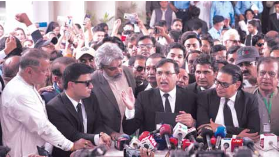
Chairman of Pakistan's Tehreek-e-Insaf party Gohar Khan talks to the media while party supporters react after a Supreme Court decision in a case of reserved seats for women and minorities in parliament, in Islamabad, Pakistan, Friday

February 8 elections as independents after their party was stripped of its election symbol, had joined the SIC to form a coalition of convenience. The apex court on Friday annulled the decision of the PHC and also declared the decision of the election commission "null and void", terming it "against the Constitution of Pakistan". "[The] withdrawal of election symbol cannot disqualify a political party from elections," the court declared, referring to the election commission not allowing the PTI to use the cricket bat as its election symbol. "The PTI was and is a political party," the bench ruled. Khan, a cricketer-turned-politician, founded the PTI in 1996. The decision, announced by Justice Mansoor Ali Shah, was made based on a majority of eight judges. Meanwhile, reacting to the apex court's verdict, PTI said that the party "has been hopeful that the justice will be served in the end, given there