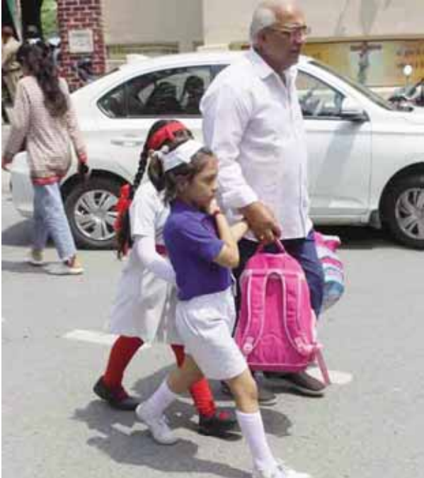
School children return home with an elder on a sunny Friday in Dehradun

Most parts of the State witnessed a break from rainfall on Friday though light to moderate rain was reported in some places. The State meteorological centre has issued a yellow warning (Watch) regarding the possibility of heavy rain accompanied with thunderstorms, lightning and intense spells of rain likely to occur at isolated places in Dehradun, Bageshwar and Nainital districts and thunderstorms accompanied with lightning and intense spells of rain likely to occur at isolated places in Uttarkashi, Tehri, Pauri, Rudrapur, Chamoli, Almora, Champawat and Pithoragarh districts on Saturday. Apart from this, light to moderate rain/thunderstorms are likely to occur at many places in Tehri, Dehradun, Pauri, Pithoragarh, Bageshwar, Almora, Nainital, Champawat and Udham Singh Nagar districts and at a few places in remaining districts of the State today. The provisional State capital Dehradun is forecast to witness a partly to generally cloudy sky. One or two spells of light to moderate rain/thundershowers are also likely to occur. The maximum and minimum temperatures are likely to be about 34 degrees Celsius and 24 degrees Celsius respectively in Dehradun today.