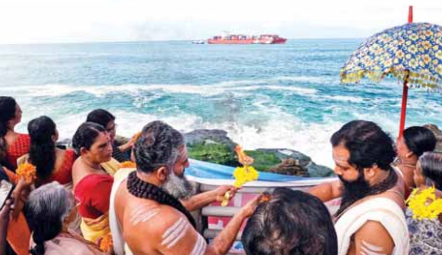
Priests of Shiva Temple perform 'pooja' at the reception of container ship San Fernando, in Thiruvananthapuram