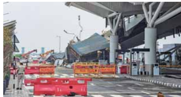
Restoration and relief work underway at the Terminal-1 of the IGI Airport where a canopy collapsed amid heavy rain in New Delhi

Aviation Ram Mohan Naidu on Monday visited the Airport Operations Control Centre (AOCC) at the Indira Gandhi International Airport (IGI) and held a meeting with senior officials from the Ministry of Civil Aviation, DGCA, BCAS, DIAL, and airline operators where he took stock of the operations. The meeting focused on reviewing current operations and passenger handling following the transition of flights from Terminal 1 to Terminals 2 and 3. According to the Ministry, a comprehensive assessment was conducted, involving