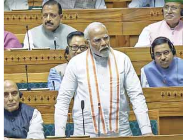
Prime Minister Narendra Modi speaks in the Lok Sabha during ongoing Parliament Session, in New Delhi, on Monday

Prime Minister Narendra Modi termed "serious" the remarks made by Leader of Opposition in Lok Sabha, Rahul Gandhi, by calling the entire Hindu society violent and he, along with Home Minister Amit Shah and other Ministers, demanded an apology from the Congress leader. Intervening during Rahul's speech, Modi said, "This issue is very serious. Calling the entire Hindu community violent is a serious issue." Besides Modi, who intervened twice, at least five Cabinet Ministers also interjected during Rahul's speech with Shah demanding his apology for painting the Hindu community as violent. The second intervention by Modi came when Rahul alleged that Ministers do not greet him due to the fear of Modi, the Prime Minister said democracy and the Constitution have taught him to take the Leader of Opposition seriously. Shah said the ruckus created by the Opposition cannot drown the fact that the words — "those who call themselves Hindus indulge in violence" — were used in the House. Shah spoke of the