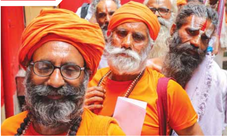
Pilgrims wait in a queue to get themselves registered for the annual Amarnath Yatra, in Jammu