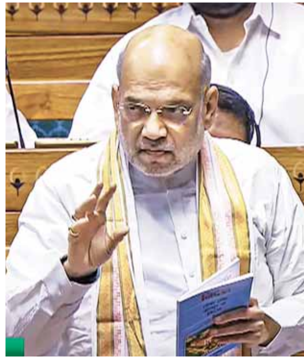
Union Home Minister Amit Shah speaks in the Lok Sabha during ongoing Parliament session, in New Delhi, on Monday

ethos. After 75 years, these laws were contemplated upon and as these laws have gone into effect from today, colonial laws stand scrapped, and laws made in the Indian Parliament are being brought into practice," he said. The Home Minister said justice would be delivered up to the level of the Supreme Court in all cases within three years of the registration of an FIR under the new criminal laws. "The new laws brought in a modern justice system, incorporating provisions such as Zero FIR, online registration of police complaints, summons served through electronic modes such as SMS and mandatory videography of crime scenes for all heinous crimes," he said. He said the new statutes were made more sensitive by adding a chapter on crimes against children and women and the inquiry report in such cases were to be filed within seven days. Shah said, according to the new laws, judgment in criminal cases had to be delivered within 45 days of completion of trial and charges must be framed within 60 days of first hearing. The Home Minister said the laws would be applicable to cases occurring on or after July 1, 2024. Shah said the first case under the new laws was about a motorcycle theft registered in Madhya Pradesh's Gwalior at 10