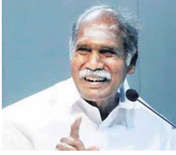
subordinate staff would be posted to man these courts," he said. The chief minister also released a handbook on the new laws and wanted its Tamil translation for the benefit of all.

particularly heinous crimes". Thinking the Central government for implementation of the new laws, the chief minister said that they are aimed at imposing deterrent and stringent punishment on the culprits and also ensuring justice to the victims of crimes.