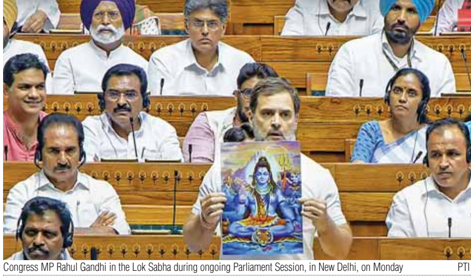
Congress MP Rahul Gandhi in the Lok Sabha during ongoing Parliament Session, in New Delhi, on Monday

In his maiden speech as LoP in Lok Sabha, Rahul triggered a row when he said those who call themselves Hindus are engaged in "violence and hate" round the clock. Rahul said leaders of the ruling party are not Hindus as they engage in "violence and hate" round the clock, drawing massive protests from the Treasury Benches. He, however, hit back at