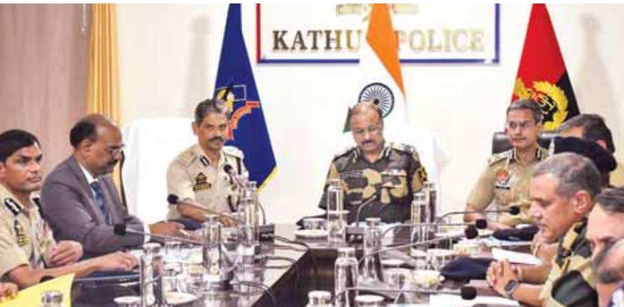
An Inter-State Coordination Conference between BSF, J&K Police, Central Agencies and the Punjab Police being held to focus on enhancing border security and synergy between the two State Police Forces and the Border Guarding Force, in Kathua, Jammu and Kashmir on Thursday