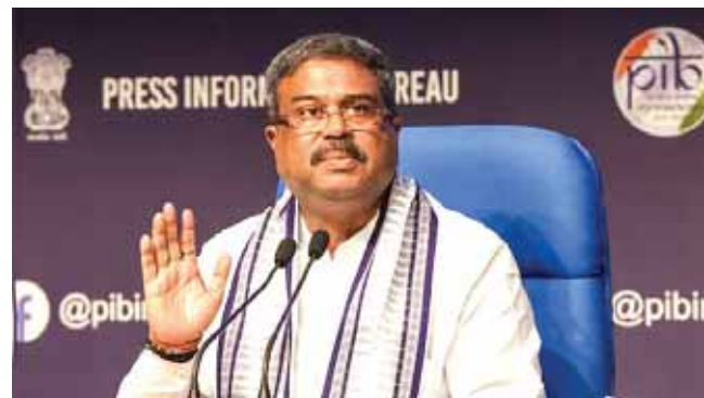
Education Minister Dharmendra Pradhan