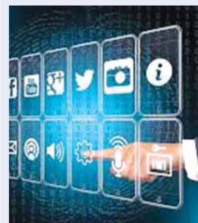
During the IT industry boom, many engineering colleges in India emerged without updated curricula, industry linkages,

or adequate student-faculty ratios. Except for IITs, some NITs, and a few private colleges, these institutions have failed to produce job-ready graduates.