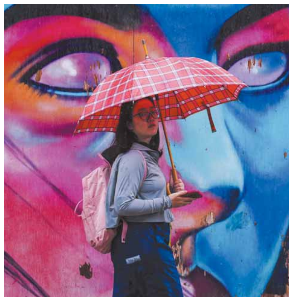
People make their way through the rain as the remnants of Hurricane Beryl hit Ottawa, Ontario

in another economy," Shambaugh said. "The best outcome, though, would be for China to acknowledge the growing concerns among its major trading partners and work with us to address them. We will take defensive action if needed, but we would prefer for China to take action itself to address the macroeconomic and structural forces that are generating the potential for a second 'China shock' for its major trading partners," he said. "China could boost consumption by strengthening its safety net, increasing household incomes and reforming its internal migration rules. It could better support services, not just manufacturing. It could reduce harmful and wasteful subsidies. These would all be in China's interest and reduce tensions," the Treasury official said.