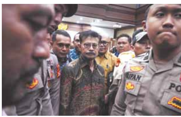
Former Agriculture Minister Syahrul Yasin Limpo is escorted by cops after his sentencing at the Corruption Court in Jakarta, Indonesia, on Thursday

him, and he threatened their jobs if they rejected his demands. Vendors and suppliers were also asked to set aside money to fulfill the then-minister's demands, the trial revealed. Limpo used the money on luxurious cars, gifts and apart-