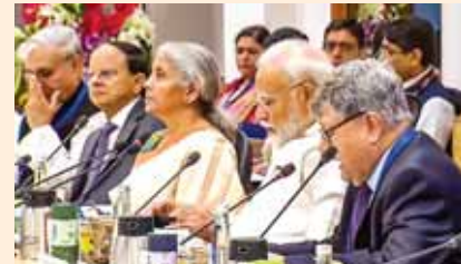
Prime Minister Narendra Modi, Union Finance Minister Nirmala Sitharaman and others during a meeting with economists at NITI Aayog, in New Delhi on Thursday