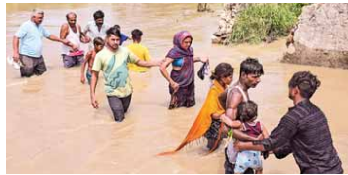
People wade through floodwater after a breach in one of the sub-branches of Munak Canal in New Delhi on Thursday