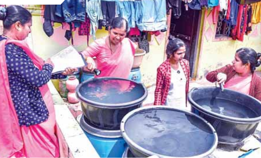
Anganwadi workers conduct inspection of stored water to curb the spread of dengue during monsoon