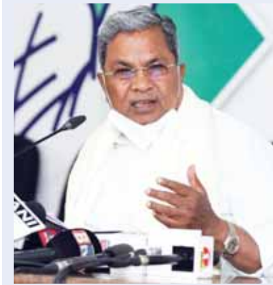
The criticism from business and industry forced the Karnataka government to put the contentious reservation bill for

Kannadigas in private firms on hold. The Karnataka State Employment of Local Candidates in the Industries, Factories, and Other Establishments Bill, 2024, was cleared by the state cabinet. According to the bill, "any industry, factory, or other establishment shall appoint 50 percent of local candidates in management categories and 70 percent in non-management categories."