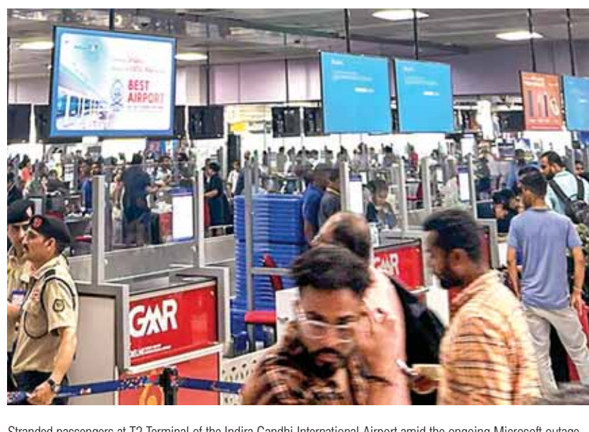
Stranded passengers at T2 Terminal of the Indra Gandhi International Airport amid the ongoing Microsoft outage in New Delhi on Friday. Airport and airline operations faced significant disruptions on Friday due to the outage