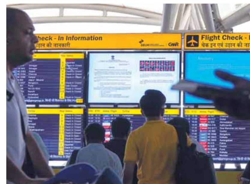
Passengers look at screens, one of them showing Blue Screen error, at T3 Terminal of the Indra Gandhi International Airport amid Microsoft outage, in New Delhi on Friday