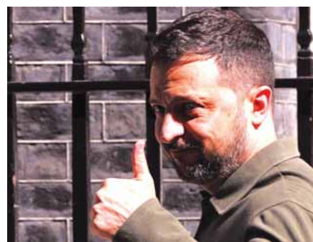
Ukraine's President Volodymyr Zelensky leaves Downing Street after meeting with Britain's Prime Minister Keir Starmer in London on Friday

weapons to strike Russian territory because of concerns that the West could be drawn into direct conflict with Russia. The British government has said it's up to Ukraine how to use missiles supplied by the UK, as long as international law is upheld. In an interview with the BBC, Zelensky said he was seeking clarification about Ukraine's ability to use Storm Shadow missiles supplied by Britain against targets in Russia. The Storm Shadow is an air-launched cruise missile with a range of more than 250 kilometres. "We need a decision about long-distance weapons, long range, to use it," Zelensky said. "We need it very much. They're targeting our hospitals, schools. We just want to answer exactly to the point where they target us." UK Defence Secretary John Healey said Ukraine already has permission to use the missiles against Russia, but the rules for exactly what can be targeted and under what circumstances are "complex ques-