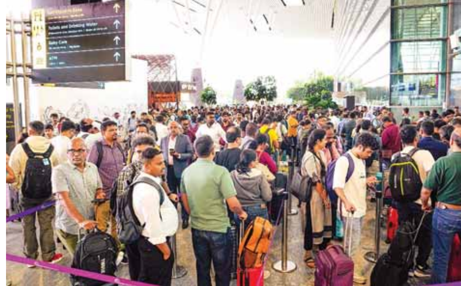
Stranded passengers at the Kempegowda International Airport Bengaluru amid Microsoft outage, in Bengaluru, on Friday. IndiGo, Air India Express, SpiceJet and Akasa at the Bengaluru airport began checking in passengers manually on Friday, issuing handwritten boarding passes, after a global Microsoft outage led to the Navitaire Departure Control System stalling

and ensuring well-being of all travellers. The airports and airline operations, whose systems were based on Microsoft, faced significant disruptions since about 10.40 am on Friday. IndiGo, SpiceJet, Air India and Akasa saw disruptions in their online check-in and boarding processes across their networks, forcing them to switch to manual mode.