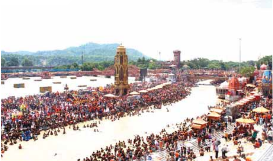
'Kanwariyas' gather at Har Ki Pauri ghat to collect 'Ganga jal', in Haridwar