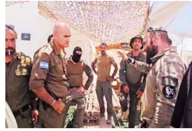
A heated argument erupts between soldiers at the Sde Teiman detention facility in southern Israel after Military Police investigators arrived to detain suspects for questioning.

Tel Aviv (AP) The Israeli military said Monday it was holding nine soldiers for questioning following allegations of "substantial abuse" of a detainee at a shadowy facility where Israel has held Palestinian prisoners throughout the war in Gaza. The military did not disclose additional details surrounding the alleged abuse, saying only that its top legal official had launched a probe. An investigation by The Associated Press and reports by rights groups have exposed abysmal conditions at the Sde Teiman facility, the country's largest detention centre. A report by the United Nations agency for Palestinian refugees, UNRWA, earlier this year said that detainees alleged they were subjected to ill-treatment and abuse while in Israeli custody, without specifying the facility.