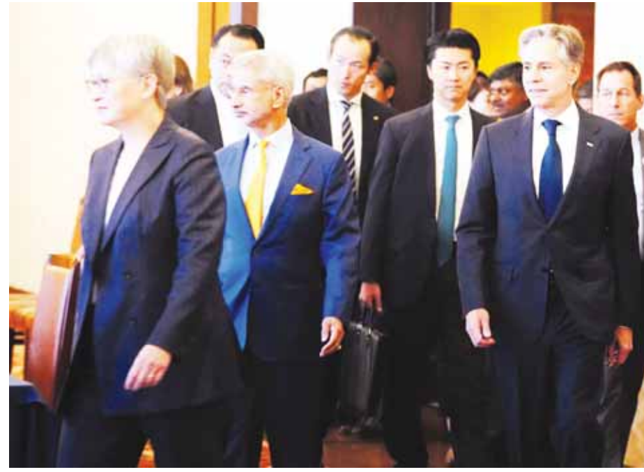
Australian Foreign Minister Penny Wong, left, Indian External Affairs Minister Subrahmanya Jaishankar, second left, and U.S. Secretary of State Antony Blinken, second right, arrive for the Quad Ministerial Meeting, at the Foreign Ministry's Iikura guesthouse in Tokyo, Monday.