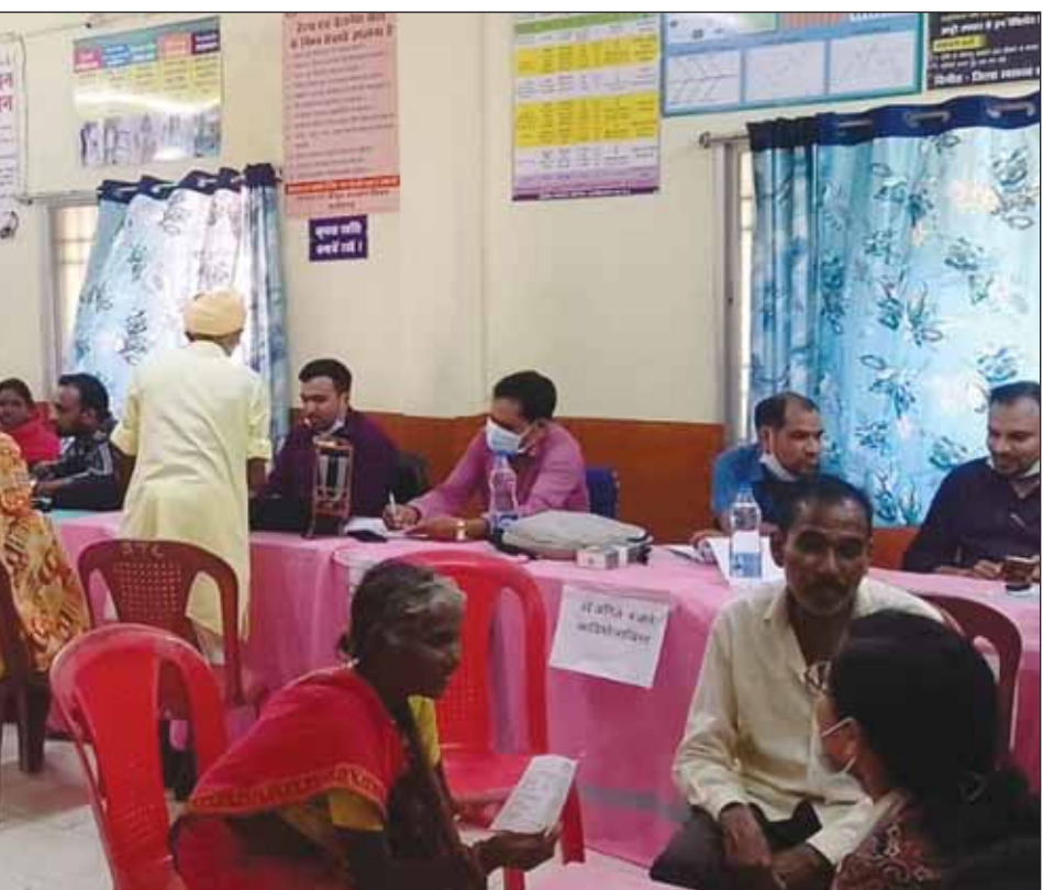
A view of a special health camp held at the forest village Chilfi Ghati in Chhattisgarh to benefit the tribal population.

Citing the mob lynching and setting ablaze the entire family of a Baiga tribal, the Congress leader said tribals and ordinary people were not secure in the state.