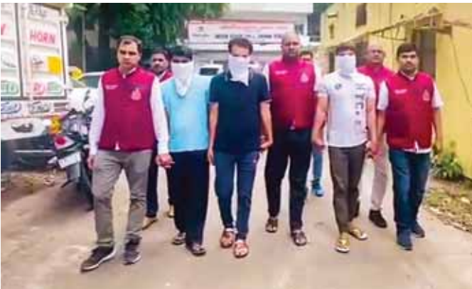
Delhi Police Crime Branch personnel with men arrested for their alleged involvement in an organ transplant racket exposed by them, in New Delhi, on Tuesday. The Crime Branch arrested seven people, including a doctor

India's emergence as a global medical tourism hub in recent times has been marred by several cases of organ theft, raising concerns among agencies and Ministries about blow to the country's reputation. To combat this menace, the Centre recently issued advisories for international patients. India's growing popularity as a premier medical tourism destination is evident from the influx of approximately 2 million patients from 78 countries each year, seeking medical, wellness, and IVF treatment. This booming