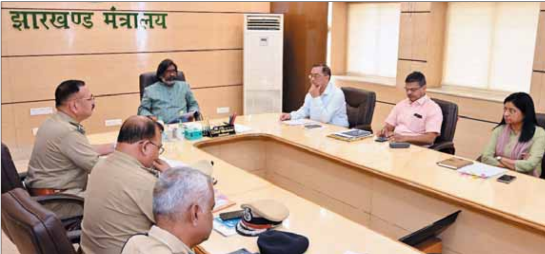
CM Hemant Soren holds a high level meeting with senior officials in the Jharkhand Ministry in Ranchi on Tuesday.

Chief Minister Hemant Soren today reviewed the appointment process for the vacant posts of various departments of the state government in the presence of officials at the Jharkhand Ministry, the updated work progress of the Kantatoli flyover under construction in Ranchi and the flyover construction work being built from Sirmatoli to Mecon Chowk. Soren directed the officials to ensure that all such appointments which are in process are completed soon. He said that due to lack of human resources in government offices, the departmental efficiency as well as the schemes and projects run by the government in public interest are adversely affected, hence all the appointments should be completed within the stipulated time frame. The CM told the officials that by the end of September 2024, the target is to appoint about 30 thousand vacant posts in various government departments of the state government, our gov-