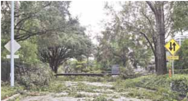
A detail of down trees on Memorial drive and Wescot street in Houston, on Monday, after Beryl came ashore in Texas as a hurricane and dumped heavy rains downtown.

At least four people were killed, and nearly three million homes and businesses were left without power as powerful tropical storm Beryl, which brought damaging winds and floods, slammed into Texas early on Monday. Beryl brought Schools, businesses, offices, and financial institutions to a halt soon after it made landfall near Matagorda as a category 1 hurricane, the National Hurricane Centre said on Monday evening. Flooding, rains and tornadoes were possible across portions of eastern Texas, Western Louisiana. Two people were killed after trees fell on homes, and a civilian employee of the Houston Police Department was killed when he was trapped in flood waters. One more person was reported dead in a fire incident.