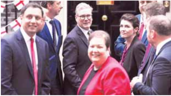
Britain's Prime Minister Keir Starmer, background center, poses for a photograph with the new intake of Scottish Labour Members of Parliament, outside no 10 Downing Street, in London on Tuesday.

Hundreds of newly elected lawmakers trooped excitedly into Parliament on Tuesday after the UK's transformative election brought a Labour government to power. The halls of the labyrinthine building echoed with excited chatter as the 650 members of the House of Commons gathered — 335 of them arriving for the first time. That compares to 140 new lawmakers after the last election in 2019. The seat of British democracy took on a back-to-school feel, from the rows of lockers temporarily installed in wood-paneled corridors to the staff holding “Ask Me” signs ready to help bewildered newcomers. The new House of Commons includes the largest number of women ever elected — 263, some 40 per cent of the total —