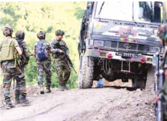
Indian Army personnel during a counter-terror operation following a terrorist attack on an Army convoy, in Kathua district, on Tuesday