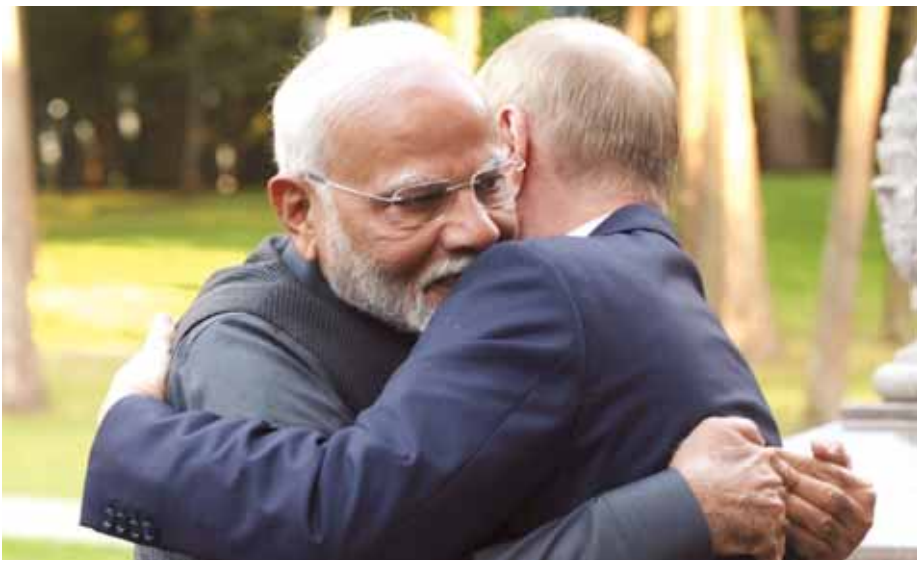
Indian Prime Minister Narendra Modi, left, and Russian President Vladimir Putin in embrace during an informal meeting at Novo-Ogaryovo residence, outside Moscow, Russia, on Monday

India and Russia on Tuesday reviewed the entire spectrum of their bilateral ties and ongoing Ukraine conflict with Prime Minister Narendra Modi saying peace dialogue does not succeed amidst guns and bullets. He also said no solution is possible in the battlefield. Modi said stronger ties between India and Russia will greatly benefit the people. He was officially conferred Russia's most prestigious civilian honour — the Order of St Andrew the Apostle — by President Putin for exceptional services in promoting bilateral ties between the two countries. On his bilateral talks with Putin, Modi in his opening remarks said he conveyed to Russia President and assured the world community that India is on the side of peace and was ready to contribute in ending the conflict in Ukraine. “For a bright future for the new generation, peace is most essential...Peace talks do not succeed amidst bombs, guns and bullets,” he said. The Prime Minister also referred to his informal meeting with Putin on Monday and said listening to the Russian president lent