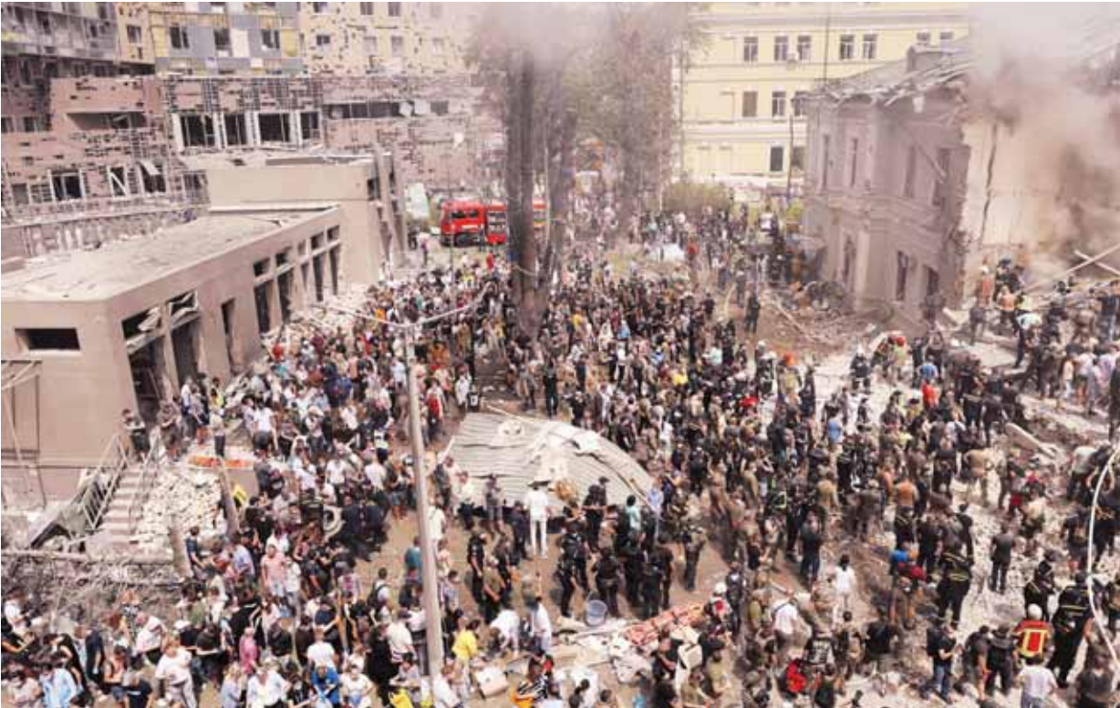
Rescuers and volunteers clean up the rubble and search for victims after a Russian missile hit the Okhmatdyt hospital in Kyiv, Ukraine, on Monday

the capital. Russia denied responsibility for the hospital strike, insisting it doesn't attack civilian targets in Ukraine despite abundant evidence to the contrary, including Associated Press reporting. Kremlin spokesman Dmitry Peskov on Tuesday repeated that position, pointing to a Russian Defense Ministry statement that blamed a Ukrainian air defense missile for partially destroying the hospital. The Russian onslaught Monday came on the eve of a NATO summit in Washington where alliance countries are expected to pledge new military and economic support for Ukraine. Earlier on Monday, Russian missiles blasted cities across Ukraine on Monday, damaging the country's largest childrens hospital and other buildings in a fierce assault that interrupted heart surgeries and forced young cancer patients to take their treatments outdoors. At least 31 people were killed, officials said. The daytime barrage targeted five Ukrainian cities