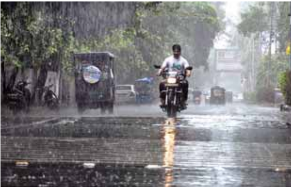
A commuter gets drenched during rains in New Delhi on Tuesday

The Public Works Department (PWD) said until afternoon, it received 22 calls regarding waterlogging and around three to four complaints of uprooted trees. The Municipal Corporation of Delhi (MCD) received 11 calls regarding waterlogging and seven complaints of uprooted trees. The India Meteorological Department (IMD) had earlier predicted that moderate rainfall accompanied by thunderstorms and lightning