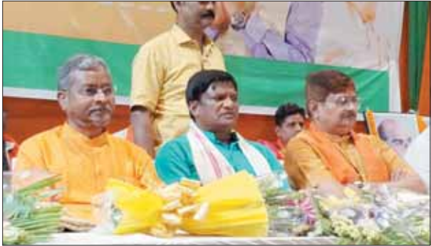
State BJP President Babulal Marandi addresses party workers during Vijay Sankalp Sabha in Dhanbad on Tuesday.

BJP state president and former chief minister Babulal Marandi addressed the worker felicitation and assembly level Vijay Sankalp Sabha in Dhanbad today. He honoured the booth level workers by giving them clothes. He said that the workers fight for the party's ideology at the grassroots level, struggle is the work. They communicate with the public, make the daily programs successful. He said that such workers are the capital of the party. It is the duty of the leadership to increase their respect. He said that today, Modi government for the third time, this great and historic achievement is the result of the tireless hard work of the workers. Marandi said that now the workers have only one goal to free the state from the corrupt, useless thugbandhan government. He said that this is a deceptive government which got votes by promising employment and unem-