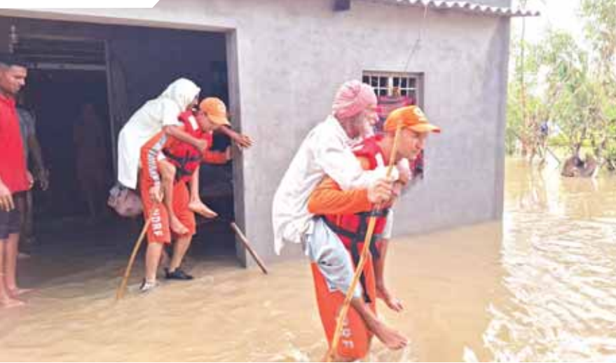
NDRF personnel rescue trapped people from the flooded areas in Tanakpur