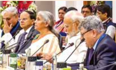
Prime Minister Narendra Modi, Union Finance Minister Nirmala Sitharaman and others during a meeting with economists at NITI Aayog, in New Delhi on Thursday

existing storm water drain, coordinated with NDRF, MCD, SDM Narela, DJB, public representatives and local residents for providing relief from this situation." Resources such as JCB, Dewatering pump, drinking water tanker and mobile toilet have also been deployed at the location by DDA. Flow of water from Sonipat has reduced and authorities have requested Haryana to close gates on the canal to control the flow, officials said. The canal originates from the Yamuna river in Munak in Haryana's Karnal district. Delhi Minister Atishi visited the site and said, "We are at the entry point at the Munak Canal in Bawana. Last night between 12 am and 2 am, there was a breach in the embankment, the water entered the adjacent areas. This canal is maintained by Haryana Irrigation Dept, their team is here, the DJB team is here, the repair work is being done."