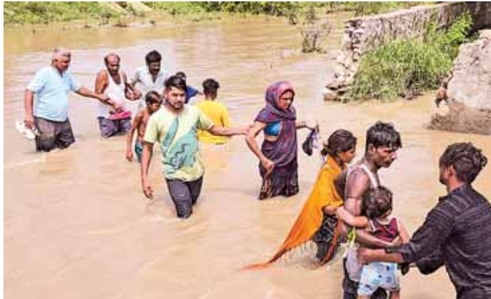
People wade through floodwater after a breach in one of the sub-branches of Munak Canal in New Delhi on Thursday