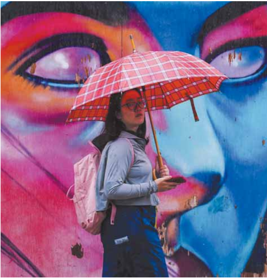
People make their way through the rain as the remnants of Hurricane Beryl hit Ottawa, Ontario

in another economy," Shambaugh said. "The best outcome, though, would be for China to acknowledge the growing concerns among its major trading partners and work with us to address them. We will take defensive action if needed, but we would prefer for China to take action itself to address the macroeconomic and structural forces that are generating the potential for a second 'China shock' for its major trading partners," he said. "China could boost consumption by strengthening its safety net, increasing household incomes and reforming its internal migration rules. It could better support services, not just manufacturing. It could reduce harmful and wasteful subsidies. These would all be in China's interest and reduce tensions," the Treasury official said.