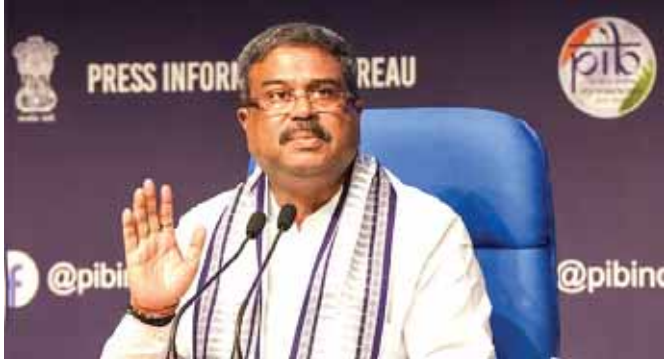
Education Minister Dharmendra Pradhan