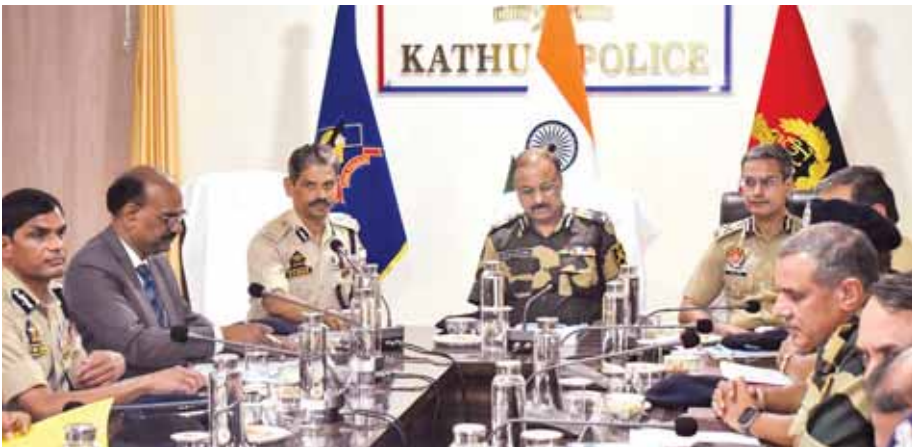
An Inter-State Coordination Conference between BSF, J&K Police, Central Agencies and the Punjab Police being held to focus on enhancing border security and synergy between the two State Police Forces and the Border Guarding Force, in Kathua, Jammu and Kashmir on Thursday