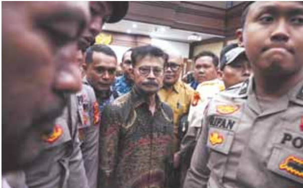
Former Agriculture Minister Syahrul Yasin Limpo is escorted by cops after his sentencing at the Corruption Court in Jakarta, Indonesia, on Thursday