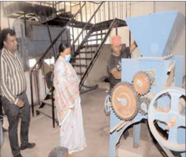
Agriculture Minister Deepika Pandey on Thursday visited the lac factory of Jharkhand State Cooperative Lac Purchase-Sale and Withdrawal Union Limited (JHASCOLAMPF) located at Sidraul, Namkom.

On this occasion, Registrar, Cooperative Societies, Jharkhand, Managing Director, JSCCLAMP, Executive Engineer, Building Construction Corporation, Assistant Engineer, ICDP Cell and other officials were present.