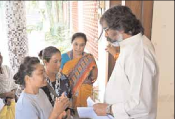
Chief Minister Hemant Soren meets common people at his official residence in Ranchi on Thursday.

The Chief Minister said that his government is continuously working to provide basic and fundamental facilities to the people at their doorsteps. We are taking the schemes to them with commitment so that qualitative improvement and positive