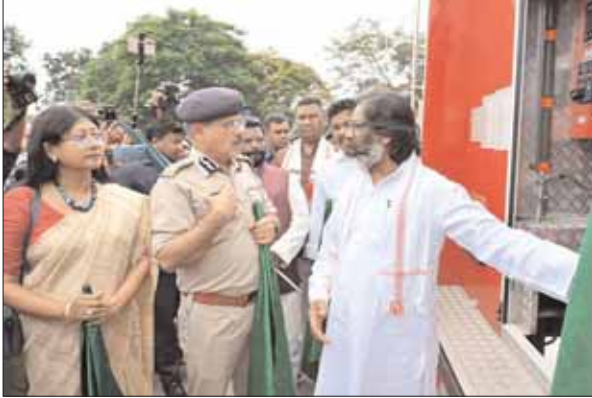
Chief Minister Hemant Soren after the flagging of 13 Fir Bridged vehicles, during a programme in Ranchi on Friday.

Chief Minister Hemant Soren today came down heavily against privatisation of public sector entities and industrial policies of the Central government. Addressing a gathering during the teachers' appointment letter distribution programme at Dhurwa in the Capital city on Friday the CM dared the Centre to hand over the Heavy Engineering Corporation to the State Government so that it can be revived. “HEC is the industry which is called the mother of industries. But look at its condition today. When this industry was established, 25 to 30 thousand people used to work there. But today's situation is that there may not be even 10-11 thousand people here. And, how much salary do they get in a month. Whose responsibility is it to save this industry? It is not the state government's job to save this industry. It is beyond our capability. But yes, if the Central government hands it over to the state government, then the way 32 thousand people work in HEC, the same number of people will be seen employed again,” said the CM. “All the airports have been sold, railways have been sold, ports have been sold. The condition of the economy is such that today our rupee will now stand on its head in comparison to the dollar. It is not me, it is a statement of a scholar. Chanakya had said that the country whose king is a businessman, the people of that