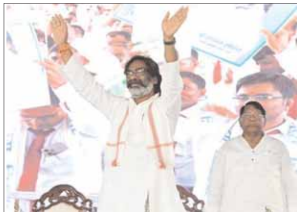
Chief Minister Hemant Soren during the distribution of the appointment letters to 1500 newly appointed PGT teachers, during a programme at Prabhat Tara grount in Ranchi on Friday.

vide quality education to the coming generation here, so that our coming generation can give excellent results. He told the teachers who received the appointment letter that you should prepare yourself in such a way that you are recognized as an excellent teacher. The CM told the newly appointed teachers that in a state like Jharkhand, tribal and local languages are of great importance, so to establish yourself as a better teacher, it is very important for you to know the local languages. Not only this, communicate with children and their parents in local languages, which will develop a feeling of affection, which will be effective in keeping the language, culture and tradition of this state intact and moving forward. Soren said that our government has taken many such decisions in the last four and a half years, which are proving to be a milestone for this state today. Jharkhand is the first state in the country which is giving full expenses of higher education abroad to the children of tribal, Dalit minority and backward class-