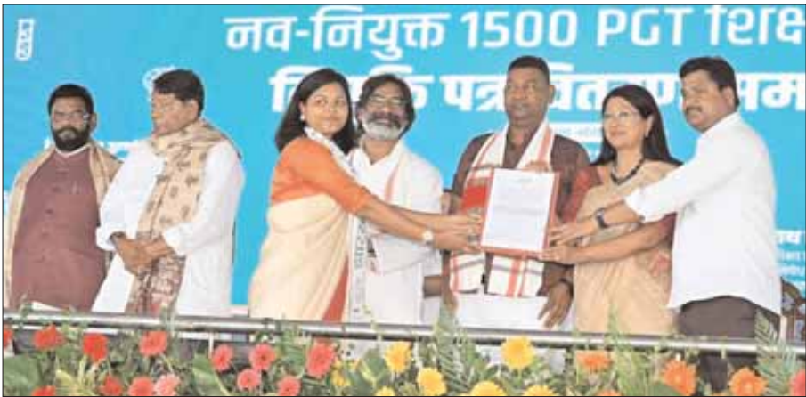
Chief Minister Hemant Soren distributing appointment letters among 1500 newly appointed PGT teachers, during a programme at Prabhat Tara grount in Ranchi on Friday.

Faces of 1500 newly appointed teachers lit up with happiness after they received appointment letters from Chief Minister Hemant Soren today. The occasion was the appointment letter distribution ceremony among postgraduate trained teachers. The CM told the teachers that they have a huge responsibility to build the future of the children. “I am confident that you will contribute to the all-round development of the state by discharging your responsibilities with loyalty and honesty,” he said on the occasion. The CM reiterated his resolve to make the youth self-dependent. He said that this is not the first time that appointment letters are being distributed among the youth here. Till now thousands of youth have been given government jobs. And this process continues. At the same time, more than 60 thousand youth have been given jobs in private institutions and companies. Financial help is being provided to the youth who want to do self-employment. He