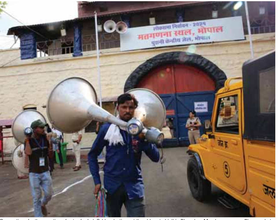
Preparations for the counting of votes for Lok Sabha elections at the old central jail in Bhopal on Monday.