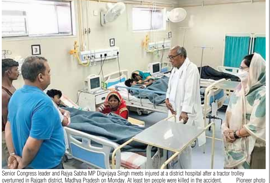
Senior Congress leader and Rajya Sabha MP Digvijaya Singh meets injured at a district hospital after a tractor trolley overturned in Rajgarh district, Madhya Pradesh on Monday. At least ten people were killed in the accident.

Bhopal: Bhopal crime branch has arrested three absconding accused carrying a reward of Rs 10000 in the case of attempt to murder, vandalism and wounding with a sword.