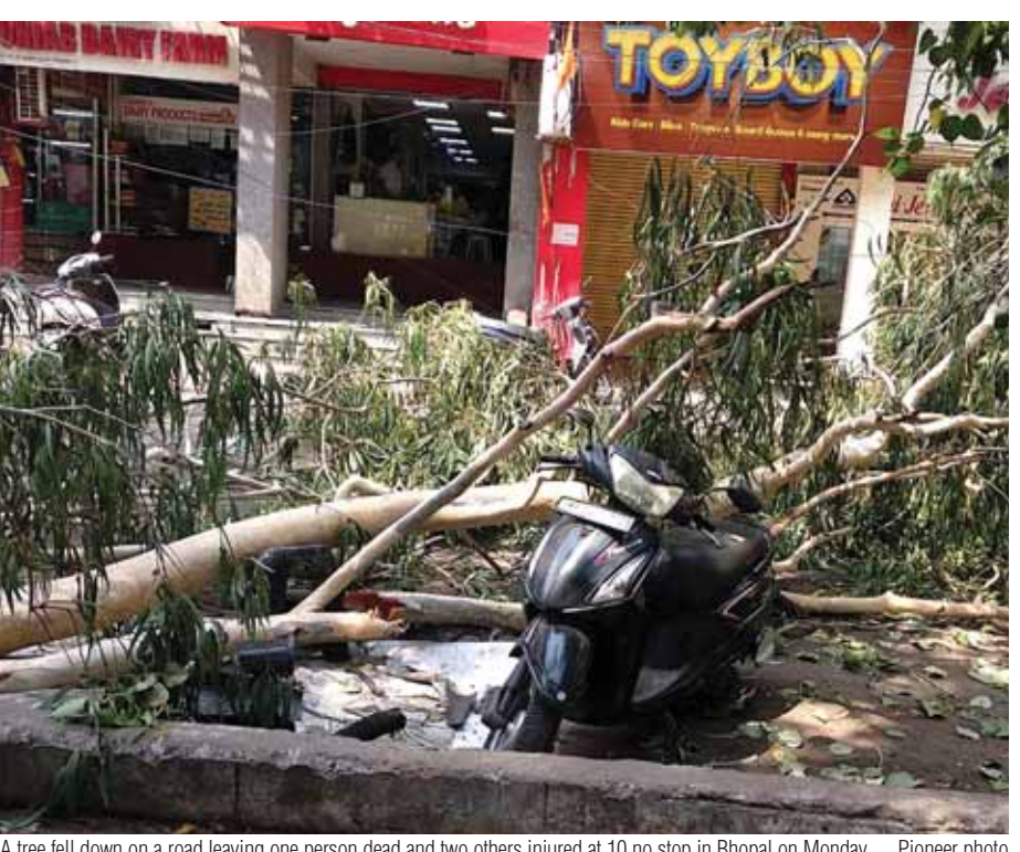
A tree fell down on a road leaving one person dead and two others injured at 10 no stop in Bhopal on Monday.