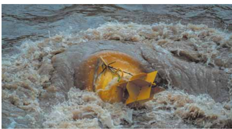
A buoy is pictured as the river Neckar has left its banks in Heidelberg, Germany on Monday. Big parts of southern Germany have been flooded after heavy rainfalls during the last days. In background the castle.

The floods caused extensive transport disruption, with long-distance rail routes to Munich from the north and west out of action on Monday. Scholz visited Reichertshofen, north of Munich, inspecting a sandbagged river bank and meeting regional officials including Markus Söder, Bavaria's governor. Söder said that the situation "remains critical and tense," with water receding in some places but new flooding and evacuations elsewhere. He noted that water levels are expected to rise in the city of Regensburg and further down the Danube. Scholz said that "this is not just one event like there have been for centuries," and that a succession of floods in recent times shows "we cannot neglect the task of halting man-made climate change".