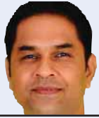
RAJYOGI BRAHMAKUMAR NIKUNJ JI

Spiritual resilience through meditation can help reform criminal behaviour