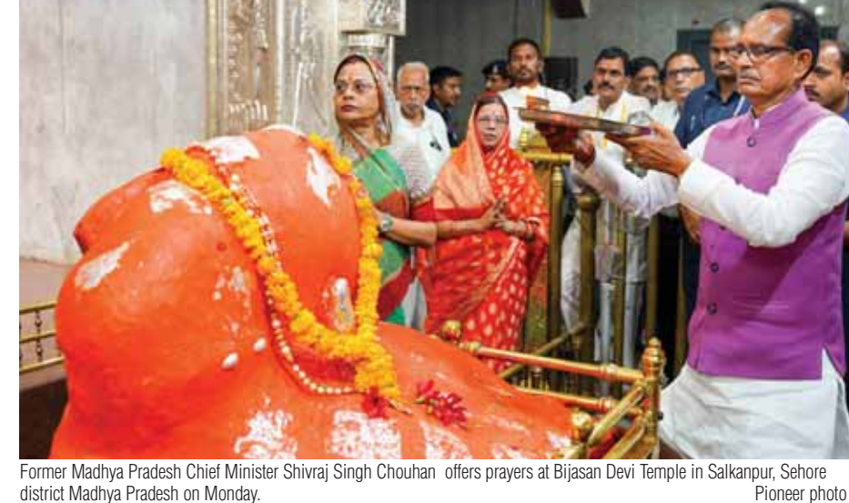
Former Madhya Pradesh Chief Minister Shivraj Singh Chouhan offers prayers at Bijasan Devi Temple in Salkanpur, Sehore district Madhya Pradesh on Monday.