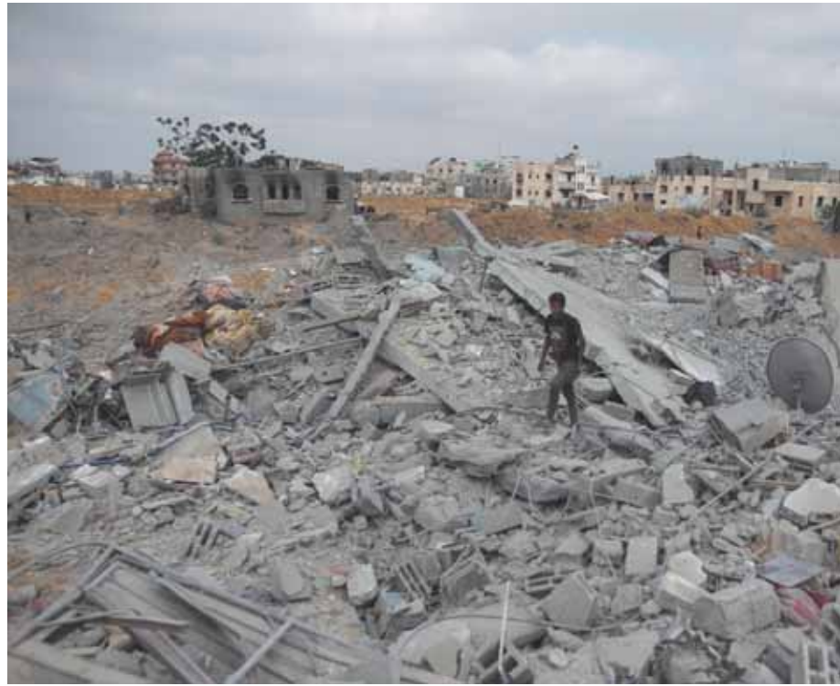
Palestinians look at the destruction after an Israeli airstrike in Khan Younis, Gaza Strip, Monday.

started more than a decade ago, but have not succeeded despite at times looking "promising". The Maldivian cabinet on Sunday also decided to appoint a special presidential envoy to identify the areas in which Palestine requires support from the Maldives and organise fundraising events to assist Palestinians through the UN Relief and Works Agency for Palestine Refugees in the Near East. The Gaza conflict began on October 7 after Hamas initiated an attack on Israel, killing over 800 and capturing 240 hostages, according to Israeli authorities. Israel launched a massive counter-offensive against the Palestinian militant group that has ruled Gaza since 2007. More than 36,000 people, including women and children, have been killed in Gaza in Israel's action, according to the Hamas-run health ministry in Gaza.