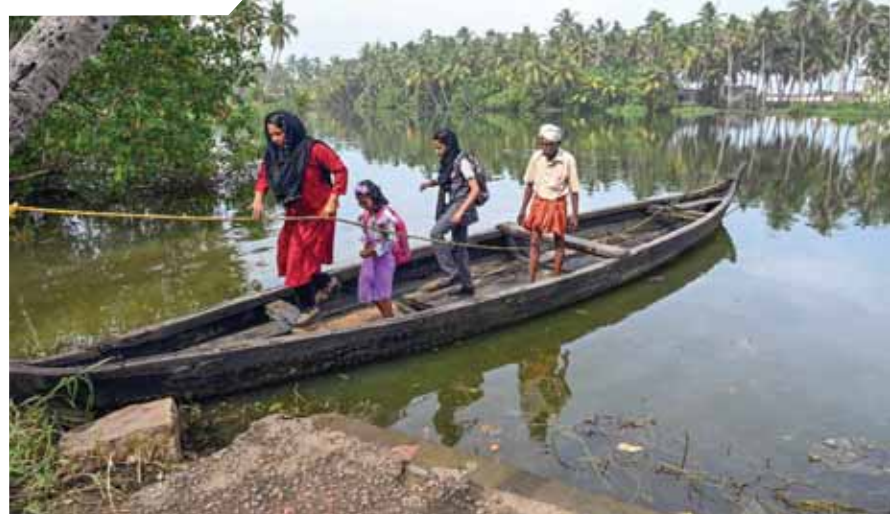
Children travel via a boat to reach their school that reopened after the summer vacation, in Thiruvananthapuram