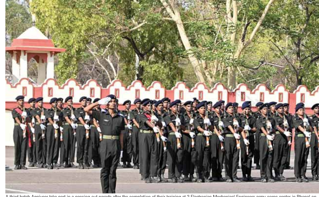
A third batch Agniveer take part in a passing out parade after the completion of their training at 3 Electronics Mechanical Engineers army corps center in Bhopal on Monday. As many as 816 Agniveers participate in the passing out parade.