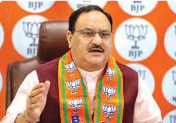
PIONEER NEWS SERVICE ■ NEW DELHI

With just a day before the counting of votes, BJP top leaders met at party's president JP Nadda's residence on Monday to discuss the party's performance in the Lok Sabha polls and its preparation for the counting of votes scheduled to take place on June 4. The meeting, presided over by Nadda, was also learnt to have taken stock of the prevailing political situation following the exit polls predicting a big win for the BJP-led NDA, and the Opposition INDIA Bloc's series of meetings rejecting the forecast. "A meeting was held to discuss and review the elections conducted in seven phases and also to discuss the counting of votes which is to take place tomorrow. The meeting was presided over by party national president Nadda, BJP national general secretary Vinod Tawde told reporters here after the meeting. He said the meeting discussed the voting pattern observed during all seven phases of polls as to how polling took place. "This was also reviewed," he added. Tawde said the meeting,