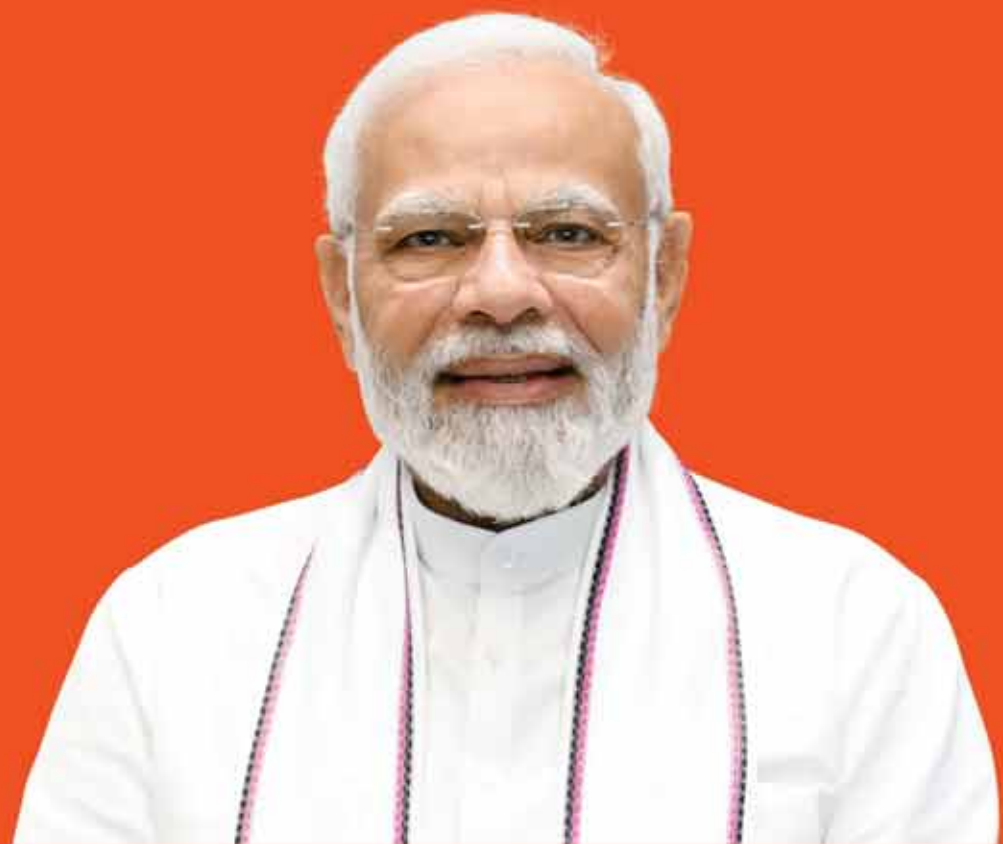
नरेन्द्र मोदी, प्रधानमंत्री