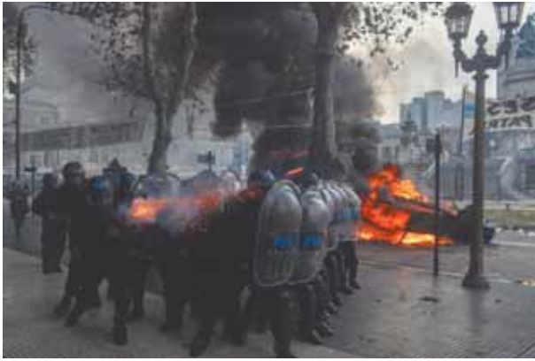
Police fire tear gas at anti-government protesters outside Congress, where lawmakers debate a reform bill promoted by Argentine President Javier Milei in Buenos Aires, Argentina, Wednesday.

In a reflection of the fierce backlash to the legislation and deep polarisation gripping Argentina's Congress, Vice President and head of the Senate Victoria Villarruel cast the tiebreaking vote in favour