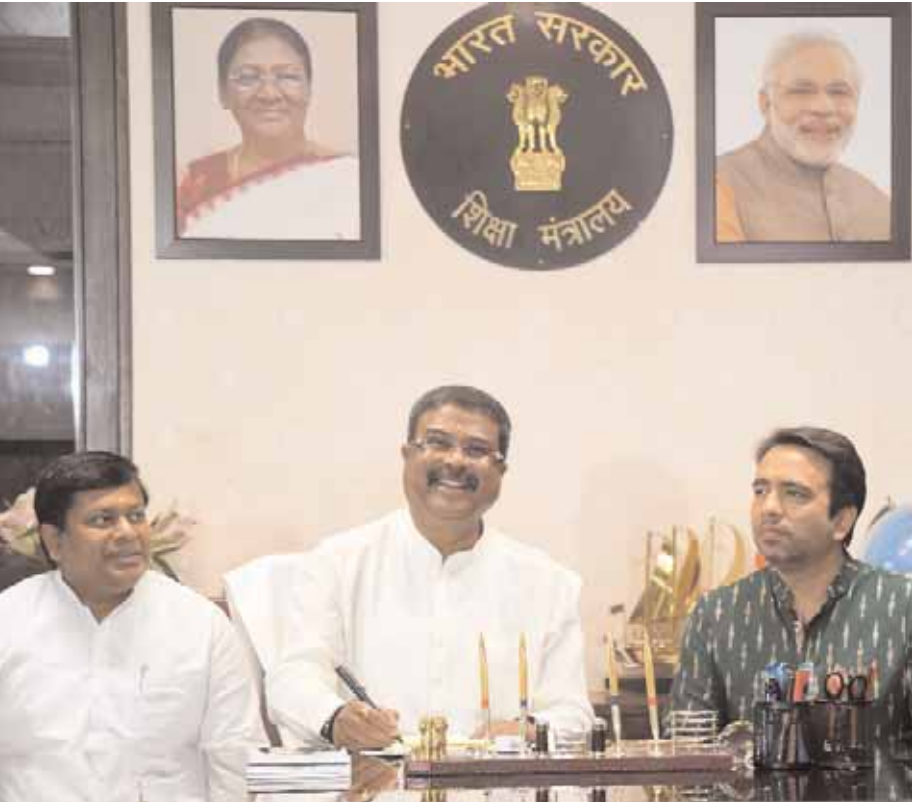
Union Minister for Education Dharmendra Pradhan assumes charge of his office in Shastri Bhawan, New Delhi, on Thursday. Ministers of State for Education Jayant Chaudhary, Sukanta Majumdar also assumed the charge.

Delhi's efforts to address global challenges. Prime Minister Modi will be accompanied by a high-level delegation that is likely to include External Affairs Minister S Jaishankar, Foreign Secretary Vinay Kwatra and National Security Advisor(NSA) Ajit Doval, it was learnt. The prime minister is set to hold a number of bilateral meetings including with Italian Prime Minister Giorgia Meloni. Modi had attended the previous G7 summit in Hiroshima in May last year. On the sidelines of the summit, he had held talks with Zelenskyy and a number of other leaders. The G7 comprises the US, the UK, France, Italy, Germany, Canada and Japan. Italy is holding the current presidency of the G7 (Group of Seven) and is hosting the summit in that capacity.