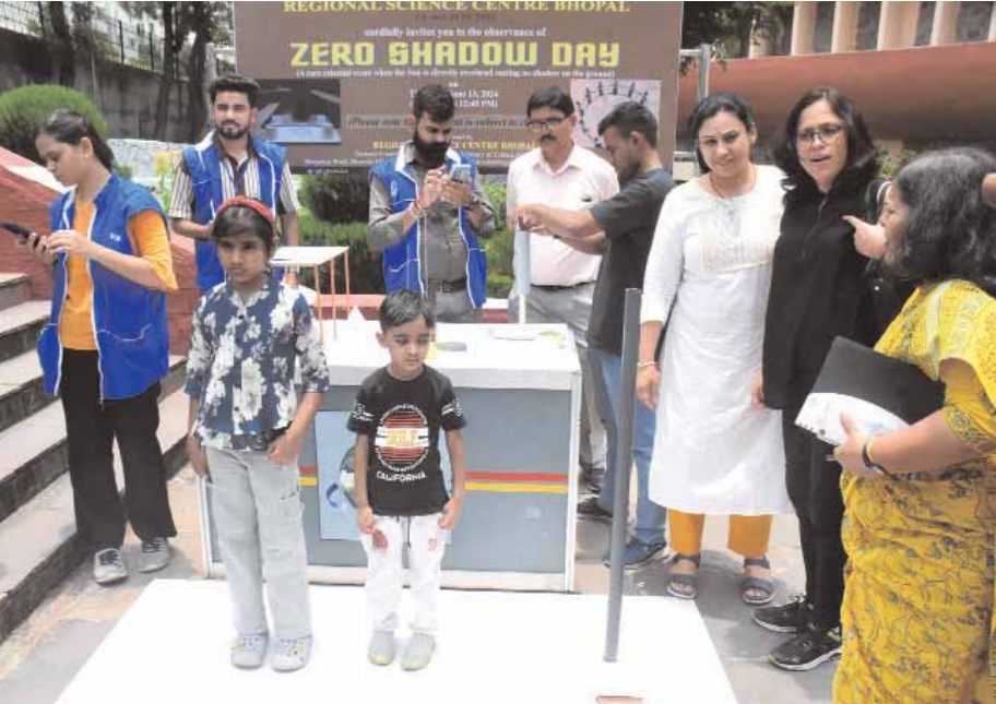
People stand in sunlight as they observe Zero Shadow Day at Regional Science Center in Bhopal on Thursday.