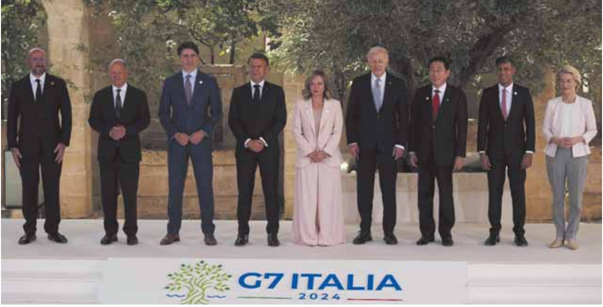
From left: European Council President Charles Michel, German Chancellor Olaf Scholz, Canada's Prime Minister Justin Trudeau, French president Emmanuel Macron, Italian Premier Giorgia Meloni, U.S. President Joe Biden, Japan's Prime Minister Fumio Kishida, British Prime Minister Rishi Sunak and European Commission President Ursula von der Leyen pose for a family photo at a G7 world leaders summit at Borgo Egnazia, southern Italy, Thursday.

As with any G7, an assortment of anti-global, anti-war and climate activists are staging protests around the summit venue, but far from where the leaders are meeting. One group is staging a "dinner for the poor" on Friday night calling for "peace, the rights of peoples and against the Big 7 who claim to decide the destiny of the world and our planet".