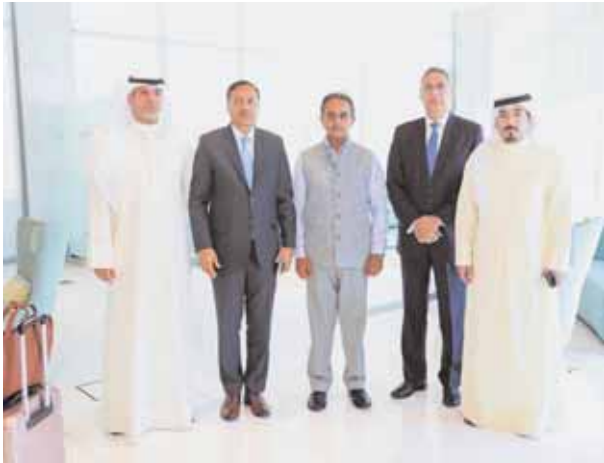
Minister of State for External Affairs Kirti Vardhan Singh on his arrival in Kuwait

"In an unfortunate and tragic fire incident earlier today in a Labour housing facility in Mangaf area of Kuwait, around 40 Indians are understood to