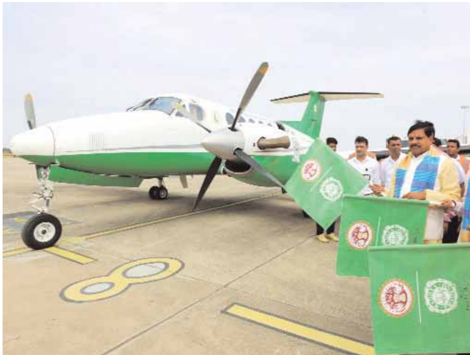
Madhya Pradesh Chief Minister Mohan Yadav flags off during the inauguration of "PM Shri Paryatan Vayu Seva" with the aim of improving air connectivity for tourist destinations in the State, at Raja Bhoj airport in Bhopal on Thursday.

increased while using updated technology to monitor the mineral wealth coming out of the state. Drones and satellite surveys should be used to monitor whether mining activities take place in the designated area allotted for mining. Businessmen should be encouraged in mineral business, a policy should be made to maximise mineral-based industries. Dr. Yadav said that forest resources-based industries should be encouraged. The target, current status, and upcoming action plans for revenue receipts from VAT, GST, stamp registration, mining, excise, revenue, mineral, transport, energy, forest, and irrigation sectors were discussed in detail.