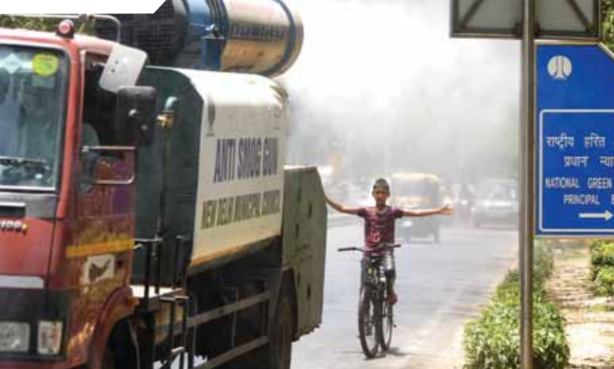
A boy follows the cooling water mist released by an anti-smog gun, in New Delhi