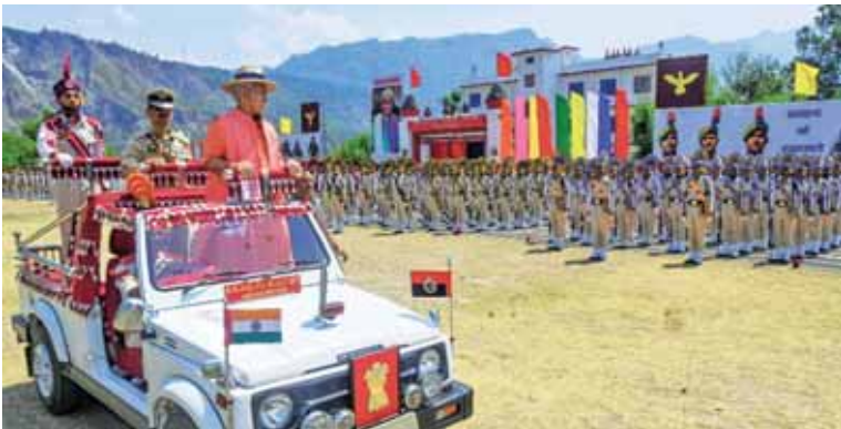
Jammu and Kashmir Lieutenant Governor Manoj Sinha reviews the Passing out Parade of Jammu and Kashmir Police's 16th BRTC Batch at the Subsidiary Police Training Centre in Reasi district on Sunday

Minister said under the leadership of Prime Minister Narendra Modi, India's Disaster Management is moving forward with a 'Zero Casualty Approach'. The Minister also highlighted the importance of upgrading the forecast system for river water levels. This included modernising the equipment used in flood forecasting to improve the accuracy and reliability of flood predictions, thereby facilitating better preparedness and response. Shah also reviewed preparations to deal with Glacial Lake Outburst Floods, which have caused significant damage in regions like Sikkim and Uttarakhand in the past few years and are now becoming a recurring feature.