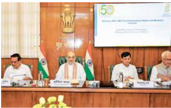
Union Home Minister Amit Shah chairs a high-level meeting to review preparedness to deal with floods that affect various parts of the country during the monsoon, in New Delhi, on Sunday. Union Minister of Jal Shakti C R Paatil and Union MoS for Home Affairs Nityanand Rai are also seen

During the review meeting on flood management with officials from the IMD, CWC, NDMA and the National Disaster Response Force, the Minister emphasised the integration of natural drainage systems into infrastructure designs, better handling of Glacial Lake Outburst Floods (GLOF), and the enhancement of community awareness and preparedness programmes. Emphasising the role of advanced technology, Shah advocated for the optimum use of satellite imagery from the Indian Space Research Organisation (ISRO). This would aid in effective flood and water management