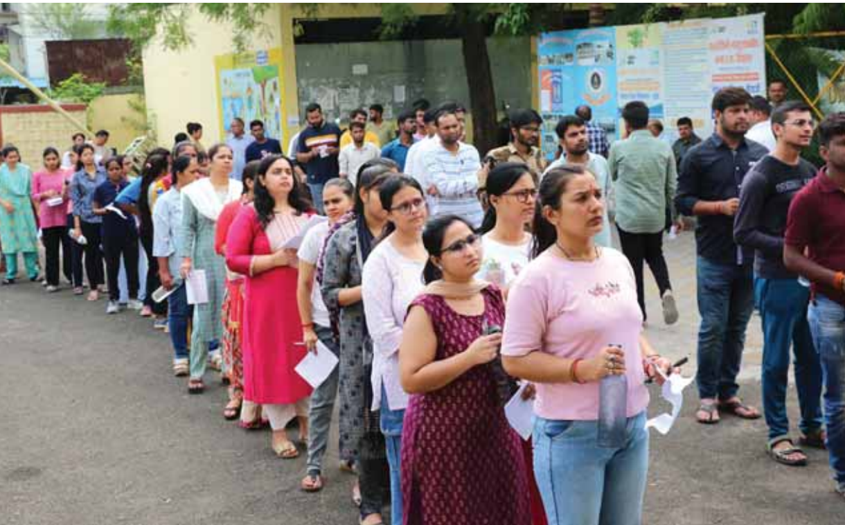
Aspirants wait outside an examination center as they appear in the Madhya Pradesh Public Service Commission (MPPSC) Preliminary Examination in Bhopal on Sunday.