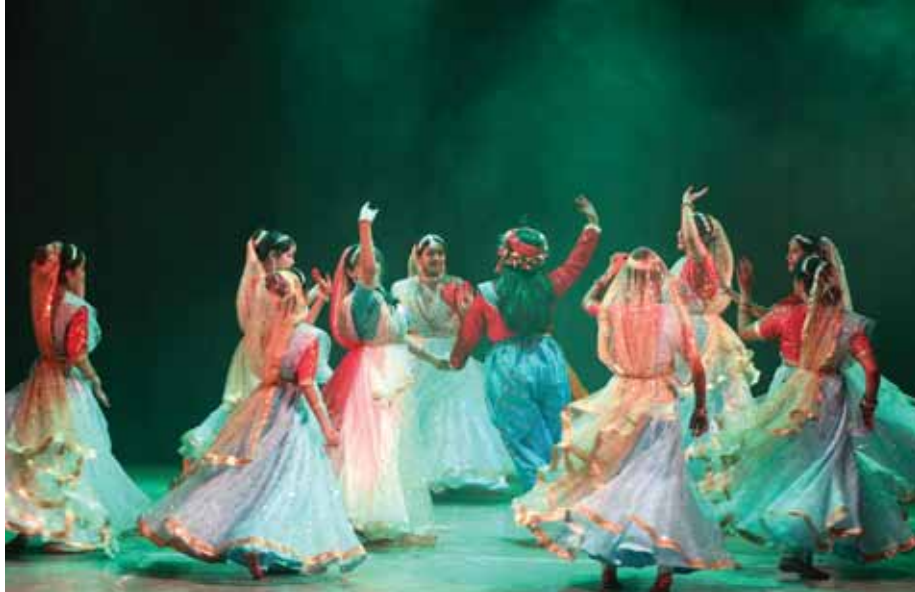
Artists perform a dance drama 'Ritu Prem Rang Manmohana' during a cultural series programme Nrityotsava-9 organised by Nritya Manjari Kala Peeth at Rang Sri Little Ballet Troupe theater in Bhopal on Sunday.