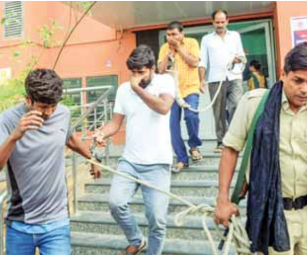
Economic Offences Unit (EOU) personnel leave with the accused arrested in connection with the alleged irregularities in NEET-UG exams 2024 case, after the latter's medical examination at LNJP hospital, in Patna, on Sunday