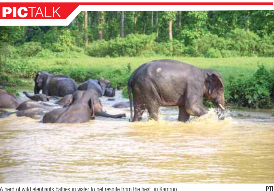
A herd of wild elephants bathes in water to get respite from the heat, in Kamrup

India holds a special place in Bangladesh's history, particularly owing to the 1971 Liberation War wherein India played a key role. However, relations between the nations became tense during military rule in the mid-1970s, marred by anti-India sentiment. But the shared history has helped forge a strong bond, with Modi's tenure since 2014 giving a new fillip to bilateral ties. Earlier, a significant shift occurred in 1996, when Hasina took over as the Prime Minister for the first time; since then, bilateral relations have steadily improved. Since 2019, the two leaders have met on 10 occasions, ushering in an era of remarkable transformation and strengthening bonds. Prime Minister Hasina, who began her fourth consecutive term in January 2024, joined six other world leaders at Modi's swearing-in ceremony on June 9, 2024. However, challenges persist, such as border management, illegal migration, the National Register of Citizens, Rohingya and river water sharing, necessitating ongoing dialogue. Bangladesh has established an island for the persecuted Rohingyas and seeks India's help in persuading Myanmar to repatriate the displaced minorities. The Modi-Hasina partnership has the potential to further cement India-Bangladesh relations, navigating these challenges and leveraging their shared vision for mutual prosperity.