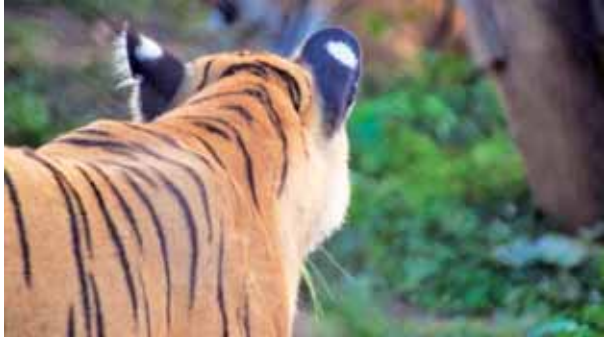
A representational image

owners of the cows which were killed by the big tiger. Wayanad, a high range district situated on the periphery of the Western Ghats forests, is no stranger to wild animals. Elephants, tigers, cheetahs, leopards and deers make frequent visits to the human settlements in search of food and water as the reserve forests are short of drinking water and food. The big cats target domestic animals like cows, sheep and bulls while the elephants prefer to have banana plants, jackfruits and mangoes in addition to their favourite