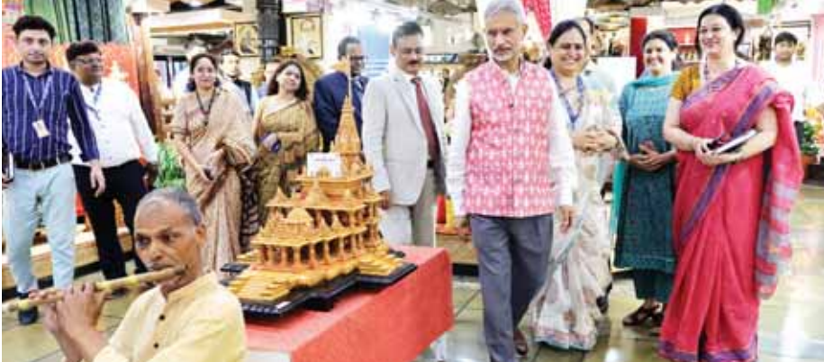
During his visit to the Cottage (Janpath) External Affairs Minister S Jaishankar praised the delightful array of artisanal products. Managing Director of The Central Cottage Industries Corporation of India Ltd Manoj Lal showcased the impressive offerings.