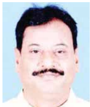
the High Court.

PNS ■ KHORDHA The Khordha Additional District Sessions Judge-II on Friday rejected the bail plea of Chilika MLA and Khordha BJP MLA