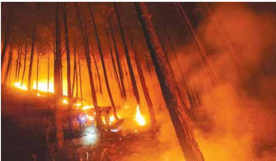
Smoke rises from a forest fire in Uttarakashi district

Severe heatwave sweeping Northwest and Central India is increasingly becoming a public health crisis in India with around 71 people succumbing to heat-related illness especially sunstroke since March 1 till date even as Uttarakhand and Jammu region reported forest fires adding complexity to the ongoing situation on Friday.