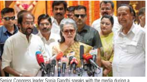
Senior Congress leader Sonia Gandhi speaks with the media during a ceremony to pay tribute to former Tamil Nadu Chief Minister M Karunanidhi on his birth anniversary, at Anna-Kalaignar Arivalayam, in New Delhi on Monday

supporters seeing them as arrangements for celebration of the INDIA Bloc's victory in the Lok Sabha polls despite exit polls suggesting otherwise. Tent-poles have been erected in the grounds of the Congress' 24, Akbar Road headquarters and giant coolers were being set up around its sprawling premises. "We are very hopeful that our results are completely opposite to what the exit polls are showing," the Congress parliamentary party chief added. Sonia Gandhi made the remarks after attending an event held at the DMK office here. She paid tributes to DMK stalwart M Karunanidhi on his 100th