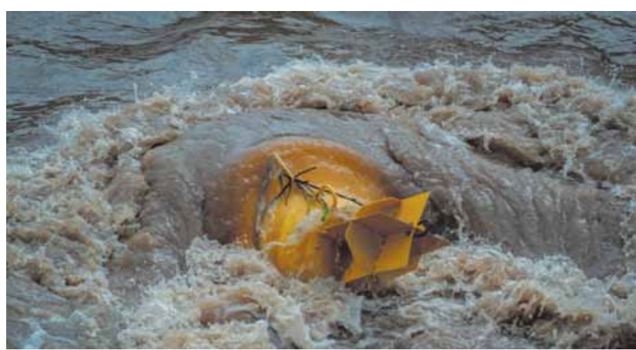
A buoy is pictured as the river Neckar has left its banks in Heidelberg, Germany on Monday. Big parts of southern Germany have been flooded after heavy rainfalls during the last days. In background the castle.

The floods caused extensive transport disruption, with long-distance rail routes to Munich from the north and west out of action on Monday. Scholz visited Reichertshofen, north of Munich, inspecting a sandbagged river bank and meeting regional officials including Markus Söder, Bavaria's governor. Söder said that the situation "remains critical and tense," with water receding in some places but new flooding and evacuations elsewhere. He noted that water levels are expected to rise in the city of Regensburg and further down the Danube. Scholz said that "this is not just one event like there have been for centuries," and that a succession of floods in recent times shows "we cannot neglect the task of halting man-made climate change".