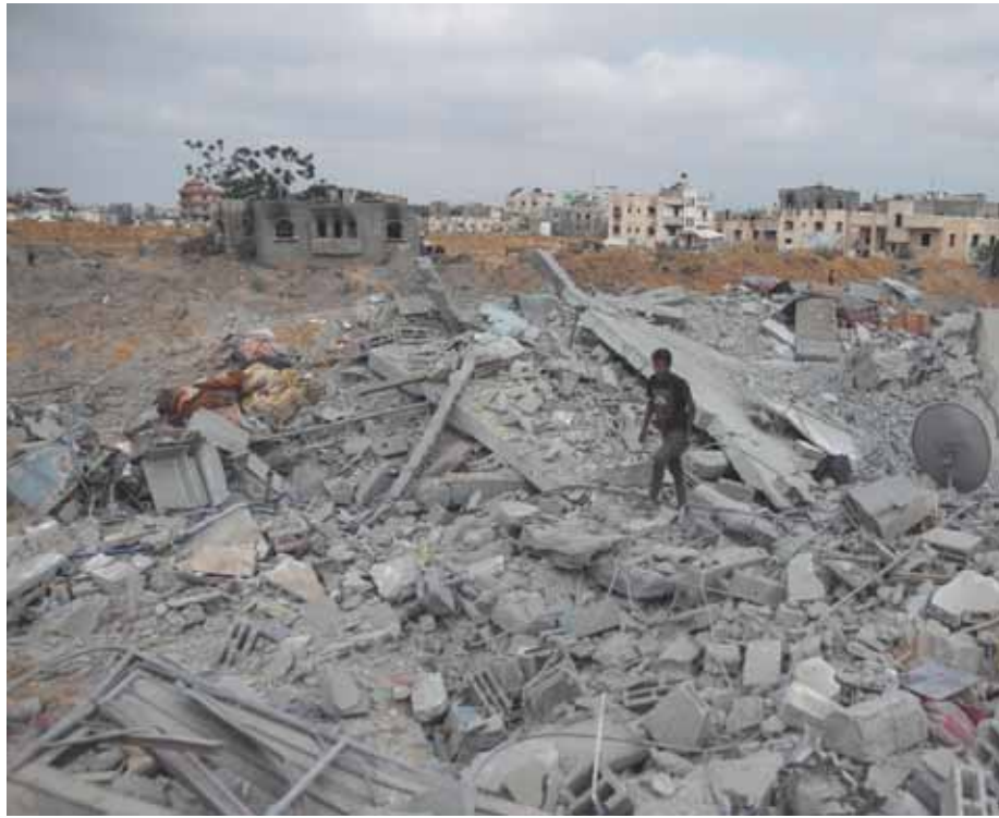
Palestinians look at the destruction after an Israeli airstrike in Khan Younis, Gaza Strip, Monday.

started more than a decade ago, but have not succeeded despite at times looking "promising". The Maldivian cabinet on Sunday also decided to appoint a special presidential envoy to identify the areas in which Palestine requires support from the Maldives and organise fundraising events to assist Palestinians through the UN Relief and Works Agency for Palestine Refugees in the Near East. The Gaza conflict began on October 7 after Hamas initiated an attack on Israel, killing over 800 and capturing 240 hostages, according to Israeli authorities. Israel launched a massive counter-offensive against the Palestinian militant group that has ruled Gaza since 2007. More than 36,000 people, including women and children, have been killed in Gaza in Israel's action, according to the Hamas-run health ministry in Gaza.