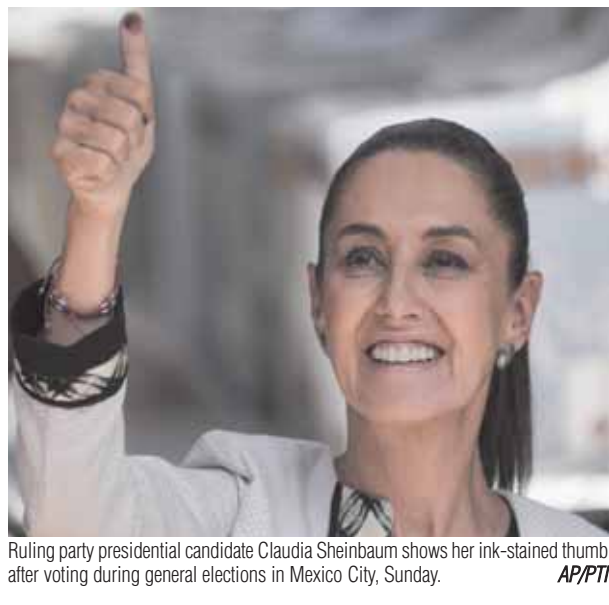
Ruling party presidential candidate Claudia Sheinbaum shows her ink-stained thumb after voting during general elections in Mexico City, Sunday.

Claudia Sheinbaum claimed victory in Mexico's presidential election, becoming the first woman selected for the job by promising to continue the political course set by her populist predecessor despite widespread discontent with persistent cartel violence and disappointing economic performance. The climate scientist and former Mexico City mayor was the favored successor of outgoing President Andrés Manuel López Obrador. But her cool temper offers a sharp contrast in style — and a break with Mexico's male-dominated political culture.