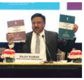
Chief Election Commissioner of India Rajiv Kumar during a Press conference, in New Delhi, on Monday

Just a day ahead of the Lok Sabha elections 2024, Chief Election Commissioner Rajiv Kumar came down heavily on the "mischievous narratives" that could harm the electoral process during the course of the polls. He was responding to a query against the backdrop of allegations and criticism faced by the election commission over alleged delay in release of voter turnout, disclosure of form 17C data and the sanctity of electronic voting machines (EVMs). In a first, the Election Commission held a Press conference on Monday just a